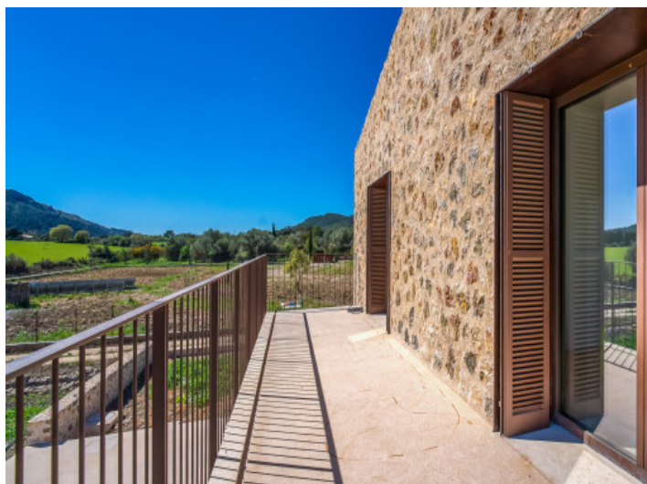
Views from the first floor

All information is correct to the best of our knowledge. Errors and prior sale excepted. This prospectus is purely for information purposes. Only the notarized deed of sale is legally binding.