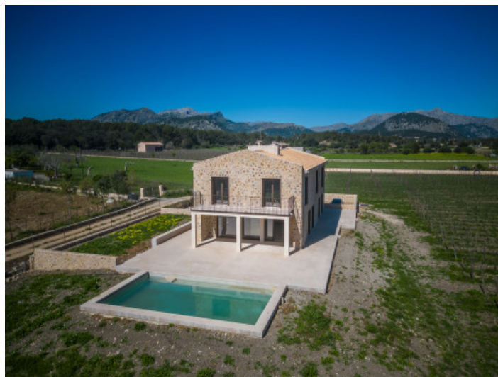
Aerial view to the property