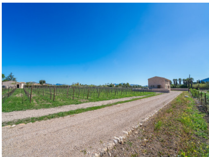
Entrance way to the finca