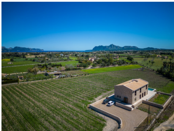
Property with panoramic views to Pollensa bay and Tramuntana mountains