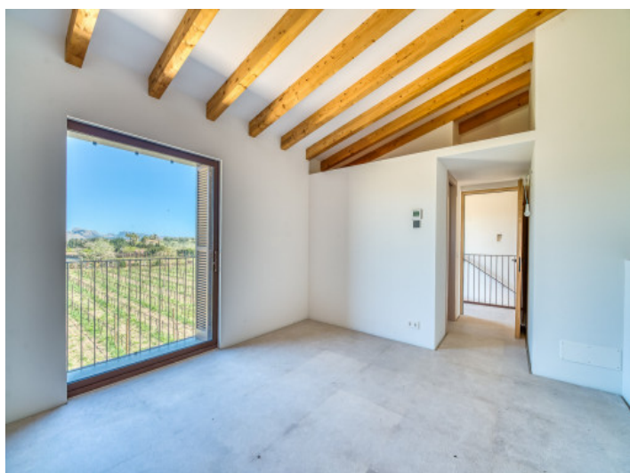
Great views from the bedrooms