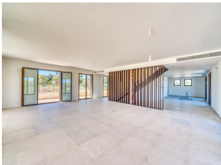
Living and kitchen area