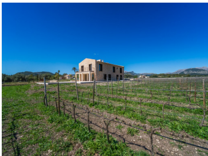
The vineyards around the property