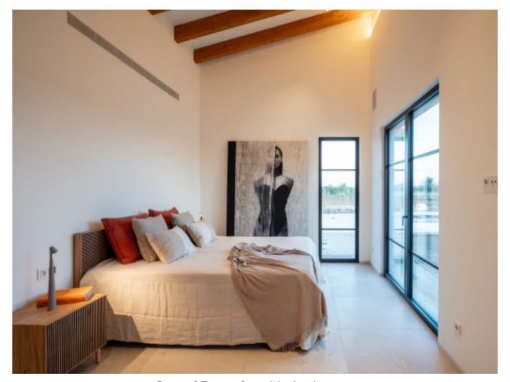
One of 3 comfortable bedrooms