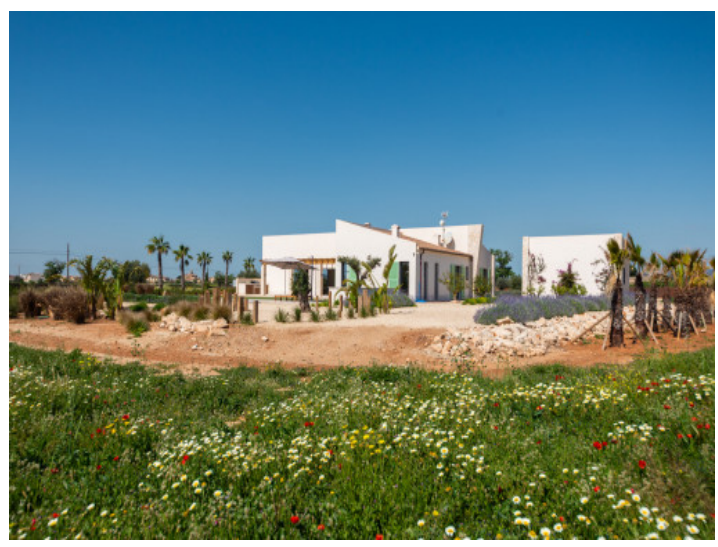
Newly-built finca with Pool