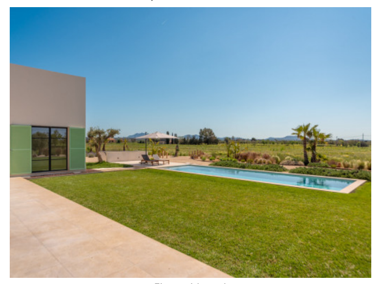
Finca with pool