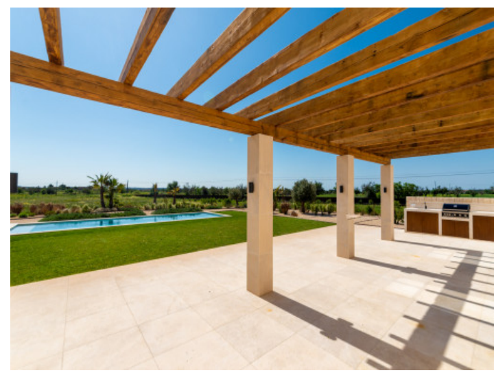
Terrace with barbecue area