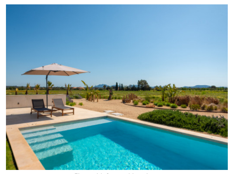
Finca with far-reaching views