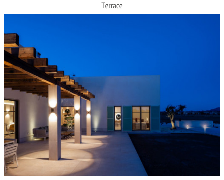
Finca in great location