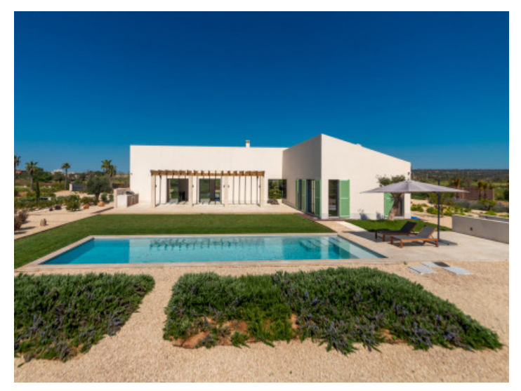
Front view of the finca