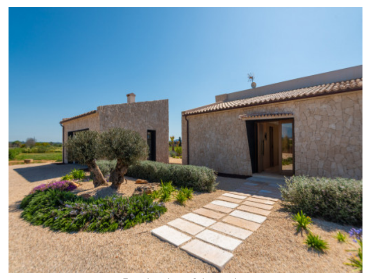
Exterior view of the garden