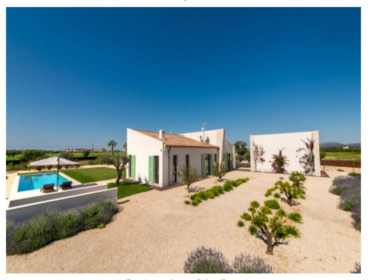
Outdoor view of the finca