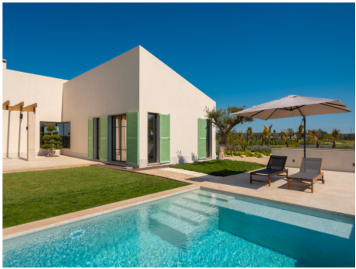
Pool with sun terrace