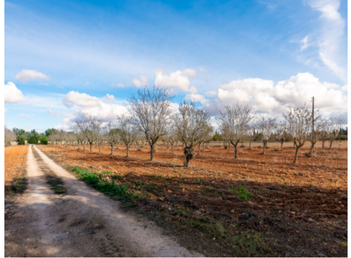
Access to the finca