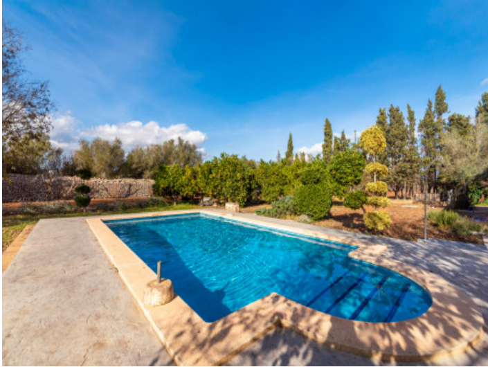
Pool and garden with fruit trees