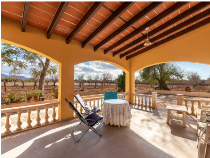
Large covered veranda