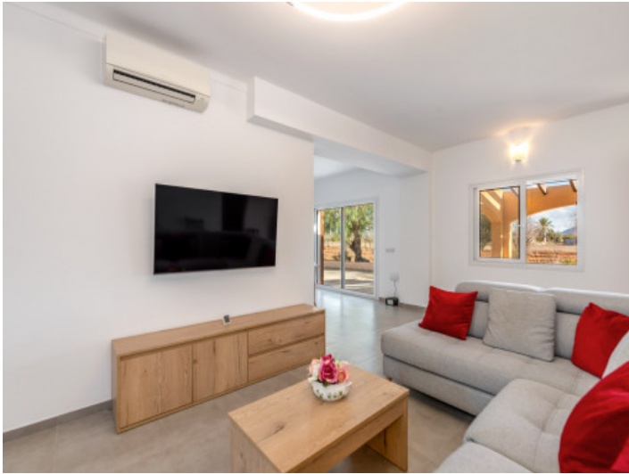
Cosy living area