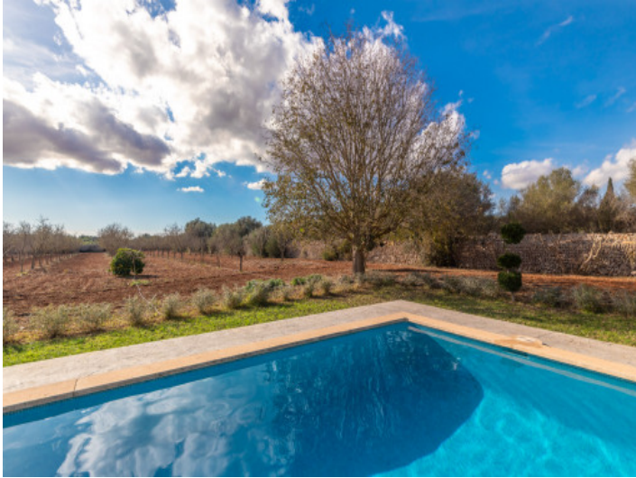
Garden views from the pool