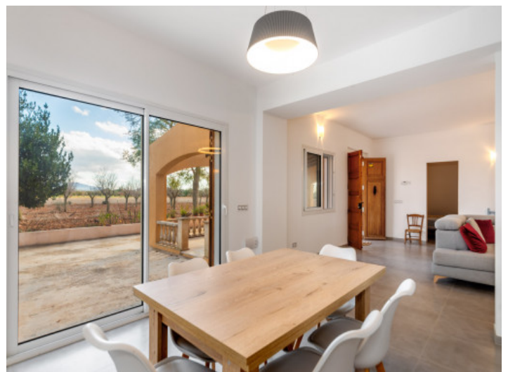
Dining area with terrace access

All information is correct to the best of our knowledge. Errors and prior sale excepted. This prospectus is purely for information purposes. Only the notarized deed of sale is legally binding.