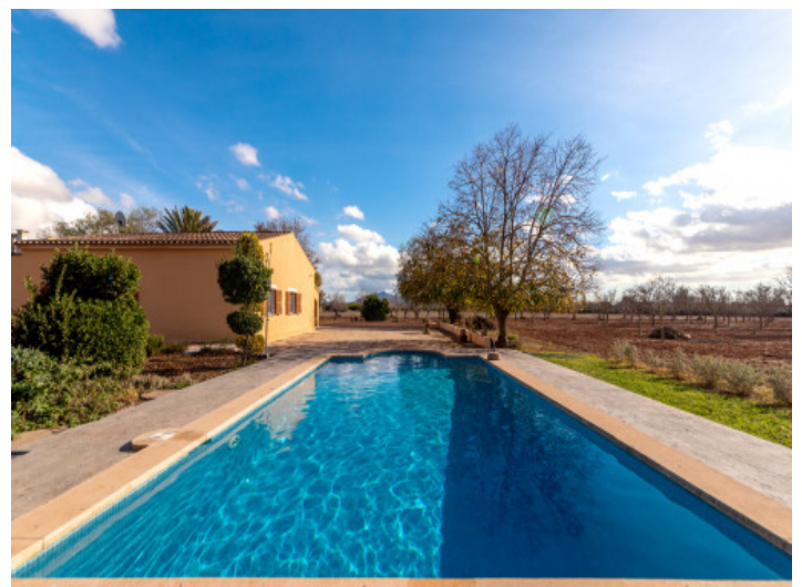
Sunny pool area

All information is correct to the best of our knowledge. Errors and prior sale excepted. This prospectus is purely for information purposes. Only the notarized deed of sale is legally binding.