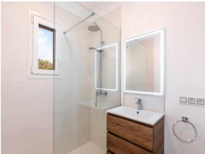
Bathroom with daylight