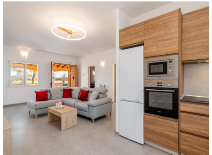
Open living and kitchen area