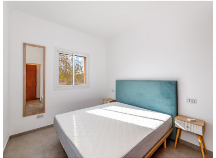
Bedroom with daylight