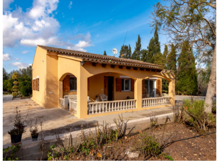
Exterior view of the finca