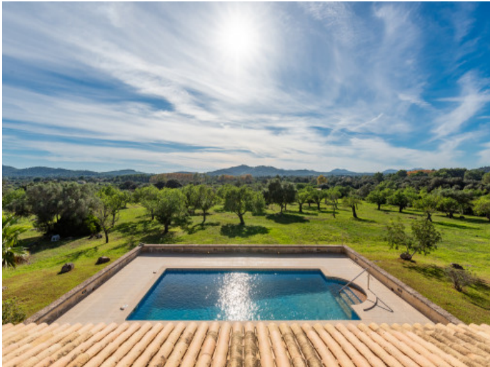
Views to the spacious garden and the pool from the balcony