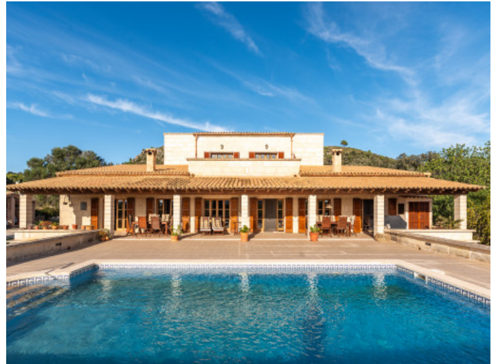
Views from the pool to the terrace