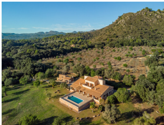
Bird's-eye-views to the finca