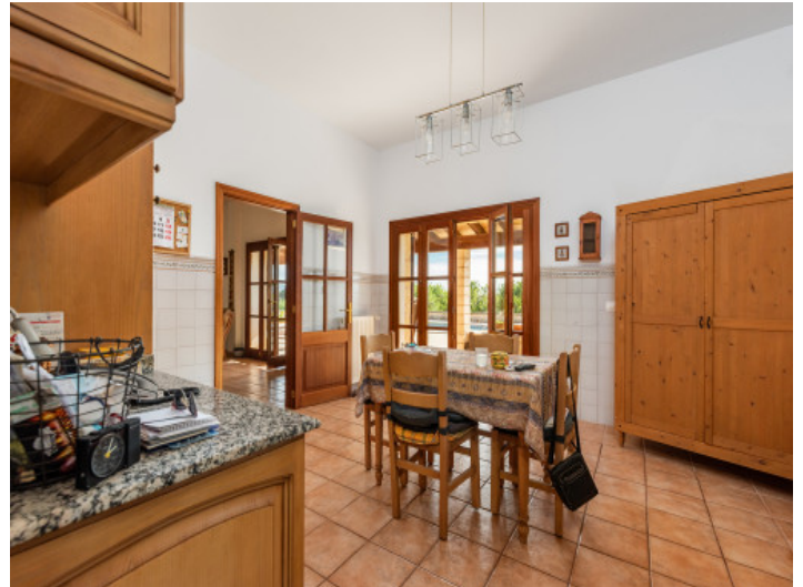
Kitchen with terrace access