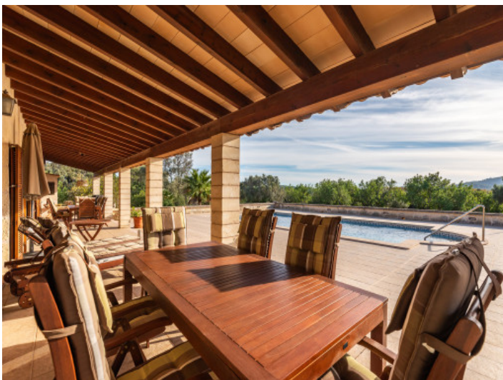
Covered terrace with pool views