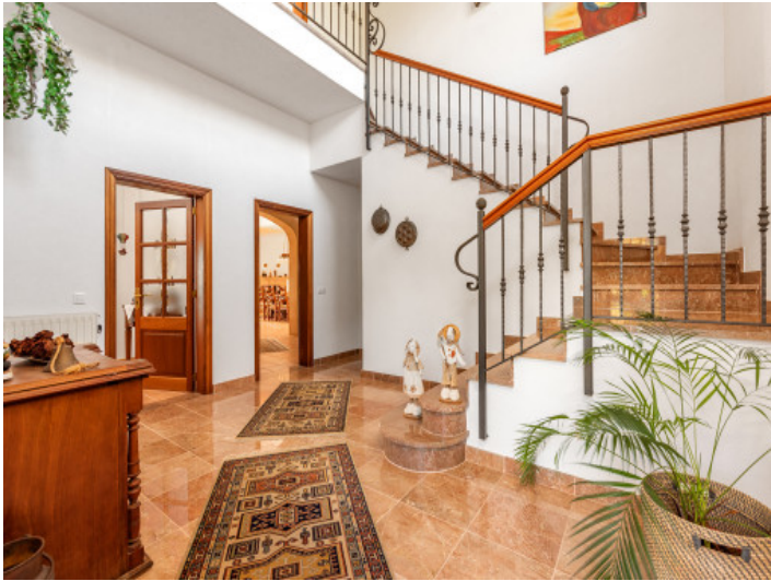
Entrance from the finca