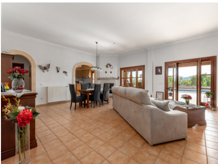
Open living and dining area with terrace access