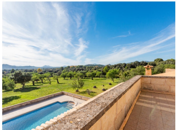
Pool views from the balcony

All information is correct to the best of our knowledge. Errors and prior sale excepted. This prospectus is purely for information purposes. Only the notarized deed of sale is legally binding.