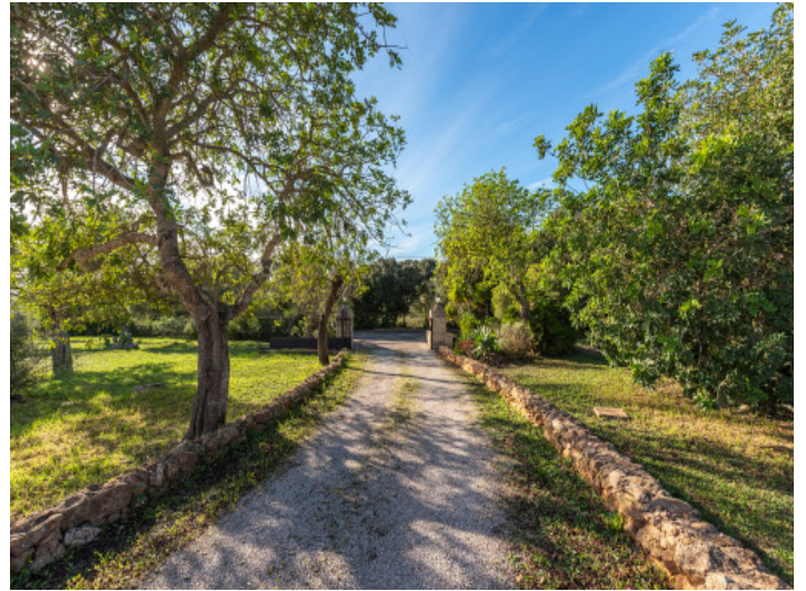
Drive leads to the finca