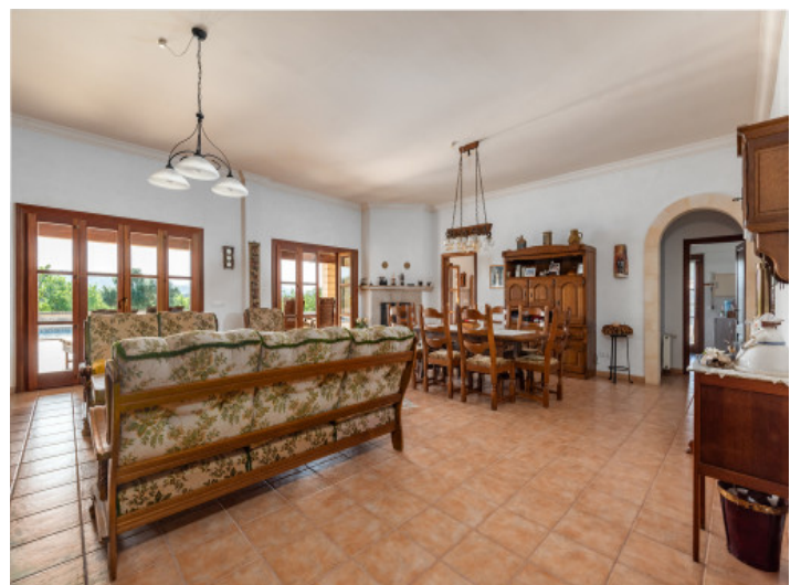
One of two open living and dining areas

All information is correct to the best of our knowledge. Errors and prior sale excepted. This prospectus is purely for information purposes. Only the notarized deed of sale is legally binding.