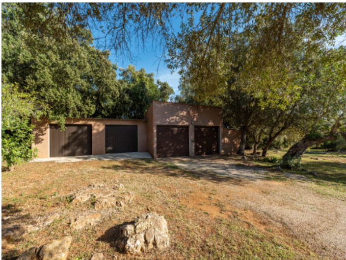
Four garages for the cars