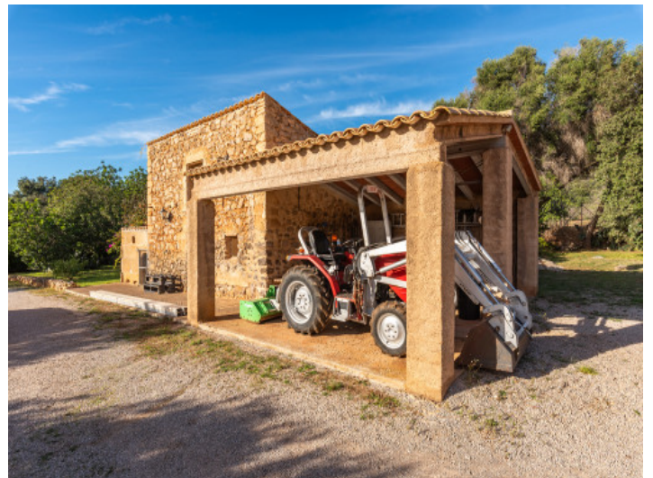
Carport built with natural stones