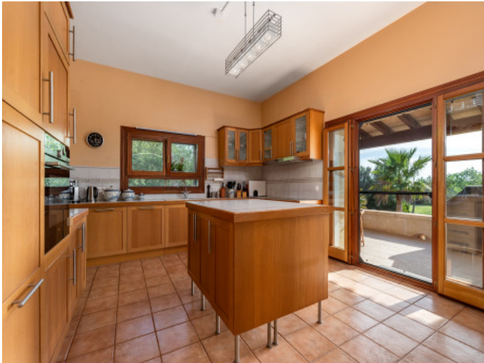
Kitchen with balcony access