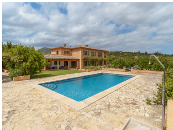
Large, private pool area