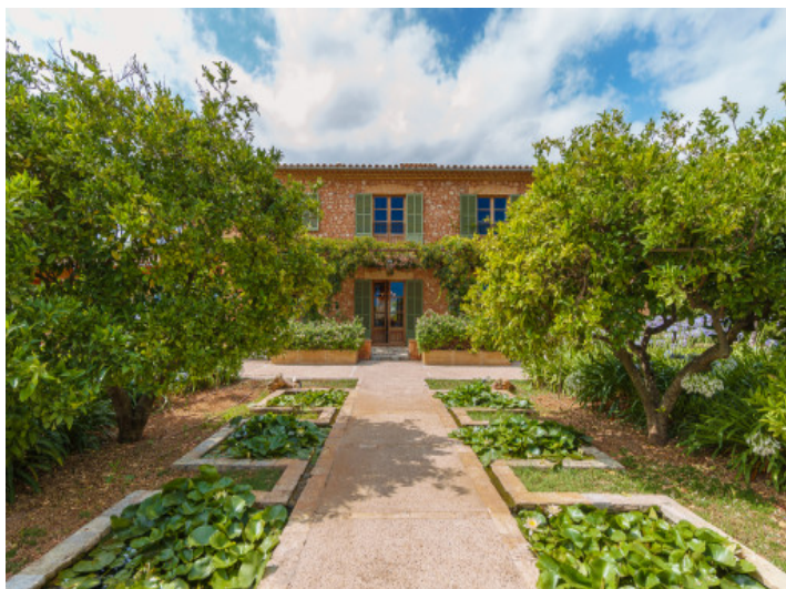
Garden of the finca