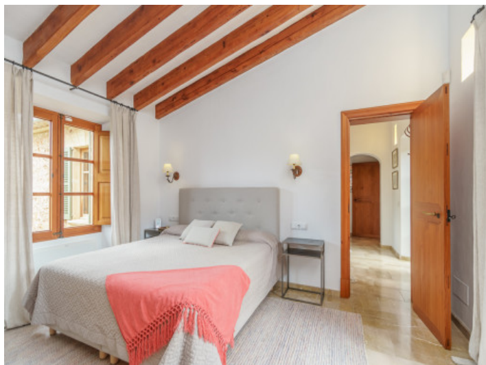
Master bedroom with bathroom en suite