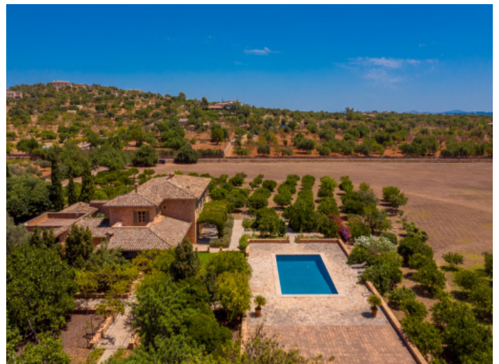
The finca from a bird's-eye view

All information is correct to the best of our knowledge. Errors and prior sale excepted. This prospectus is purely for information purposes. Only the notarized deed of sale is legally binding.