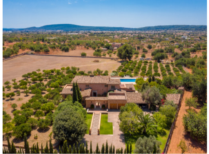
The finca from a bird's-eye view