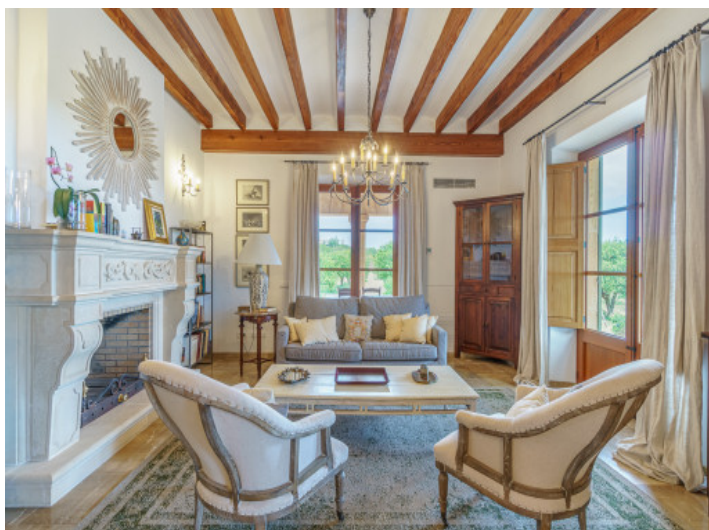
Cozy living area with fireplace