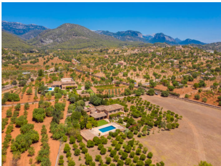
The finca from a bird's-eye view