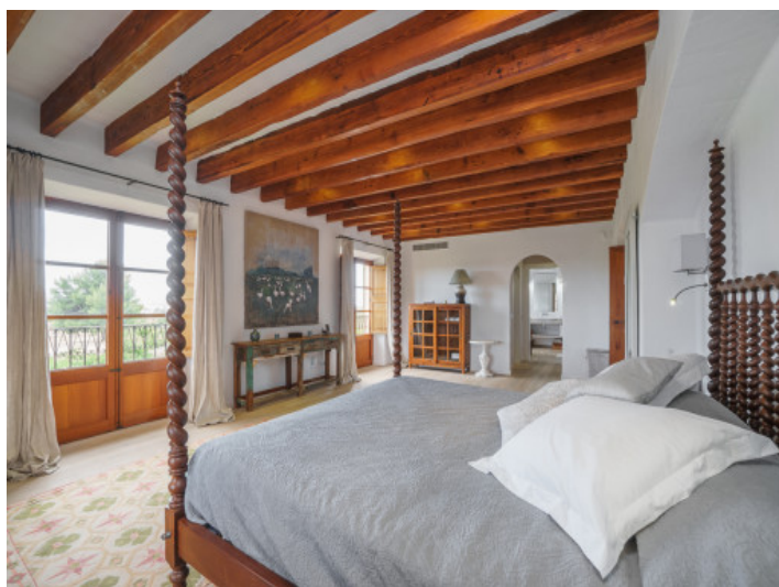
Second bedroom with bathroom en suite