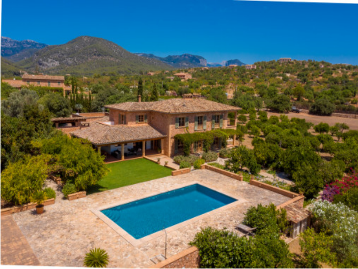
The finca from a bird's-eye view