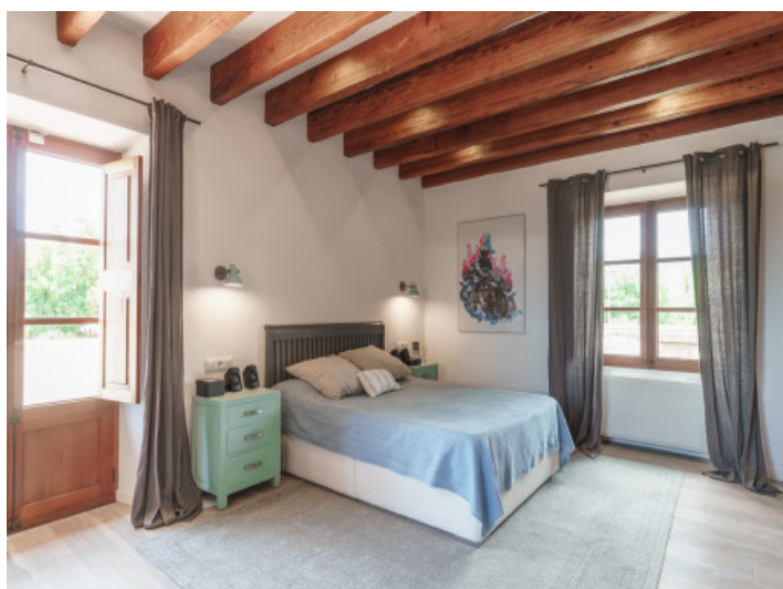
Third double bedroom