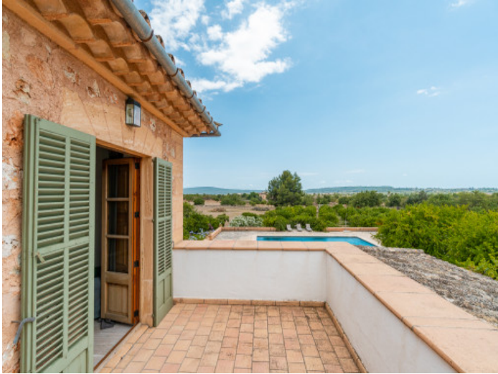
Balcony with a view