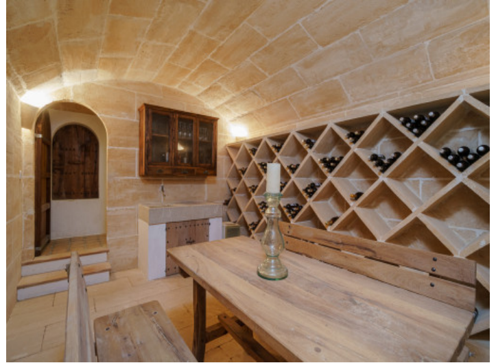
Wine cellar mit vaulted ceiling