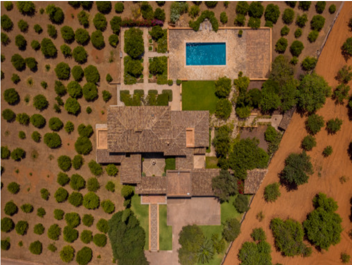
The finca from a bird's-eye view