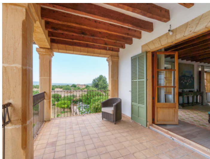
Balcony of the bedroom

All information is correct to the best of our knowledge. Errors and prior sale excepted. This prospectus is purely for information purposes. Only the notarized deed of sale is legally binding.