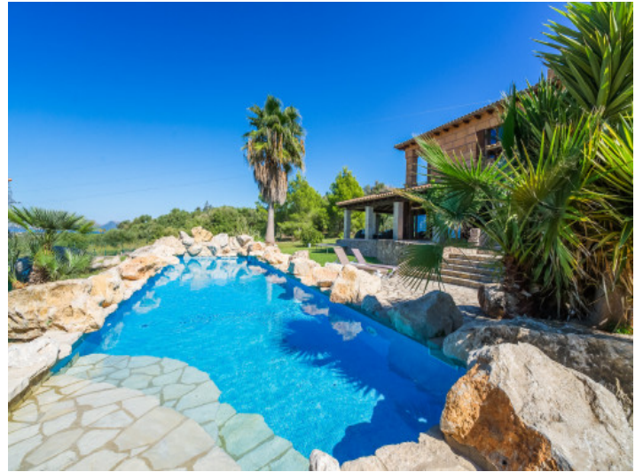
Mediterranean finca with pool and tennis court in Alcudia