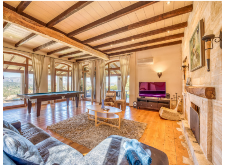
Living area with floor to ceiling windows