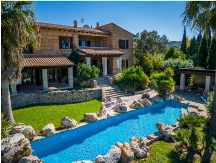
Mediterranean garden with pool