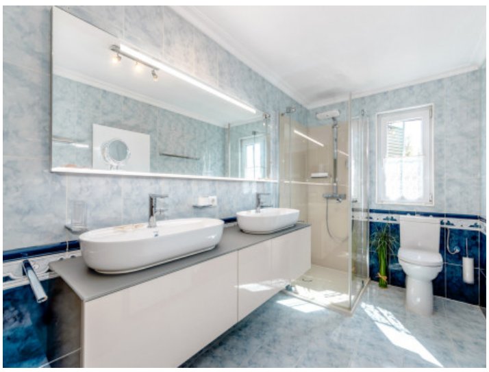
One of 2 bathrooms One of 2 bathrooms. All information is correct to the best of our knowledge. Errors and prior sale excepted. This prospectus is purely for information purposes. Only the notarized deed of sale is legally binding.