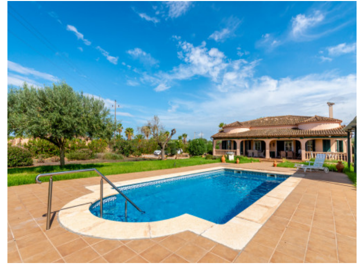
Country house with pool