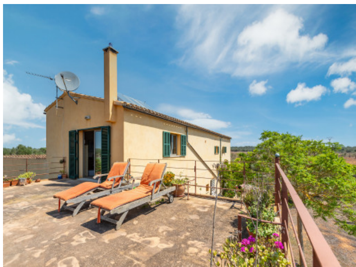
Spacious roof terrace