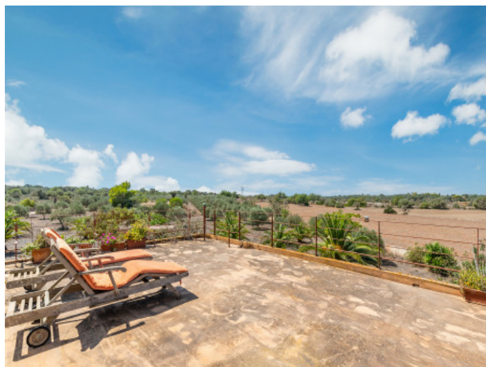
Roof terrace with sweeping views

All information is correct to the best of our knowledge. Errors and prior sale excepted. This prospectus is purely for information purposes. Only the notarized deed of sale is legally binding.