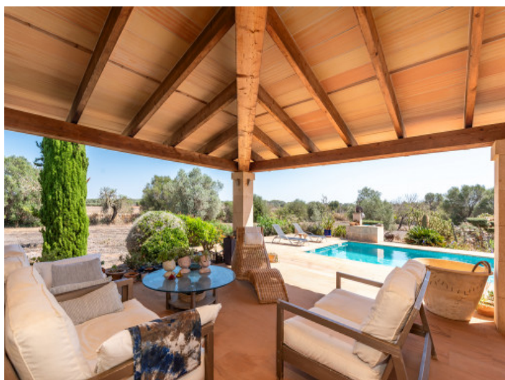
Covered lounge area