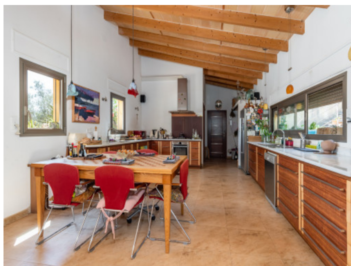
Kitchen with dining area

All information is correct to the best of our knowledge. Errors and prior sale excepted. This prospectus is purely for information purposes. Only the notarized deed of sale is legally binding.