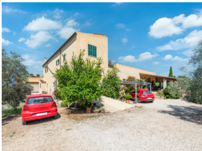
Access to the house