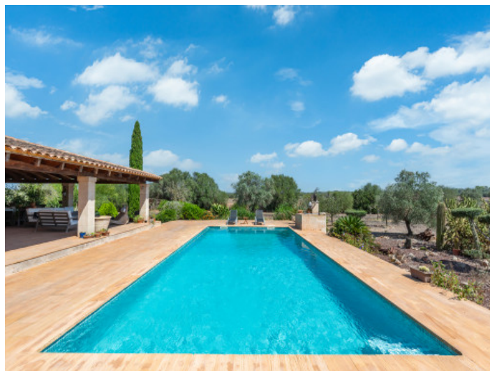
Tranquil pool area