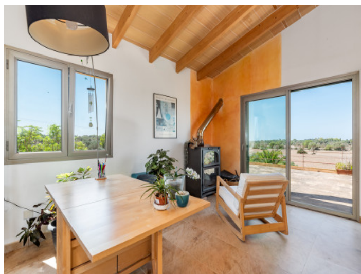
Access to the terrace