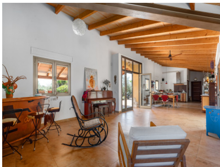
Open living and entrance area