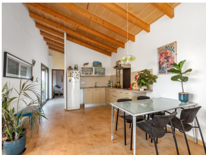
Kitchen with dining area