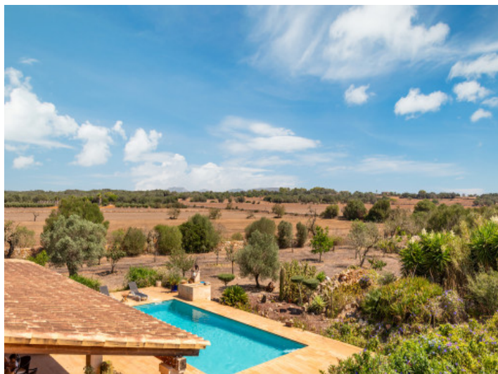
Unique landscape views from the finca