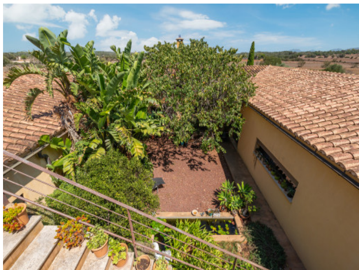
Access to the guest apartment