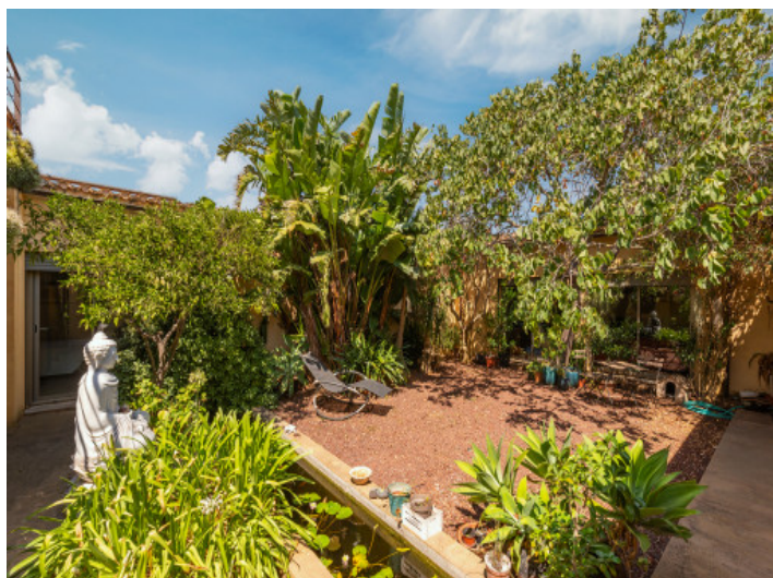
Patio in the centre of the house