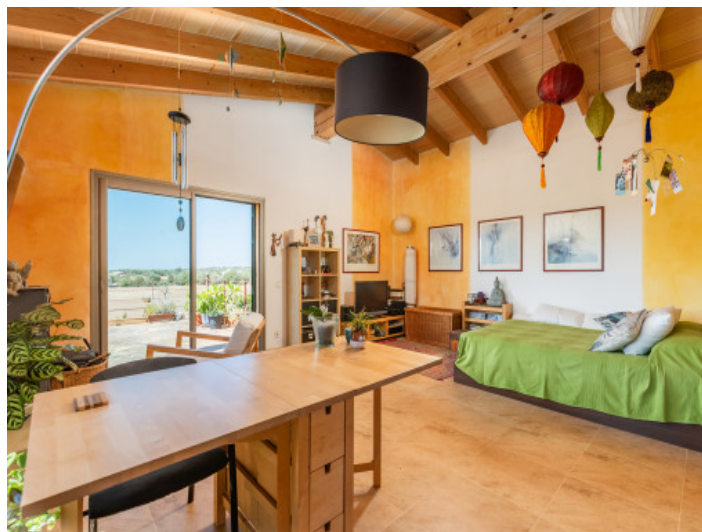
Separate guest apartment