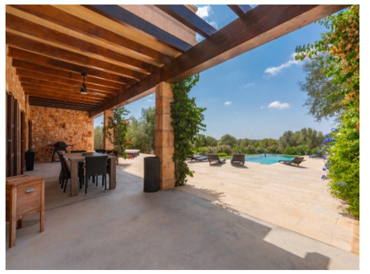
Spacious covered terrace

All information is correct to the best of our knowledge. Errors and prior sale excepted. This prospectus is purely for information purposes. Only the notarized deed of sale is legally binding.