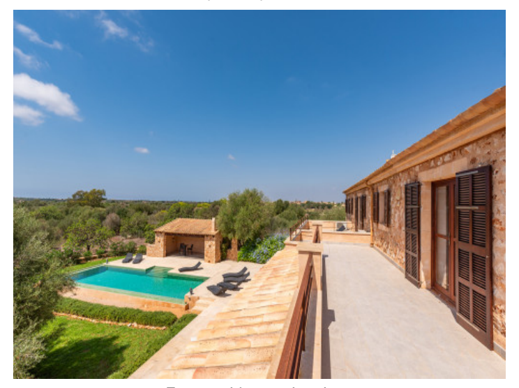
Terrace with sweeping views