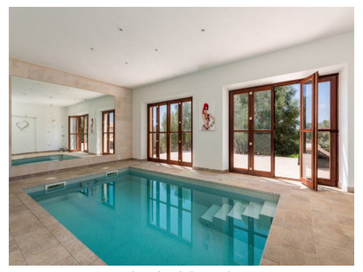
Luxurious indoor pool