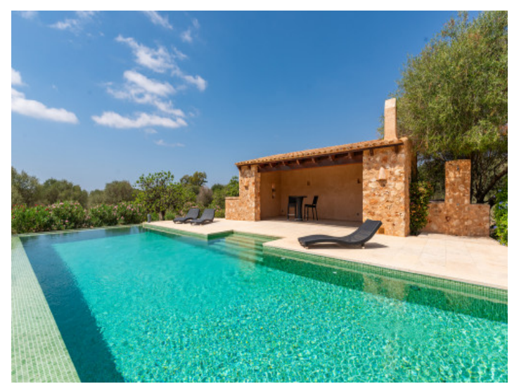
Practical pool house