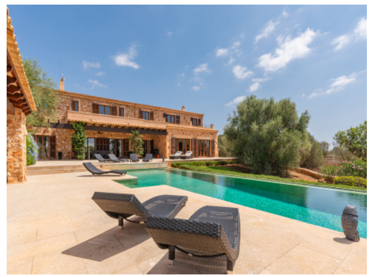
Exterior view and pool