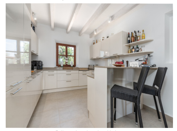
Fully equipped modern kitchen