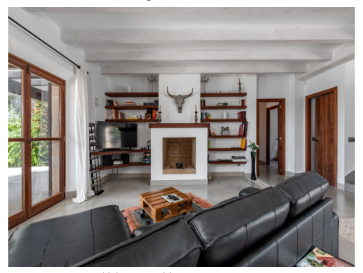
Living area with access to a terrace