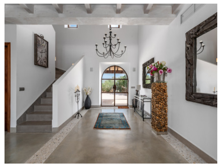
Elegant entrance area