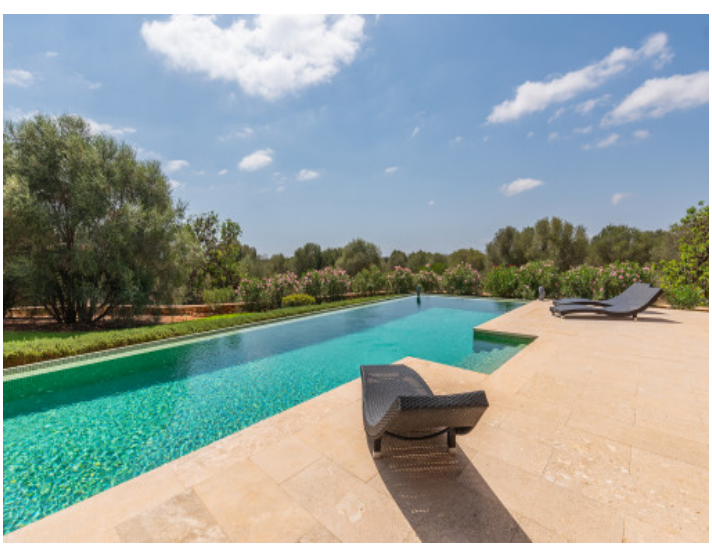
Large pool surrounded by nature