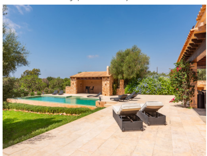
Splendid pool area