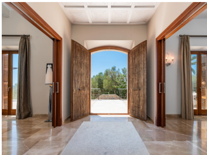
Beautiful entrance area