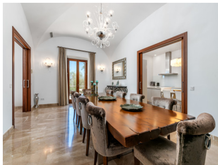
Dining area with high ceilings