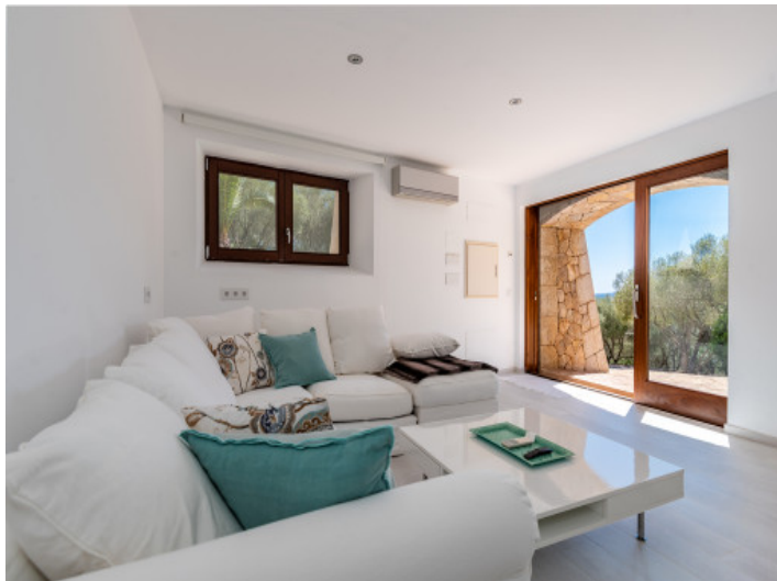
Living area with access to a terrace