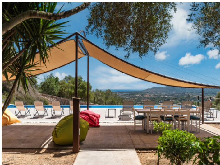
Tranquil chillout pool terrace