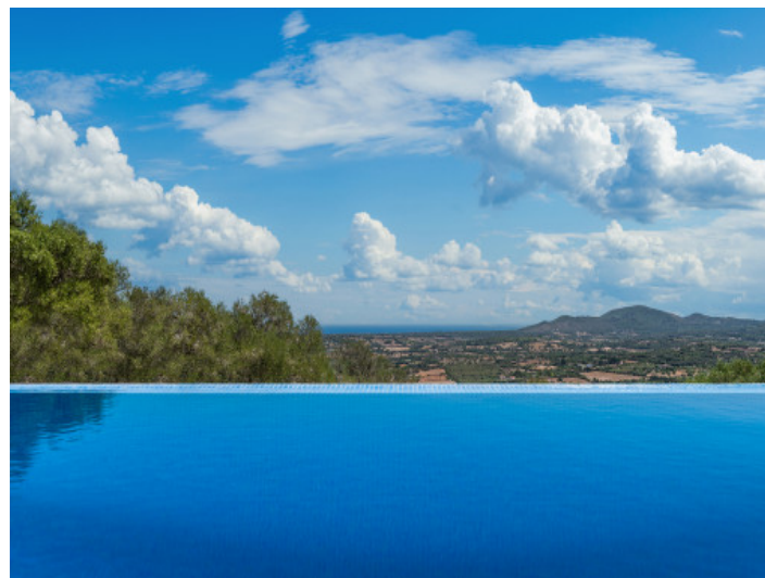
Infinity pool with stunning views