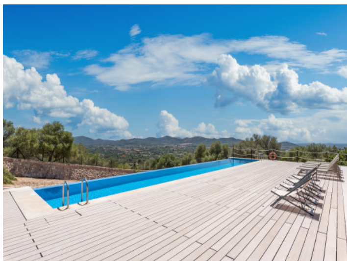
Pool in a unique location