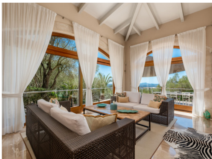
Additional living area