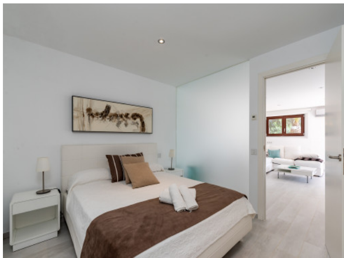
Modern-style double bedroom