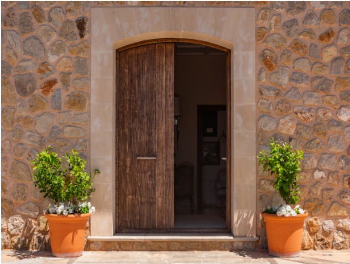
Entrance to the finca