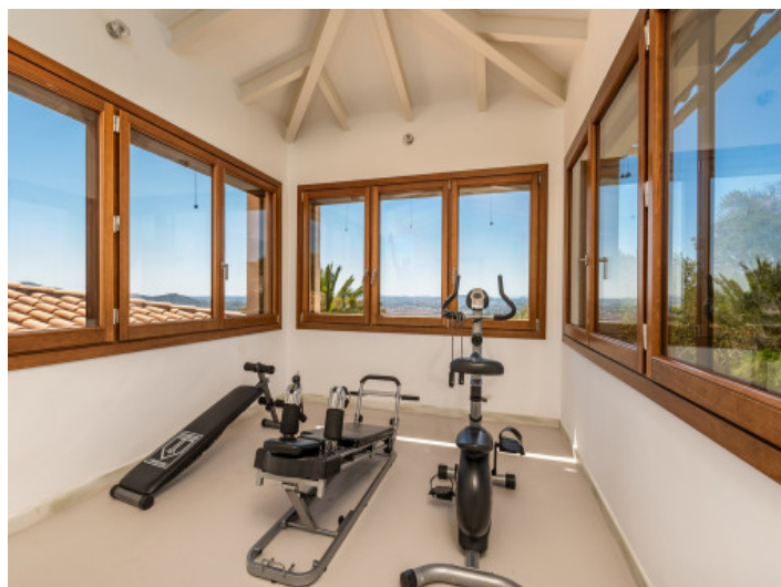
Gym with magnificent views

All information is correct to the best of our knowledge. Errors and prior sale excepted. This prospectus is purely for information purposes. Only the notarized deed of sale is legally binding.