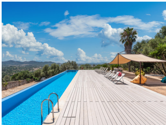
Very large pool