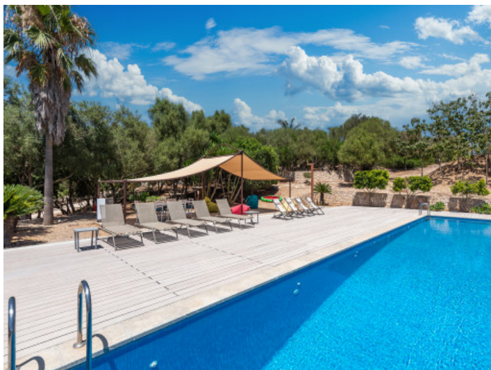
Fantastic sun terrace