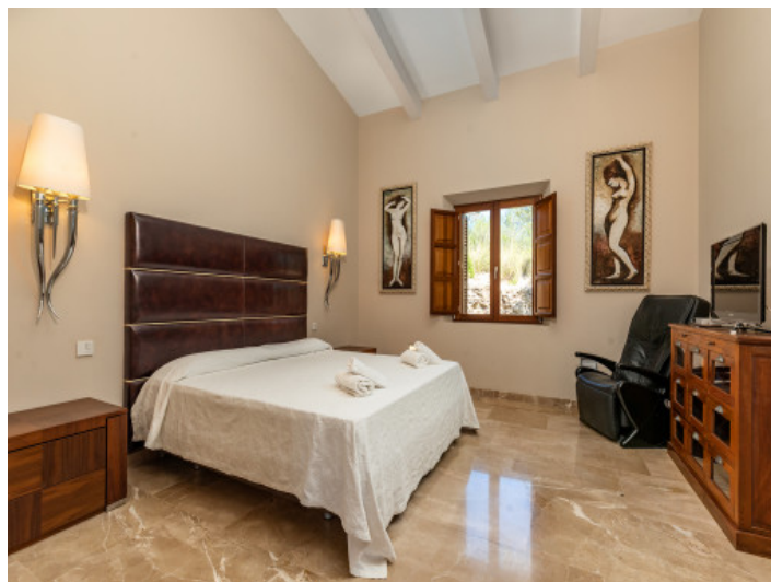
Spacious double bedroom