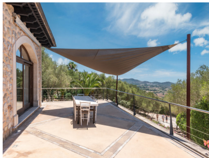
Terrace with outdoor dining area

All information is correct to the best of our knowledge. Errors and prior sale excepted. This prospectus is purely for information purposes. Only the notarized deed of sale is legally binding.