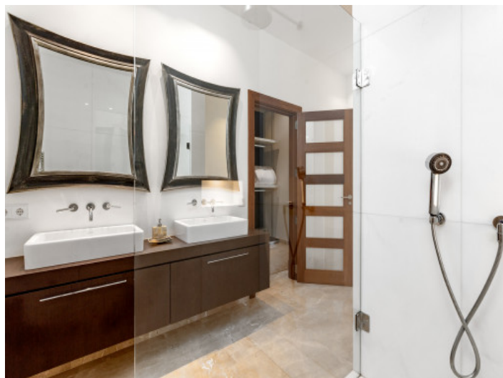
Bathroom with two sinks