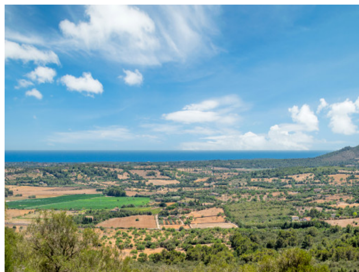
Sweeping views as far as the sea