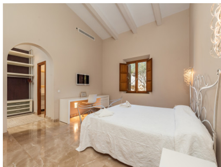
Double bedroom with dressing room

All information is correct to the best of our knowledge. Errors and prior sale excepted. This prospectus is purely for information purposes. Only the notarized deed of sale is legally binding.