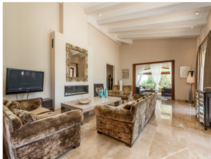
Luxurious living area