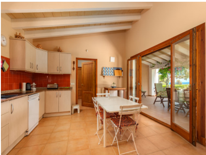
Bright kitchen with garden views