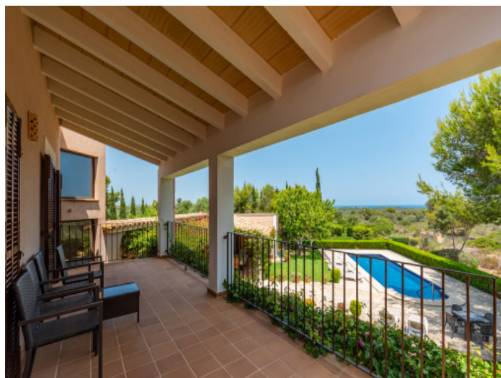
Balcony with pool and sea view

All information is correct to the best of our knowledge. Errors and prior sale excepted. This prospectus is purely for information purposes. Only the notarized deed of sale is legally binding.