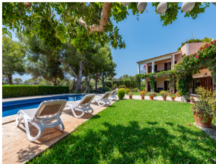
Beautiful garden and pool area