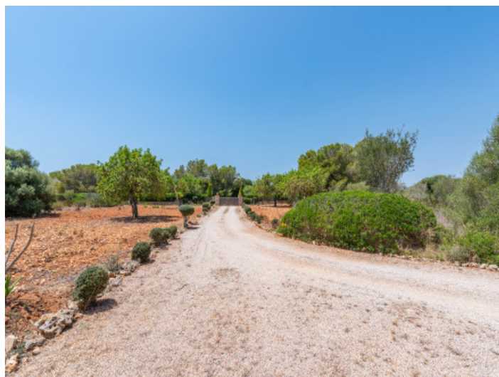
Drive way to the property

All information is correct to the best of our knowledge. Errors and prior sale excepted. This prospectus is purely for information purposes. Only the notarized deed of sale is legally binding.