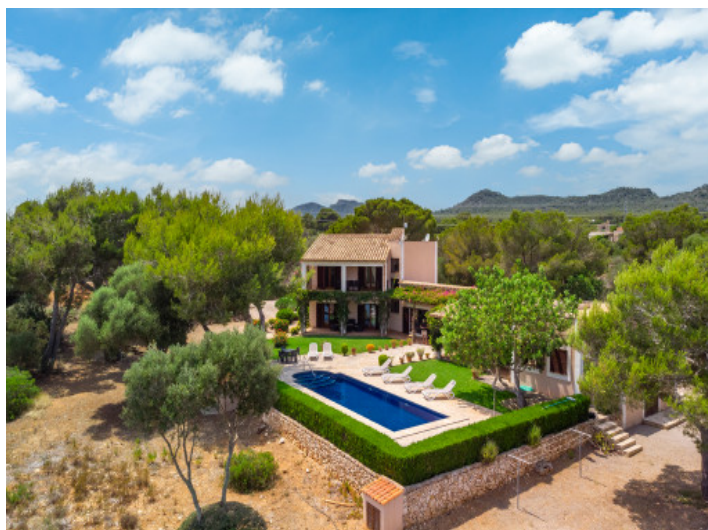
Finca from a birds-eye view