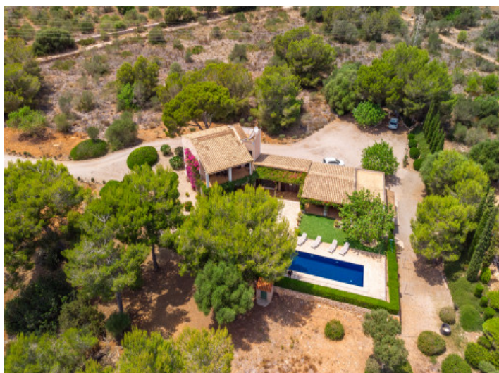
Finca from a birds-eye view