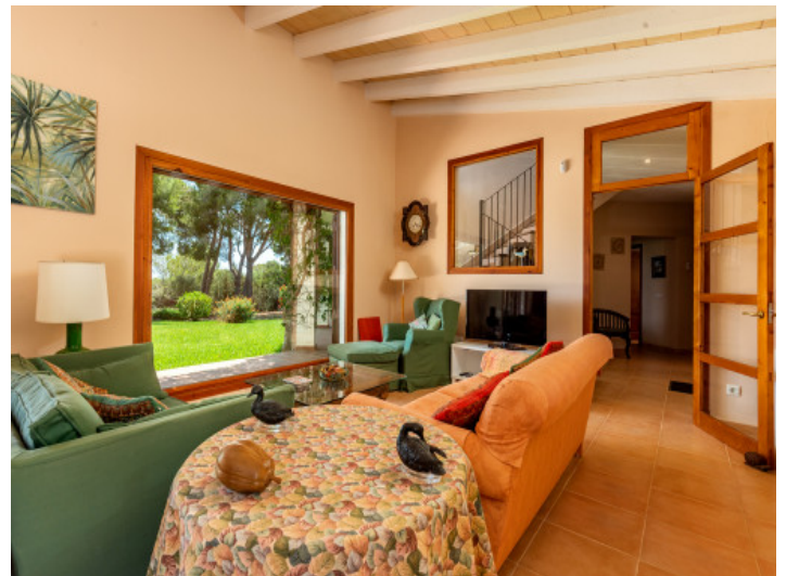
Open living and dining area with garden access