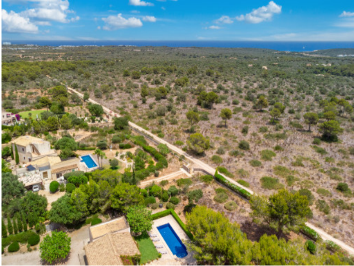
Finca from a birds-eye view