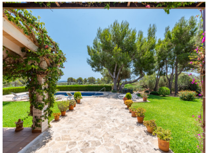
Very nice garden

All information is correct to the best of our knowledge. Errors and prior sale excepted. This prospectus is purely for information purposes. Only the notarized deed of sale is legally binding.