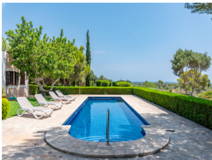
Natural stone flooring around the pool