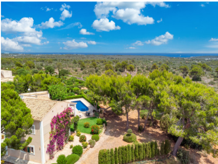
Finca from a birds-eye view