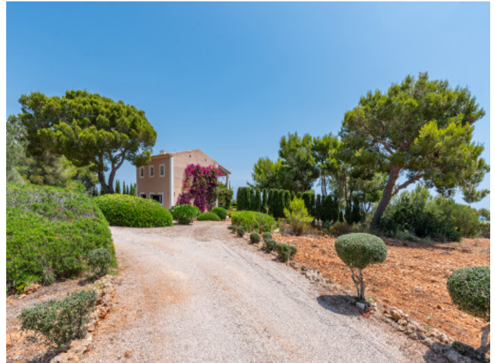
Driveway to the finca