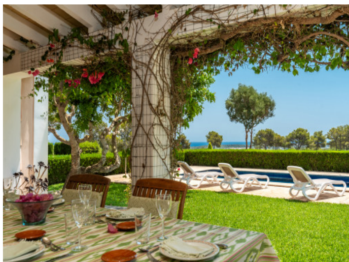
Covered dining area