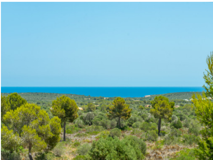
Splendid sea view