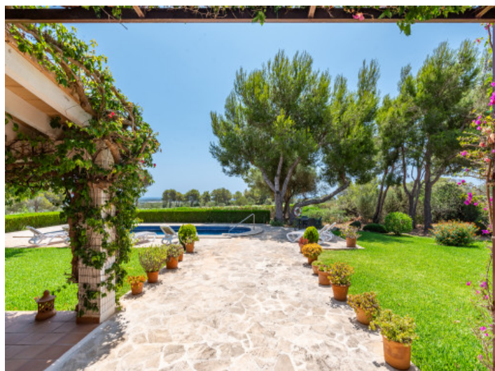
Very nice garden

All information is correct to the best of our knowledge. Errors and prior sale excepted. This prospectus is purely for information purposes. Only the notarized deed of sale is legally binding.