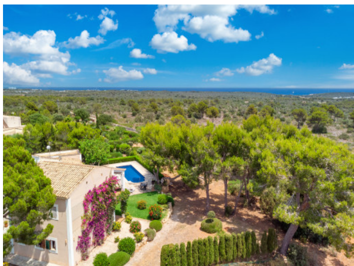
Finca from a birds-eye view