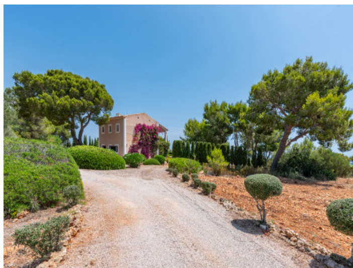
Driveway to the finca