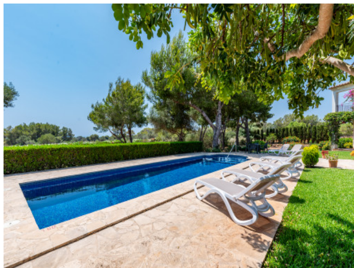
Pool area with sun loungers