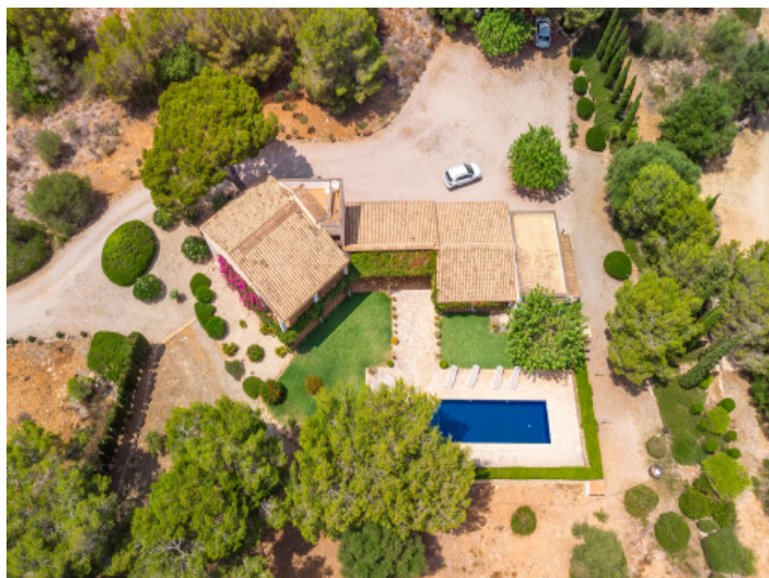
Finca from a birds-eye view