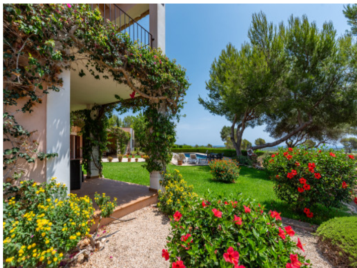
Old tree and plant population