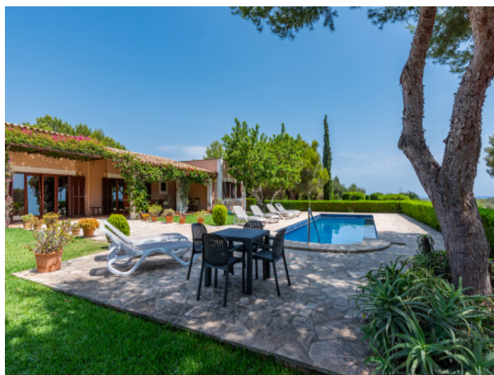
Inviting pool area