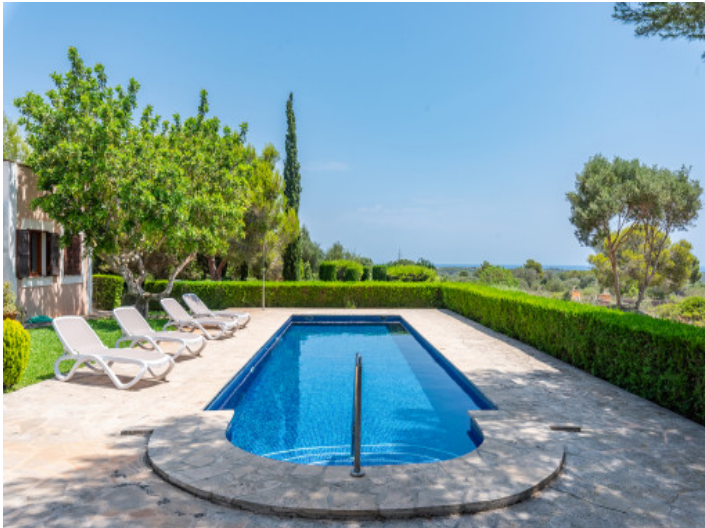
Natural stone flooring around the pool