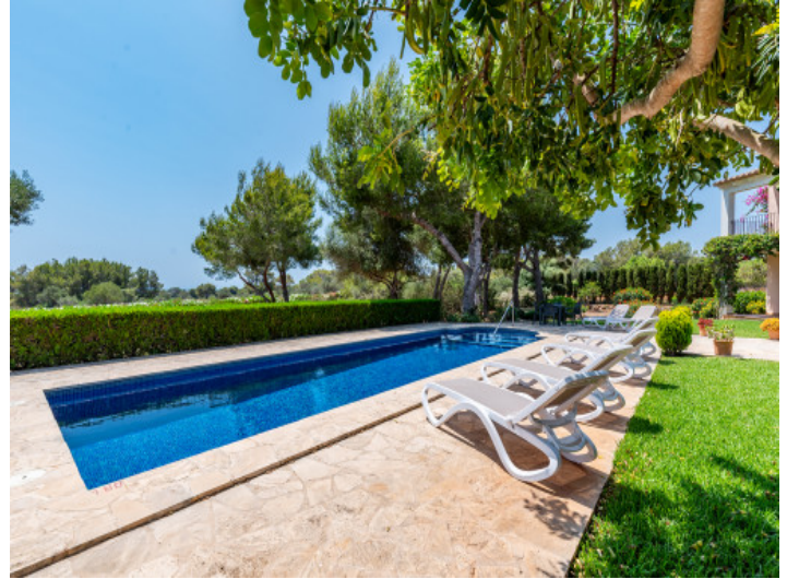
Pool area with sun loungers