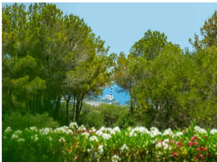
Amazing sea view