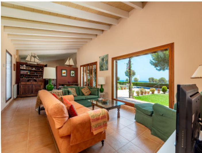
Open living and dining area with garden access