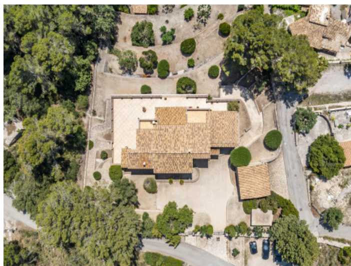
Finca from a birds-eye view