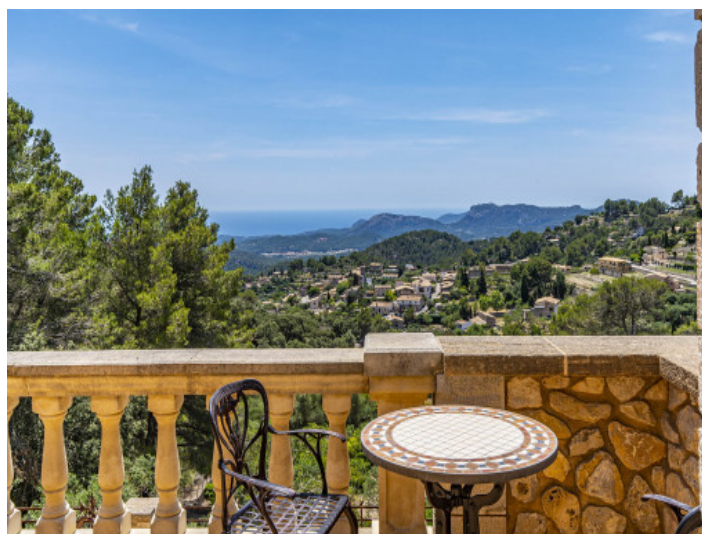
Splendid landscape view