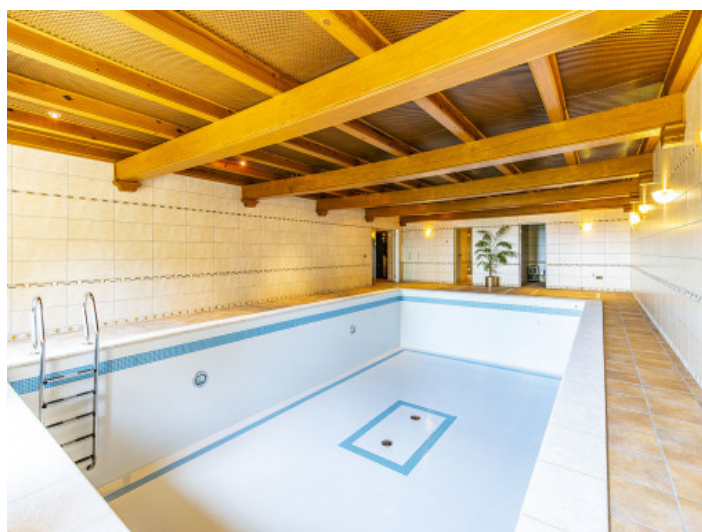
Fantastic indoor pool

All information is correct to the best of our knowledge. Errors and prior sale excepted. This prospectus is purely for information purposes. Only the notarized deed of sale is legally binding.