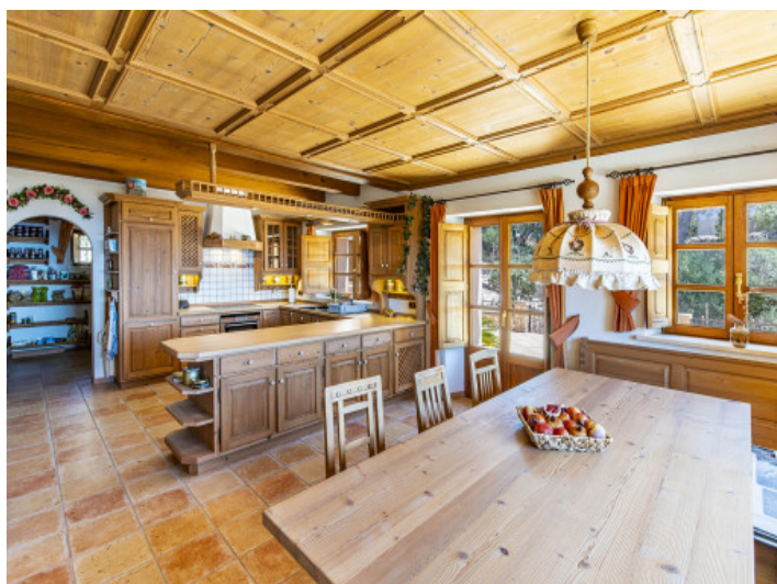
Rustic kitchen and dining area