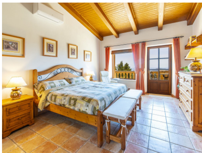
Light flooded master bedroom