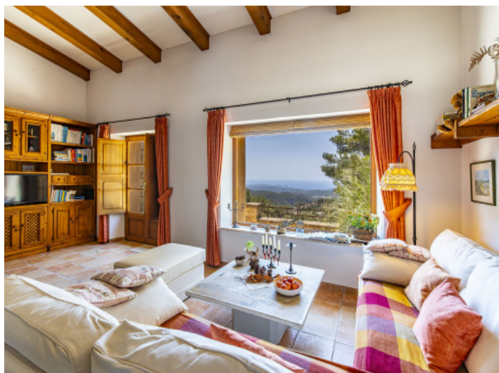
Living area with picturesque views