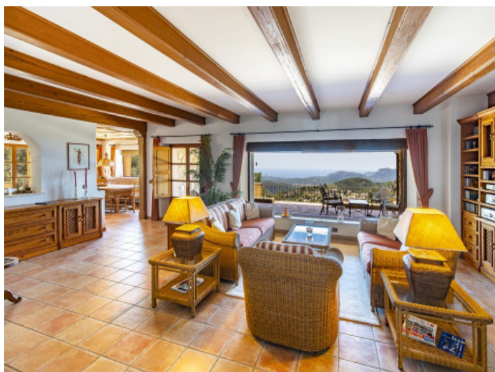
Living area with picturesque views