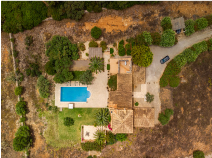
View from above