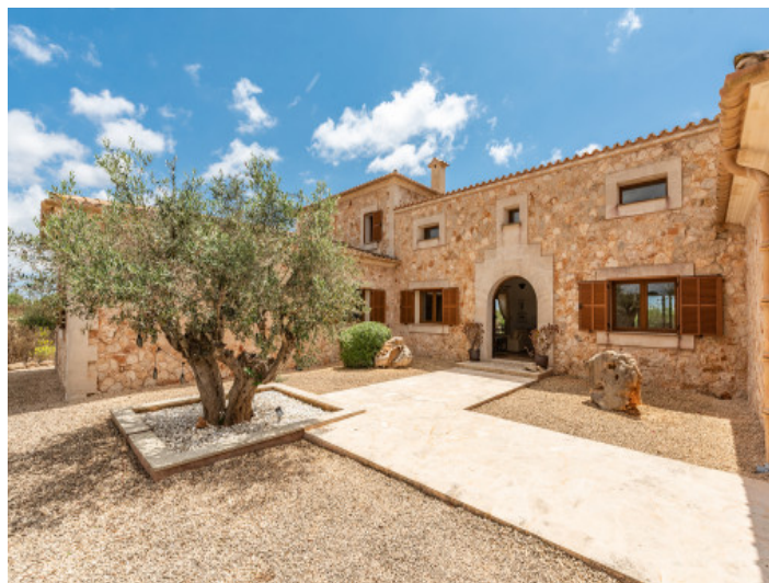
Beautiful finca with pool and garage surrounded by nature in Santanyi