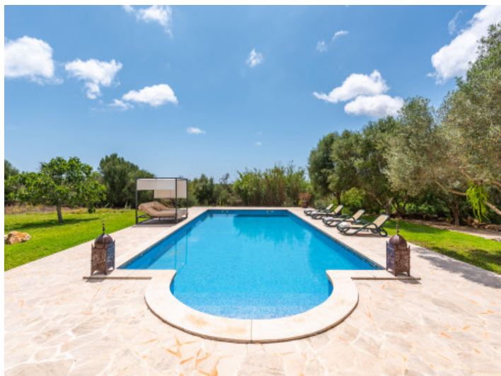
Splendid pool area