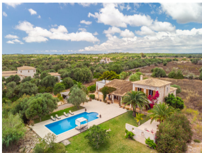
View from above