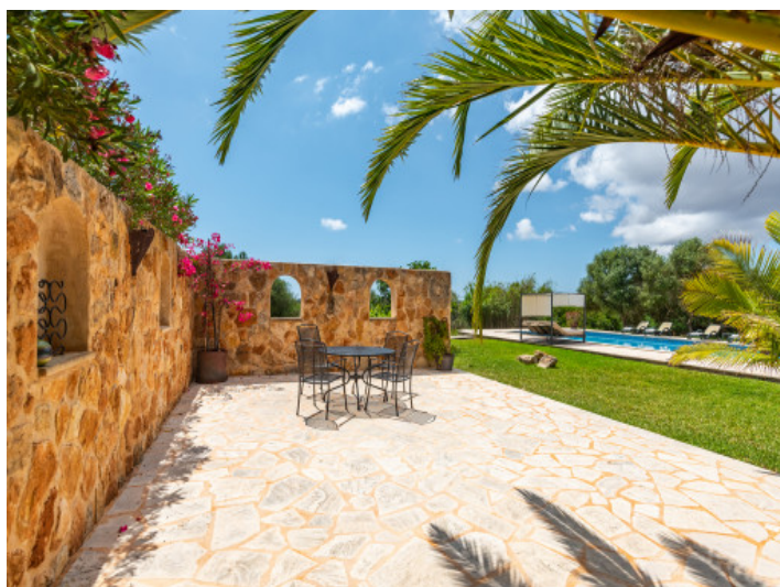
Spacious sunny terrace