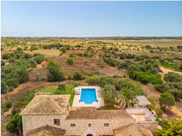
View from above