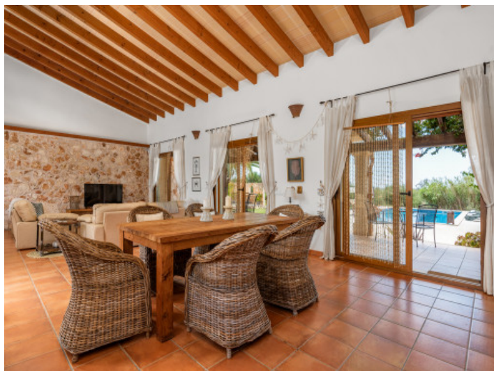
Spacious dining area