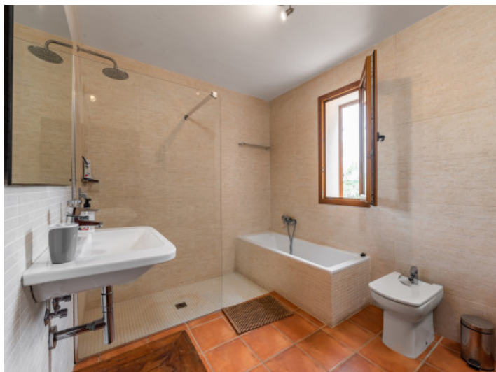
One of 4 bathrooms