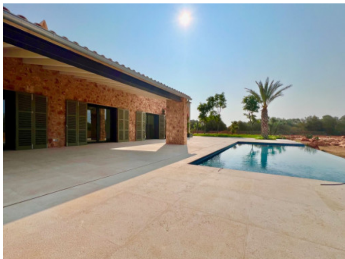
Large pool area