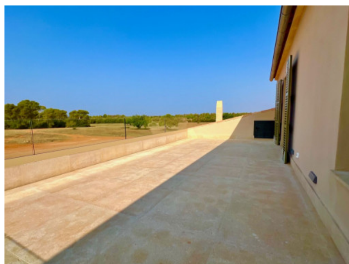
Balcony with views