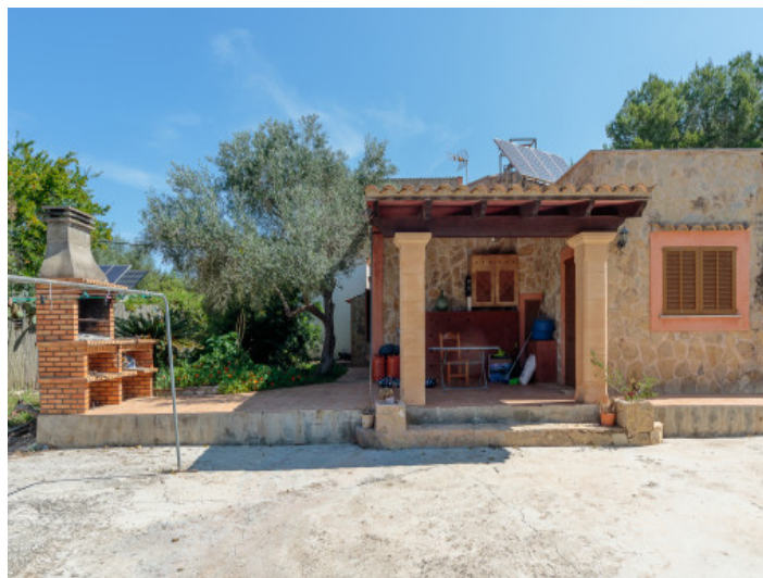
Terrace with barbecue area