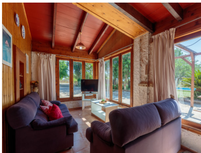
Cozy living and dining area