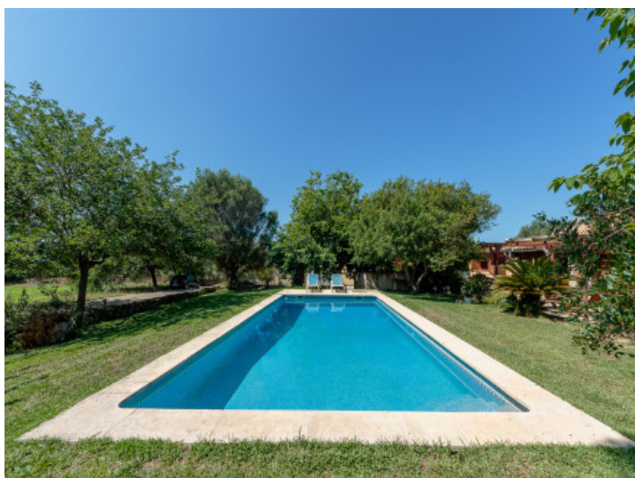
Inviting pool area