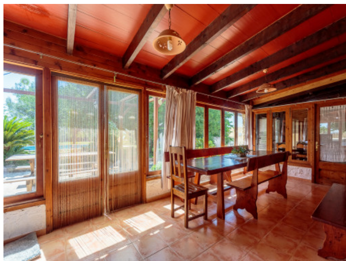
Cozy living and dining area

All information is correct to the best of our knowledge. Errors and prior sale excepted. This prospectus is purely for information purposes. Only the notarized deed of sale is legally binding.