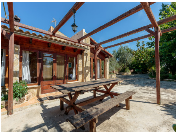
Dining area on the terrace