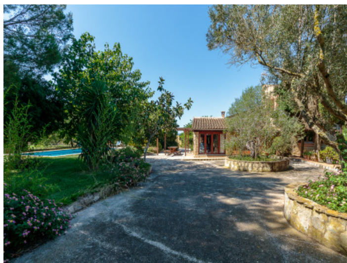
Driveway to the finca

All information is correct to the best of our knowledge. Errors and prior sale excepted. This prospectus is purely for information purposes. Only the notarized deed of sale is legally binding.