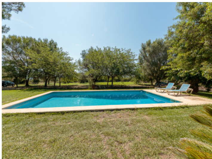
Pool and garden area