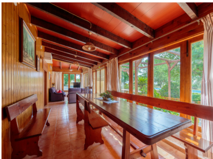
Cozy living and dining area