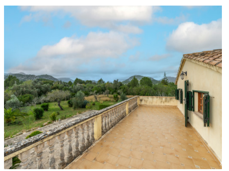
Landscape views from the balcony