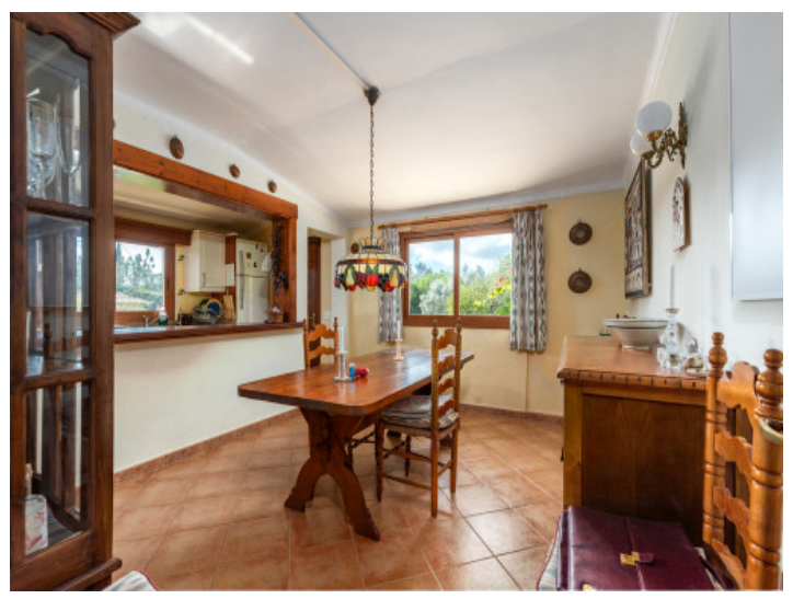
Open kitchen and dining area