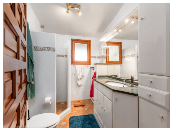
Bathroom with daylight

All information is correct to the best of our knowledge. Errors and prior sale excepted. This prospectus is purely for information purposes. Only the notarized deed of sale is legally binding.