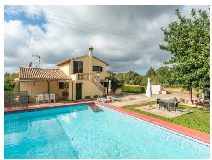
Villa with a large plot and pool in Pollensa