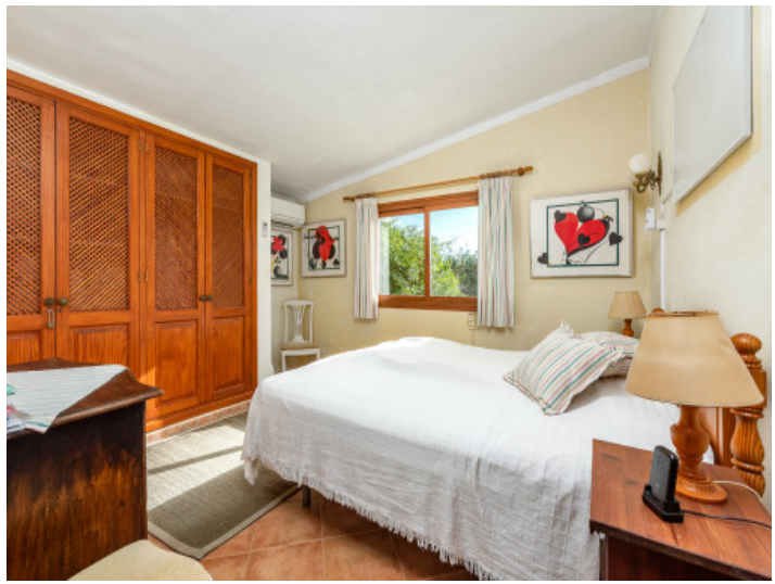
Bedroom with built-in wardrobe