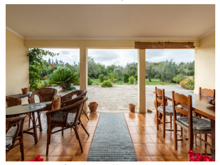
Covered terrace with garden views