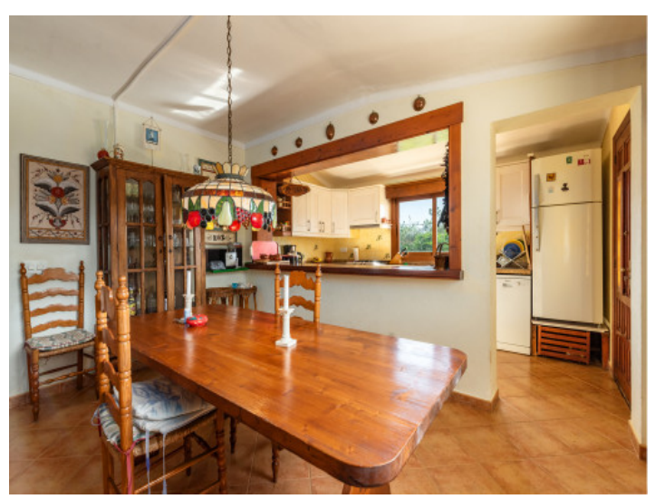
Dining area with views to the kitchen