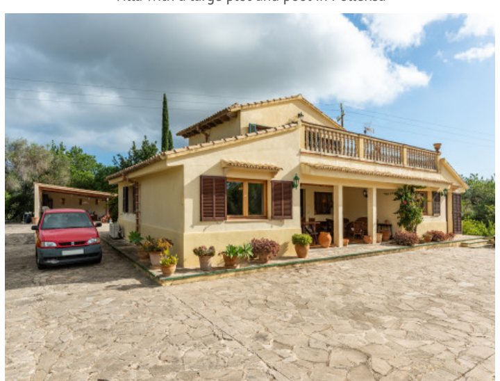
Ample terrace with parking space