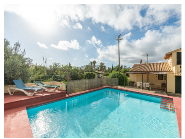
Pool surrounded by a terrace