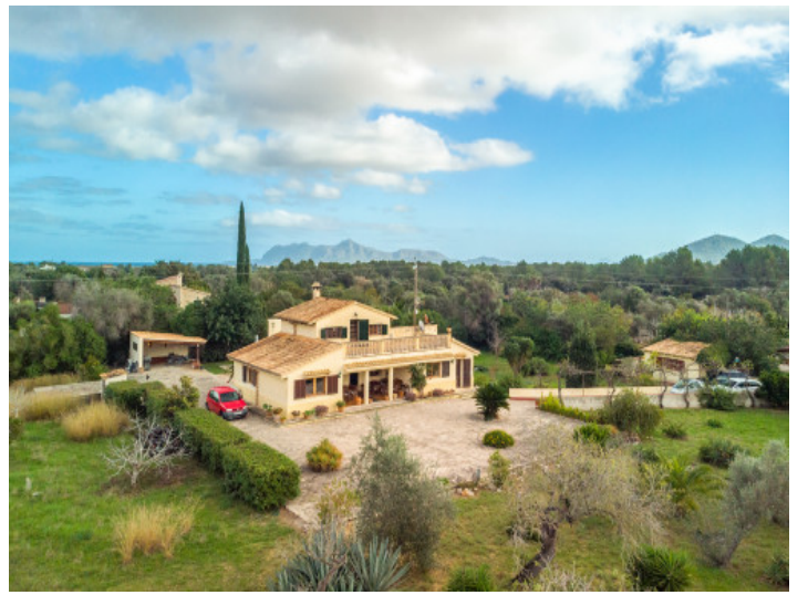
Views from the garden to the villa