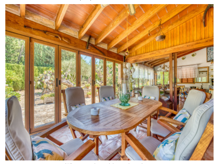
Wintergarden with garden views