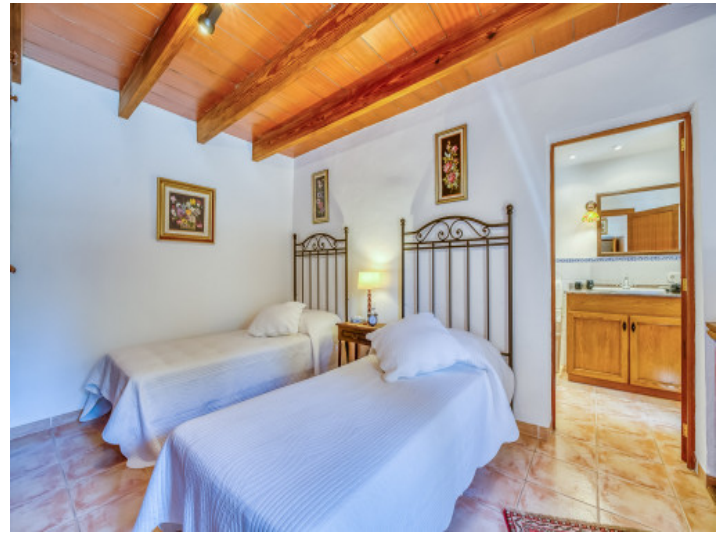
Bedroom with en suite bathroom