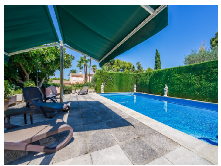
Tranquil pool and terrace acecss