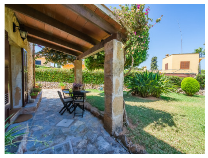
Terrace and garden