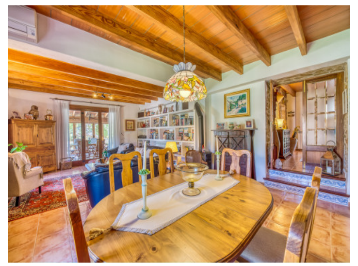
Open dining area