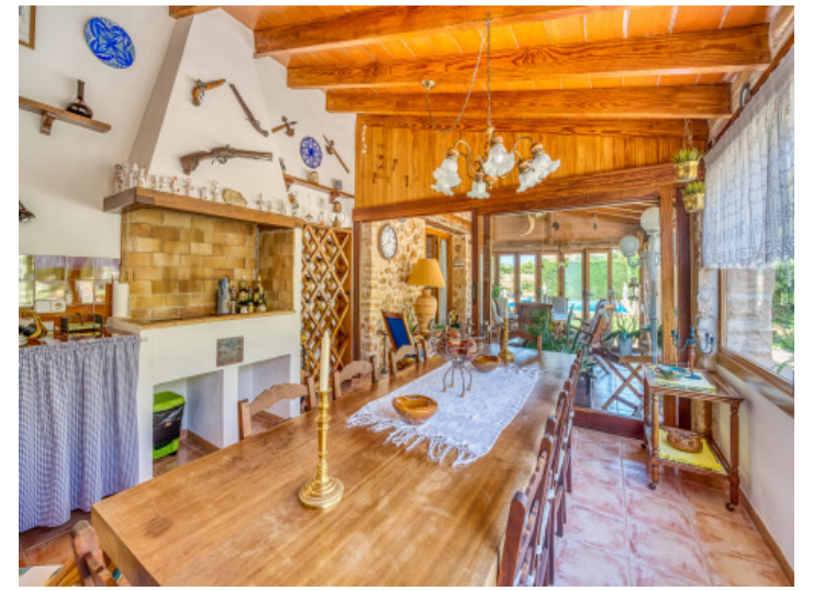
Rustic wintergarden kitchen