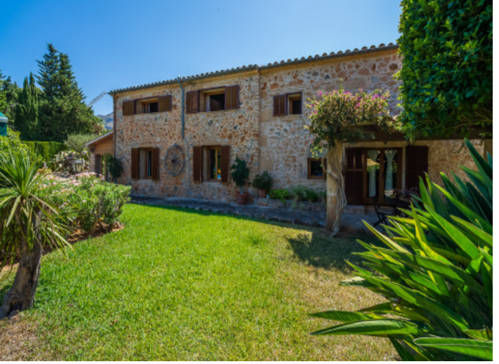
Garden and exterior view