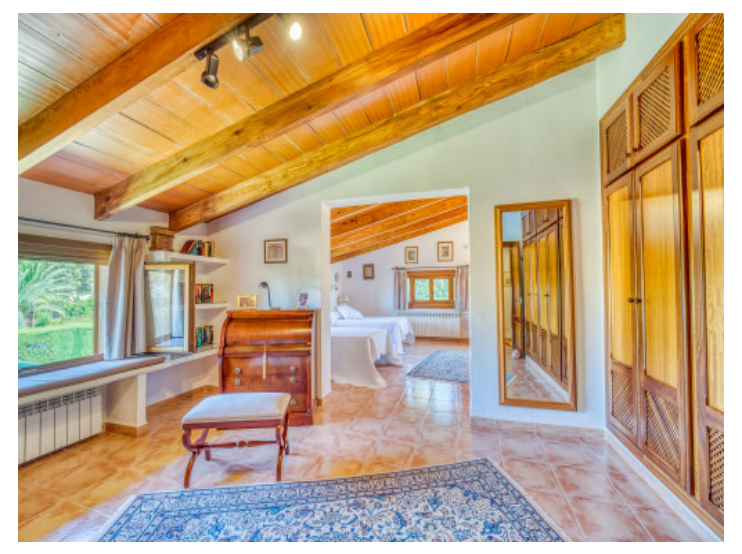
Fantastic dressing area