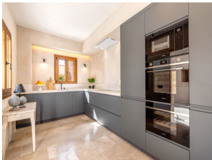
Modern high quality kitchen

All information is correct to the best of our knowledge. Errors and prior sale excepted. This prospectus is purely for information purposes. Only the notarized deed of sale is legally binding.