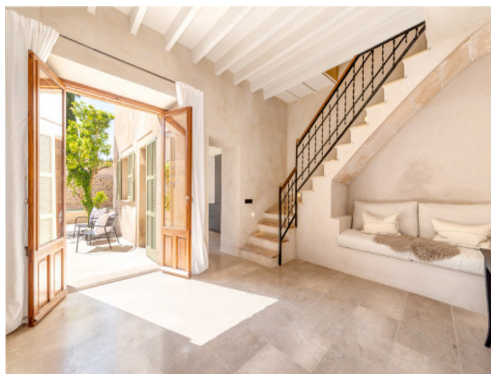
Access to the lovely patio