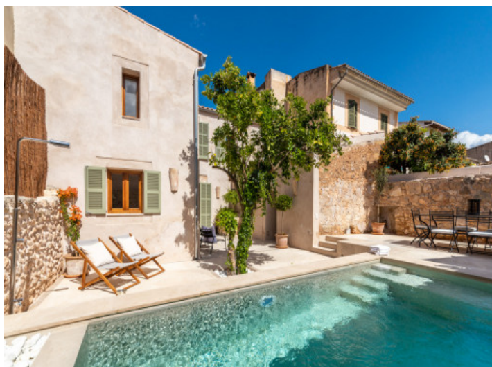
Fantastic outdoor area

All information is correct to the best of our knowledge. Errors and prior sale excepted. This prospectus is purely for information purposes. Only the notarized deed of sale is legally binding.