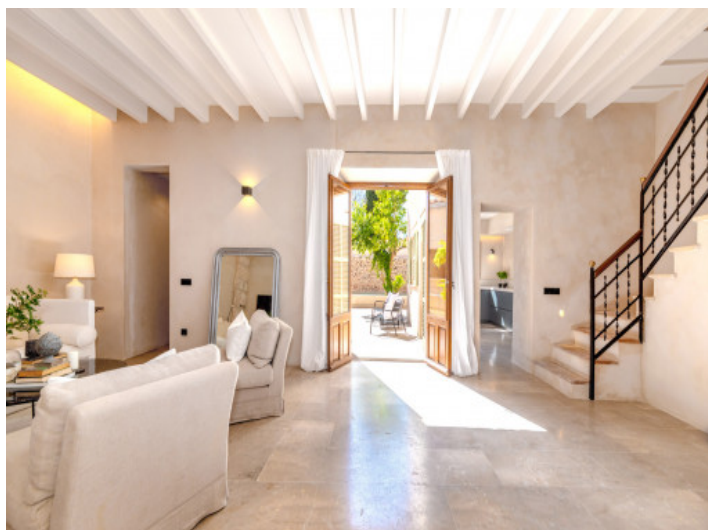
Access to the outside and the kitchen