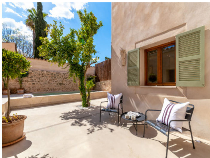
Perfect place to enjoy a coffee

All information is correct to the best of our knowledge. Errors and prior sale excepted. This prospectus is purely for information purposes. Only the notarized deed of sale is legally binding.