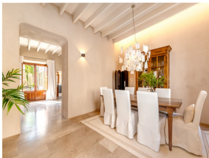
Adjoining dining area