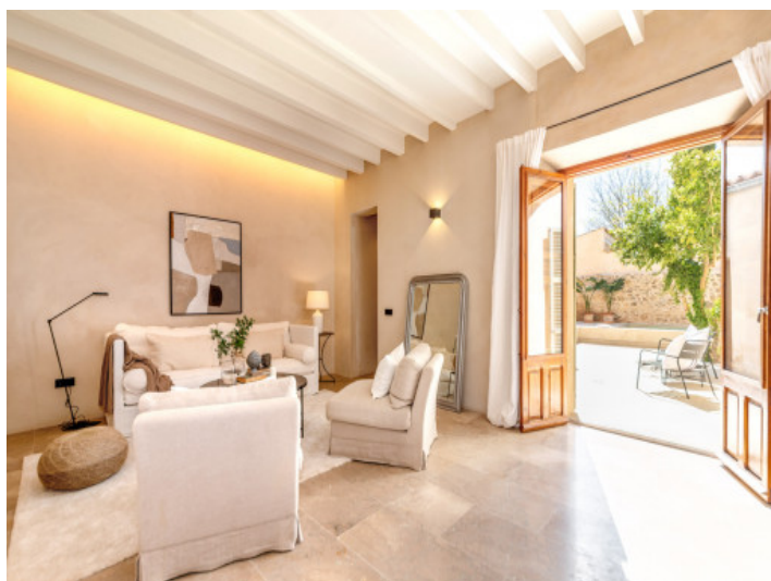
Beautiful bright living area