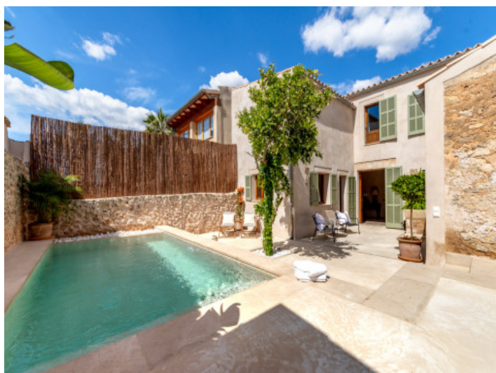
Inviting pool area