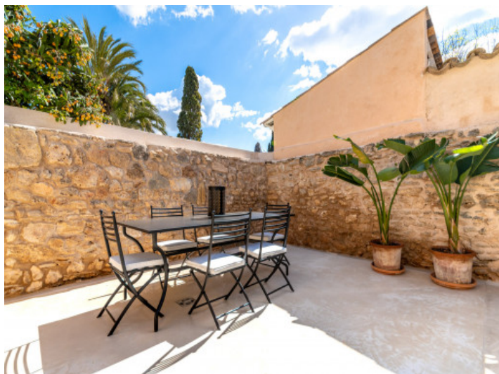
Private outdoor dining area