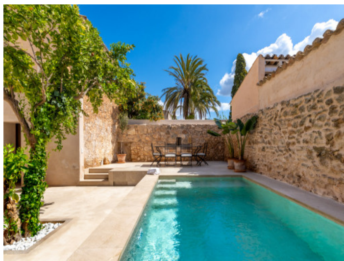
Tranquil terrace next to the pool