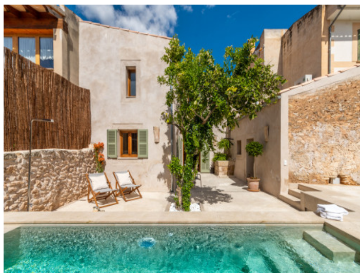
Impressive pool area