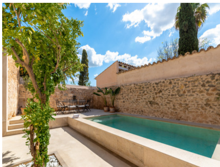
Sunny pool area