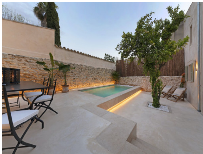
Pool area at night