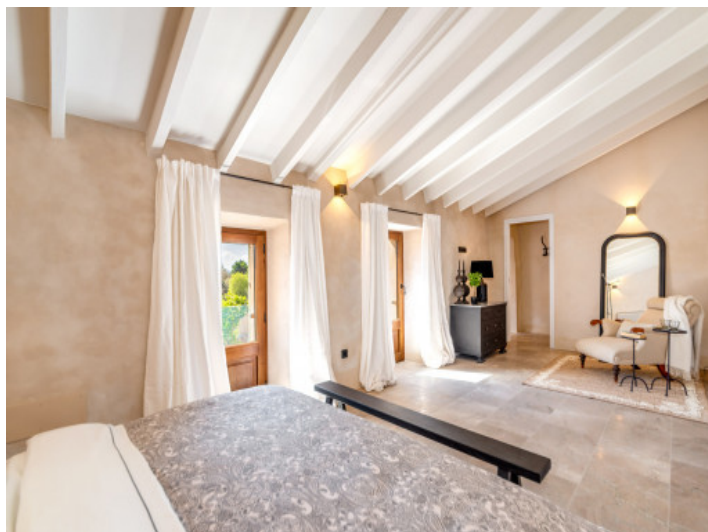
Master bedroom on the upper floor