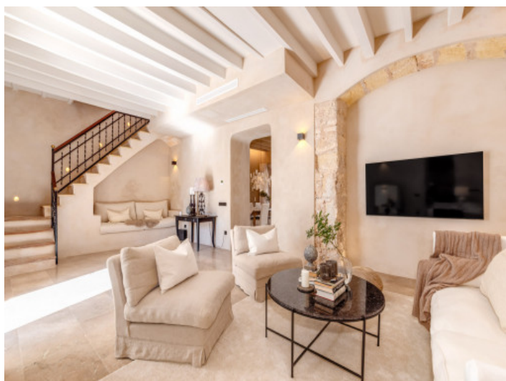
Living area and sandstone colours