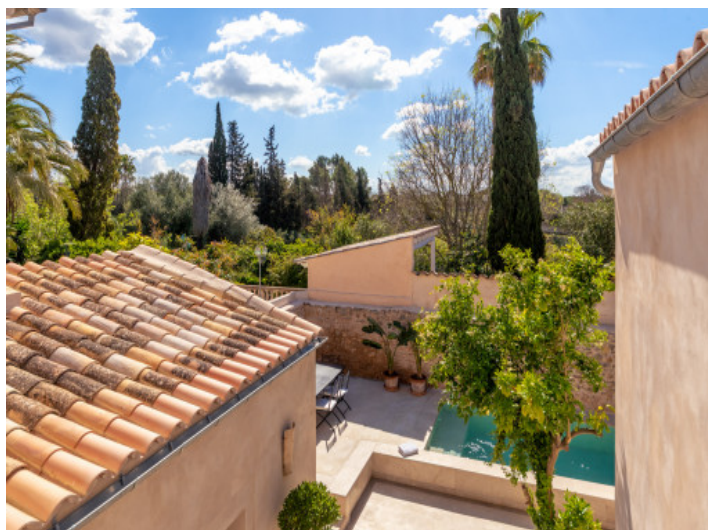
View over the lovely patio