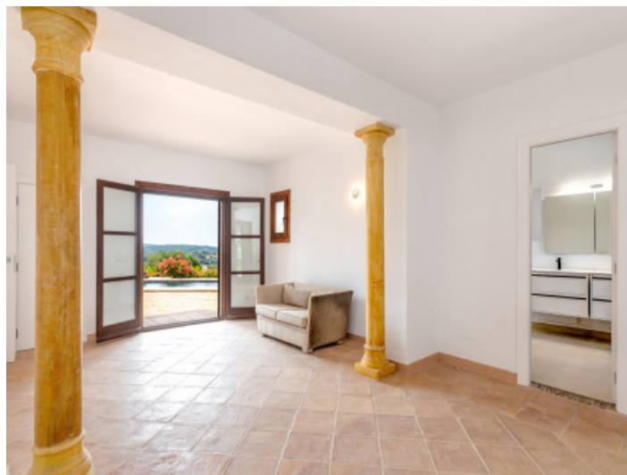
Bedroom suite with bathroom en suite