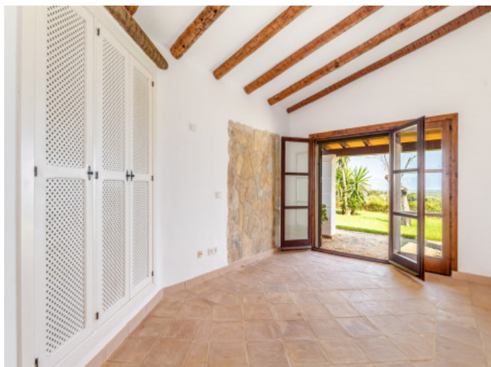
Bedroom with built-in wardrobes