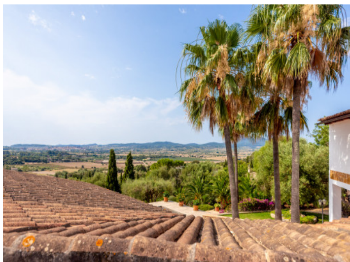
View into the landscape