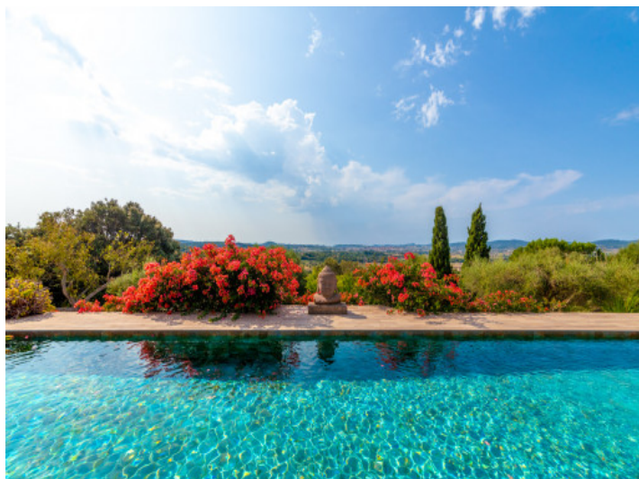
Pool with fantastic landscape views