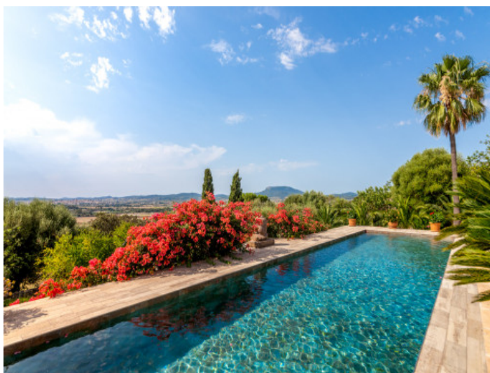
Pool area with a view