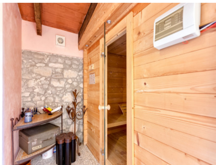
Spa with sauna