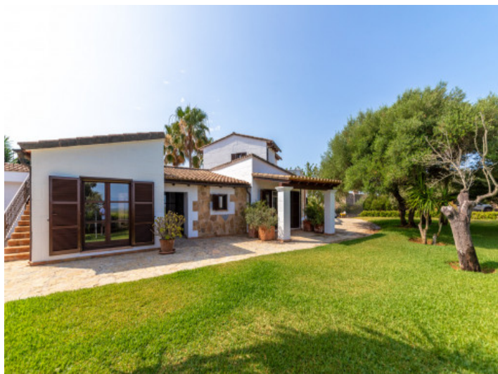
Exterior view and garden