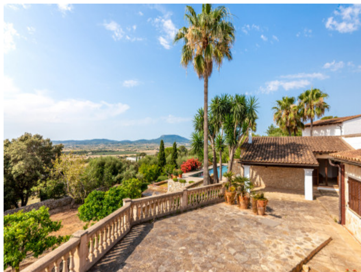
Terrace and landscape views