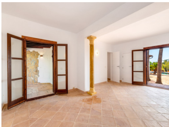
Alternative view of the bedroom