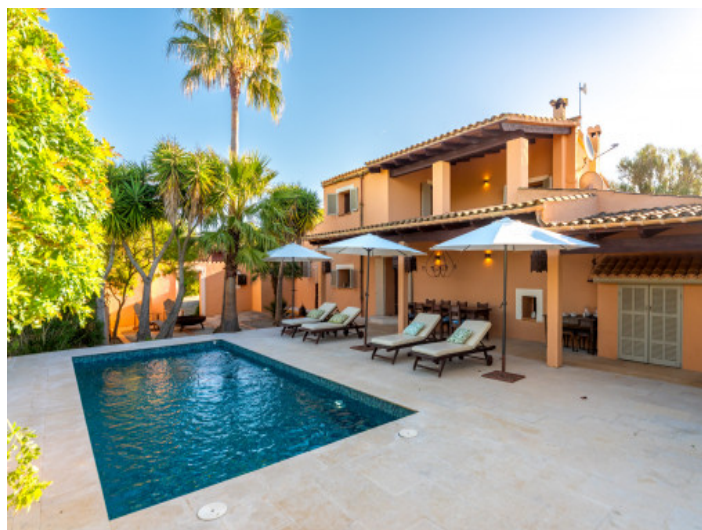
Pool is surrounded by a terrace

All information is correct to the best of our knowledge. Errors and prior sale excepted. This prospectus is purely for information purposes. Only the notarized deed of sale is legally binding.