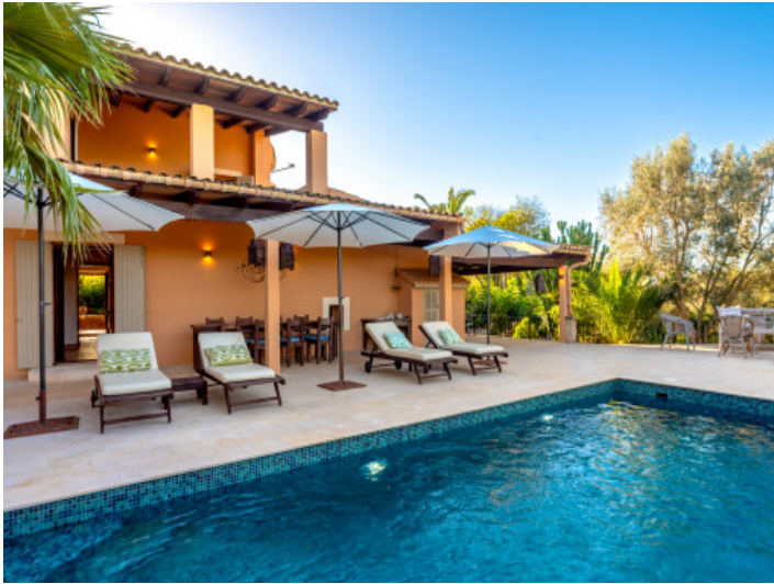
Cosy terrace with pool