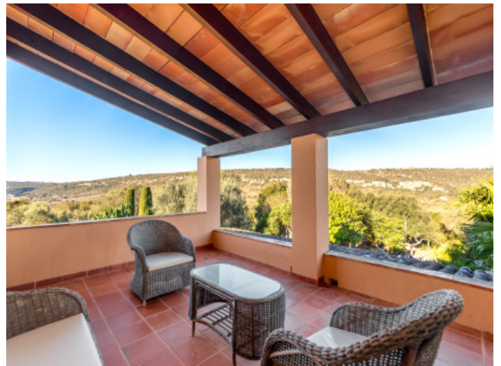
Unique landscape views from the balcony