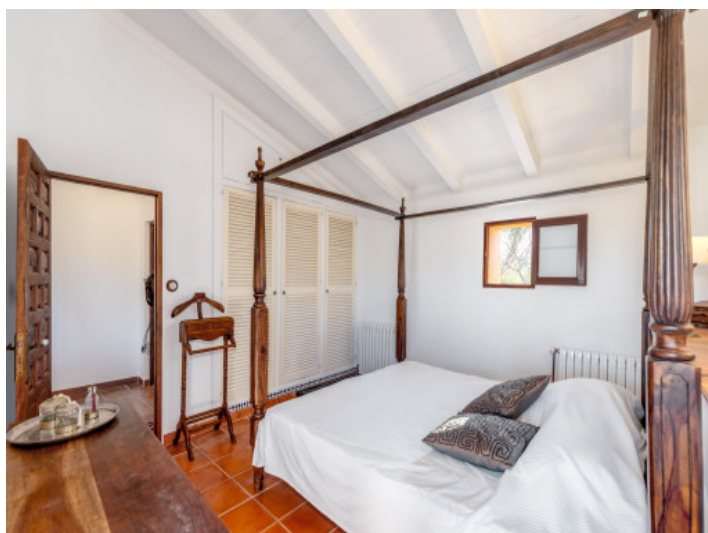
Bedroom with built-in wardrobe