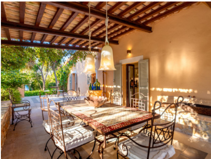
Mallorquin covered terrace