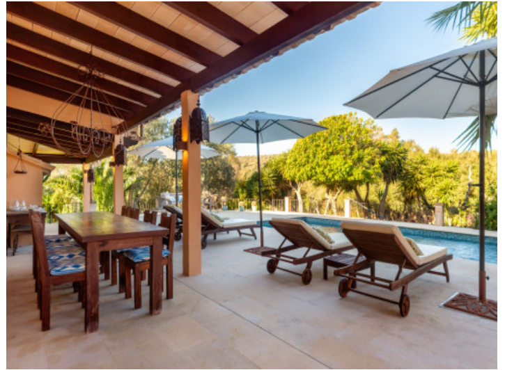
Covered terrace with pool views