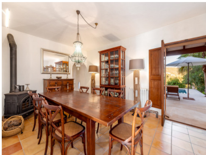
Dining area with terrace access