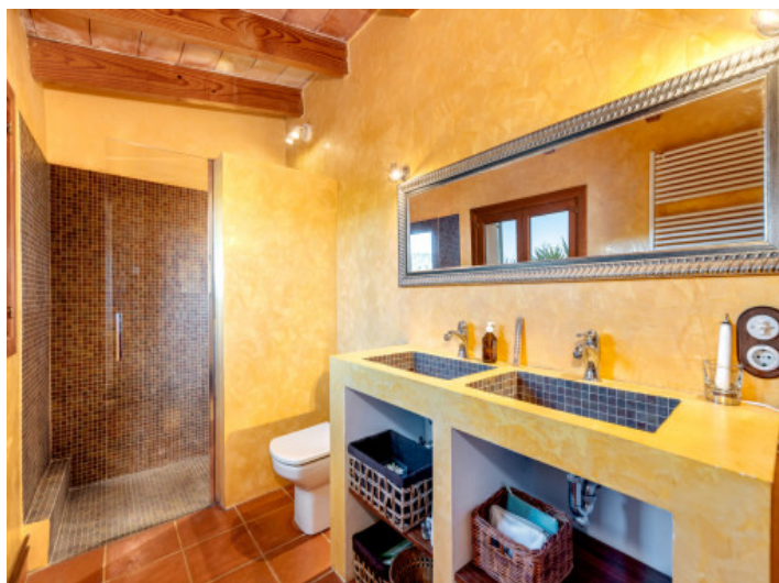
Bathroom with two washbasin