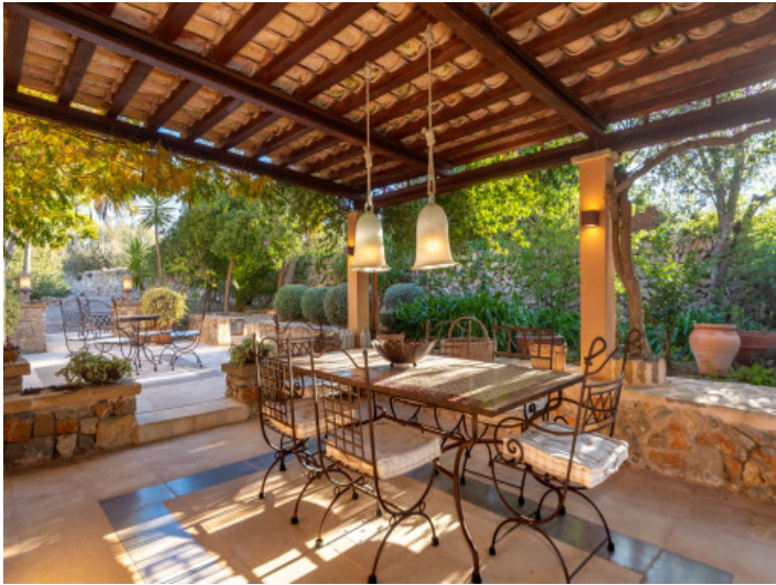
Garden views from the covered terrace