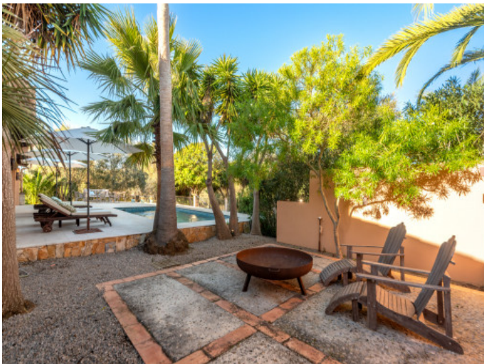
This area invites for cosy nights at the fire bowl

All information is correct to the best of our knowledge. Errors and prior sale excepted. This prospectus is purely for information purposes. Only the notarized deed of sale is legally binding.