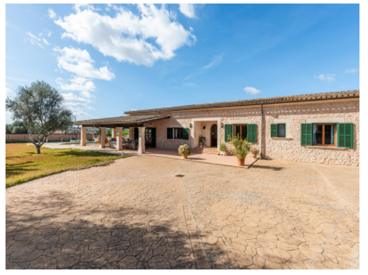
Large entrance area