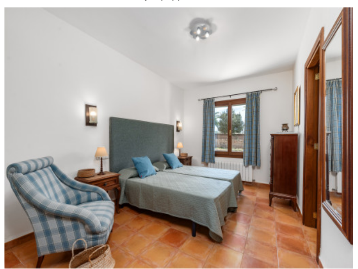
One of 4 bedrooms One of 4 bedrooms All information is correct to the best of our knowledge. Errors and prior sale excepted. This prospectus is purely for information purposes. Only the notarized deed of sale is legally binding.

PORTA MALLORQUINA • THERESIENSTR.: 81, 80333 MUNICH TEL. +34 971 698 242 • INFO@PORTAMALLORQUINA.COM