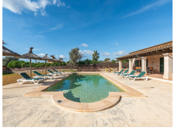
Pool area with spacious terrace

PORTA MALLORQUINA® Your home. Our passion.