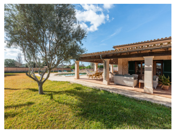
Inviting large garden