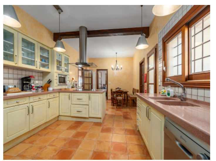
Open kitchen with dining area