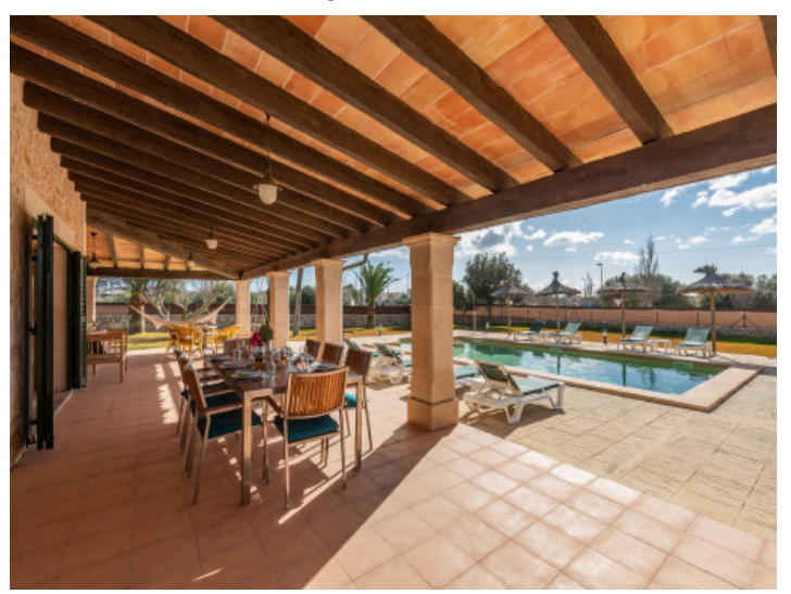
Covered terrace Cozy living area All information is correct to the best of our knowledge. Errors and prior sale excepted. This prospectus is purely for information purposes. Only the notarized deed of sale is legally binding.

PORTA MALLORQUINA • THERESIENSTR.: 81, 80333 MUNICH TEL. +34 971 698 242 • INFO@PORTAMALLORQUINA.COM