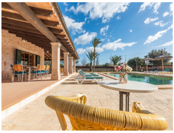
Pool area with many seating areas