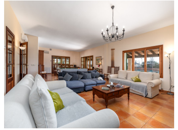
Spacious living area

PORTA MALLORQUINA® Your home. Our passion.