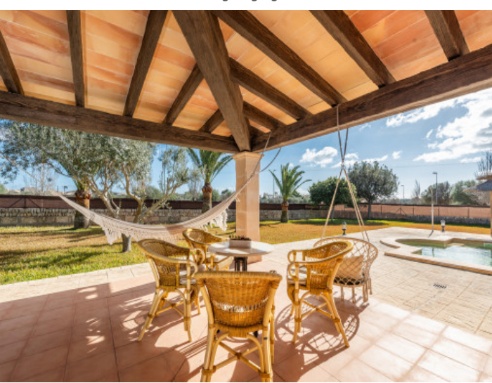
Cozy seating area