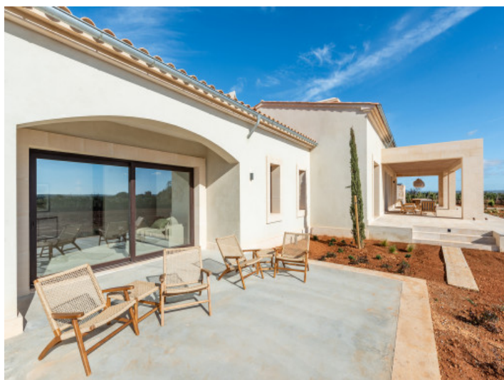
Guest house terrace