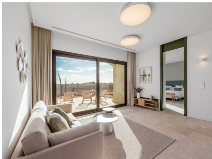
Guest house - Living area