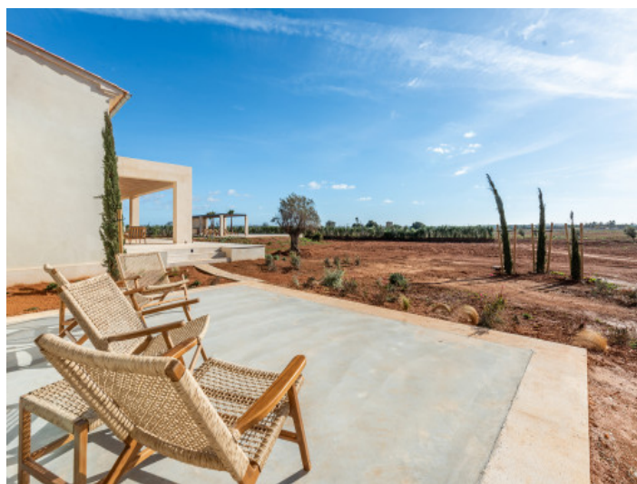
Guest house terrace