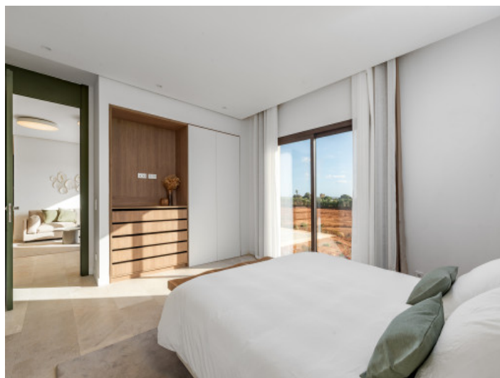
Guest house - Bedroom

All information is correct to the best of our knowledge. Errors and prior sale excepted. This prospectus is purely for information purposes. Only the notarized deed of sale is legally binding.