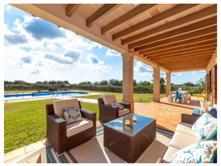
Covered terrace with garden views