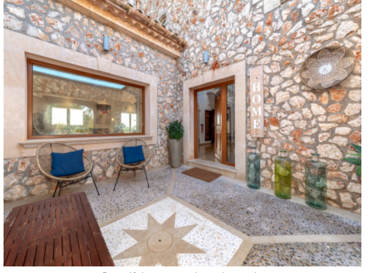
Beautiful entrance through a patio