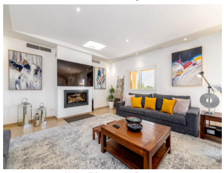
Modern living area with fireplace