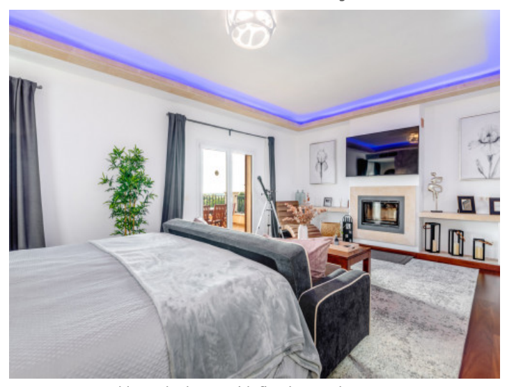
Master bedroom with fireplace and terrace