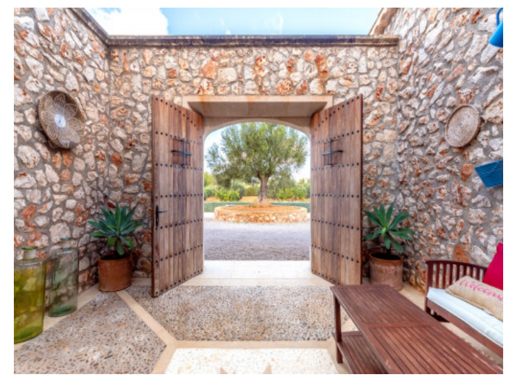
Appealing main entrance