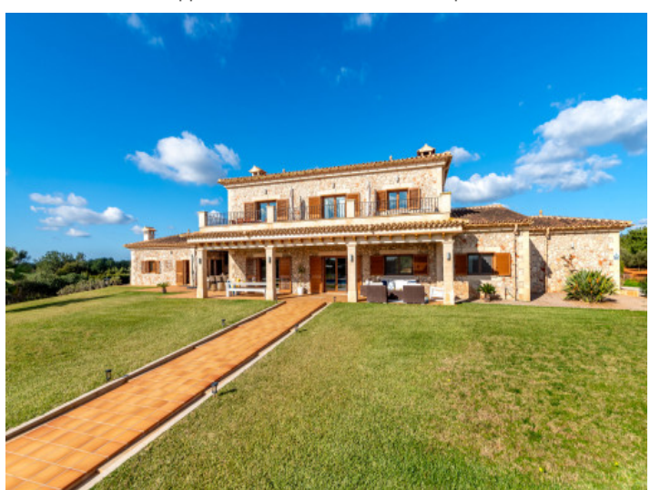
View of the natural stone facade