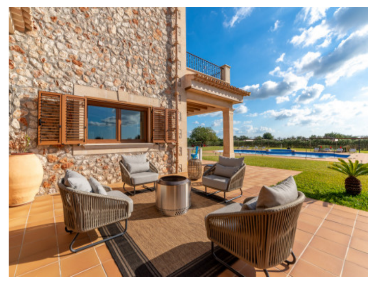
Sunny lounge terrace