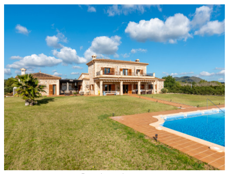
Extensive outdoor area