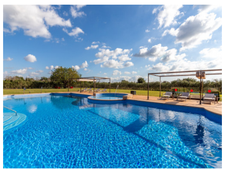
Fantastic pool with sun terrace