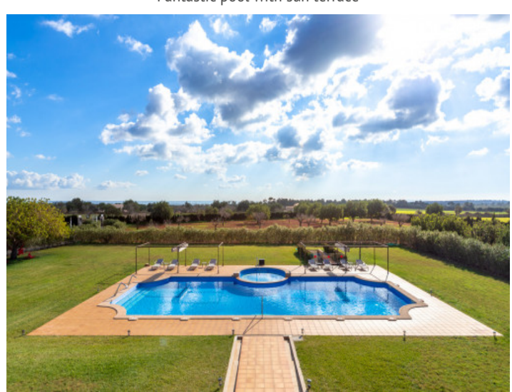
Large 10 x 20 m pool