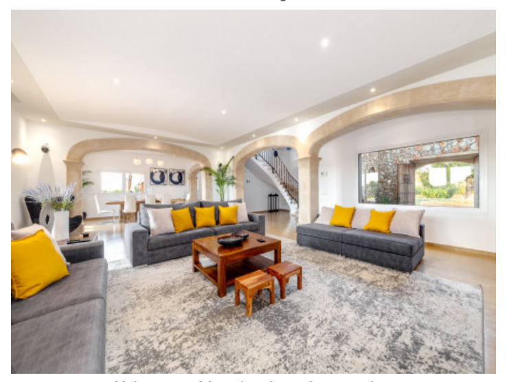
Living area with authentic sandstone arches