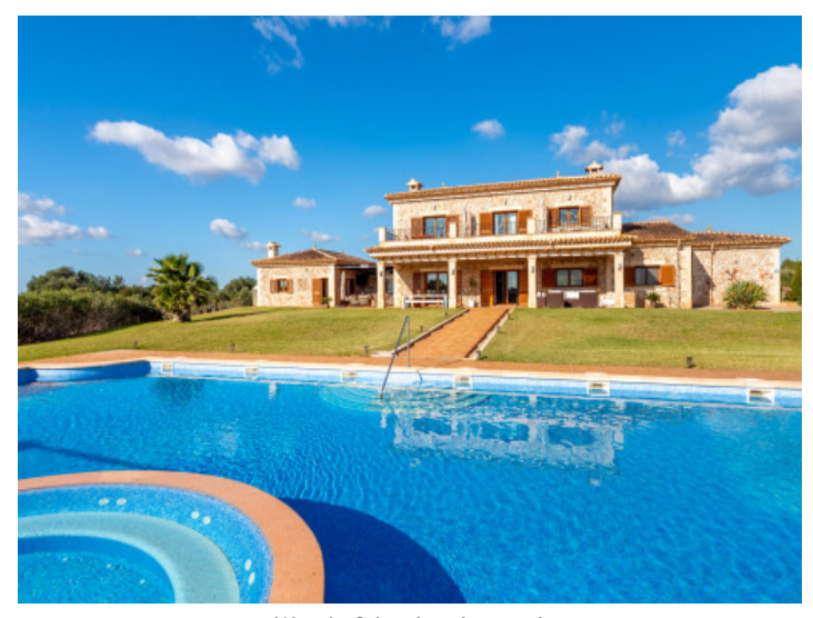
Wonderful swimming pool