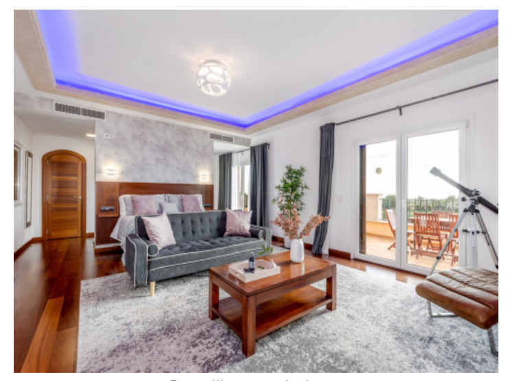
Dreamlike master bedroom