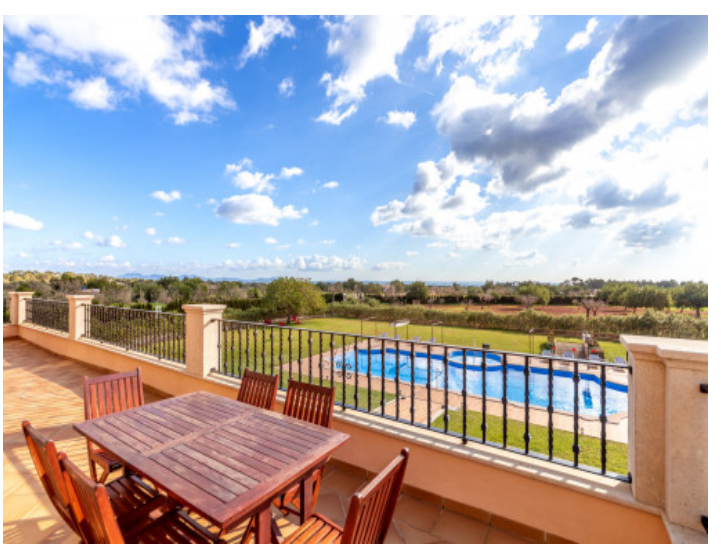
Upper terrace with views over the plot