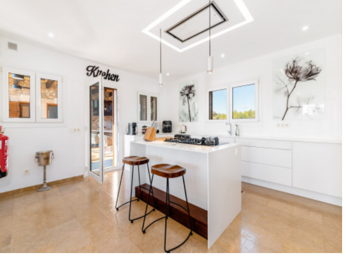
Modern kitchen in white