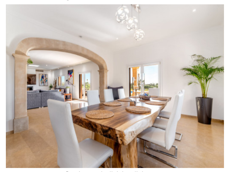
Spacious and adjoining dining area