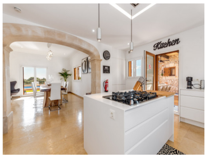
Direct access to the outdoor kitchen