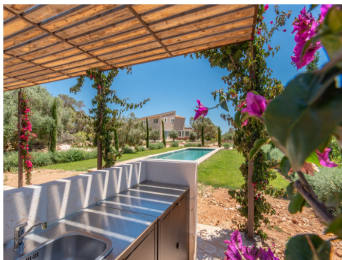
Pool with Barbecue area