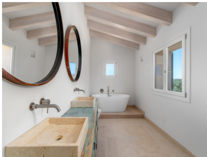
One of 6 bathrooms