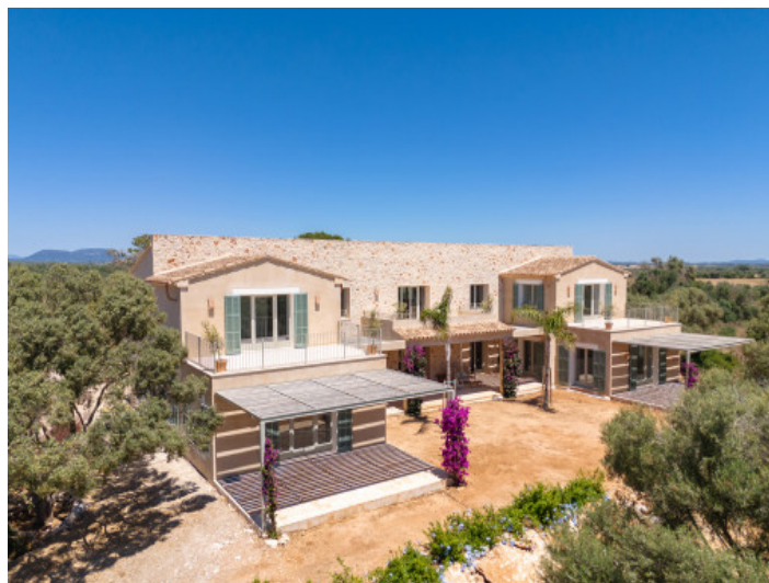
Newly built finca with natural stone