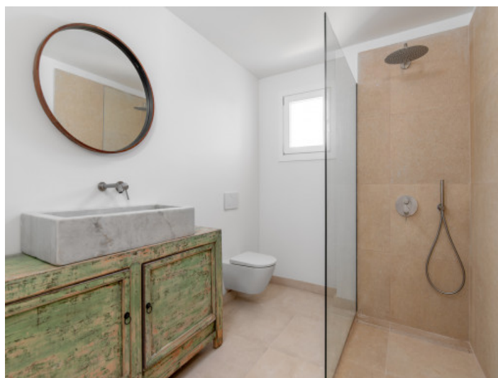
One of 6 bathrooms