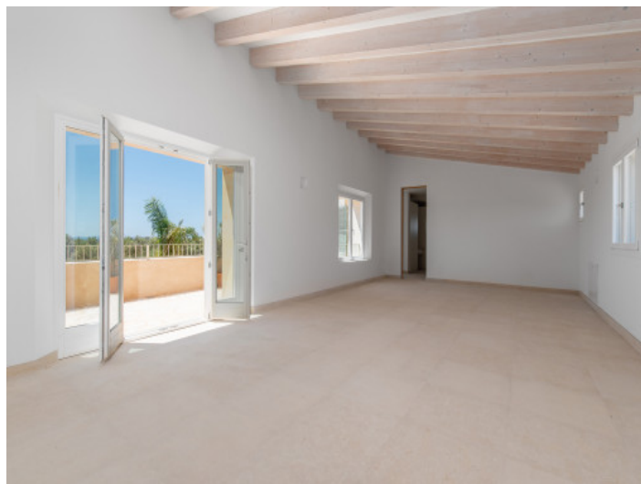
Second living room