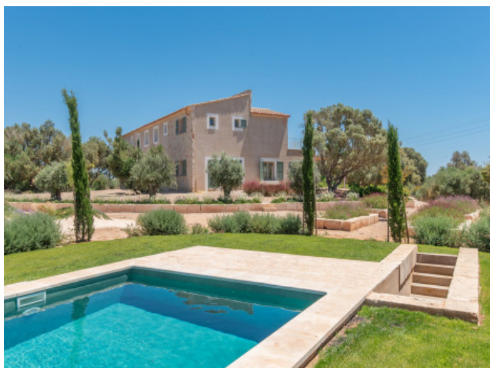
Finca with pool