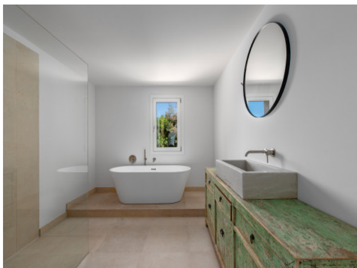
One of 6 bathrooms