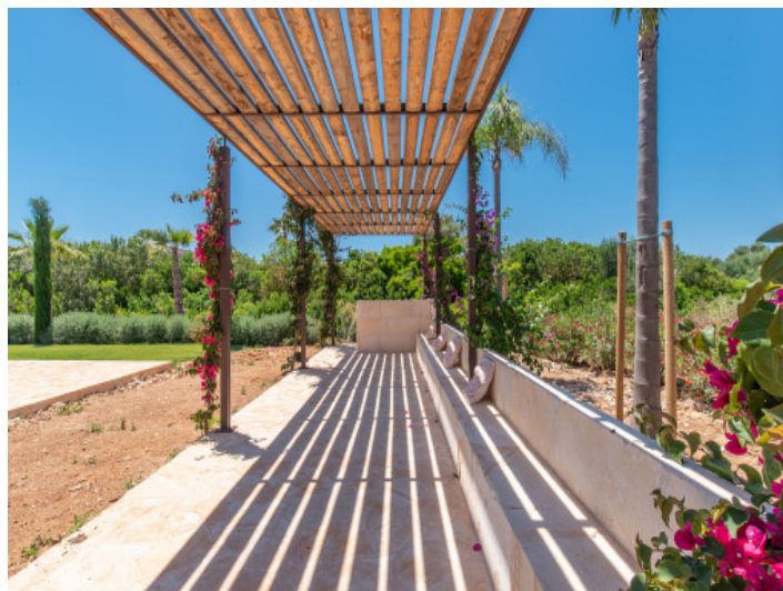
Cozy Seating area