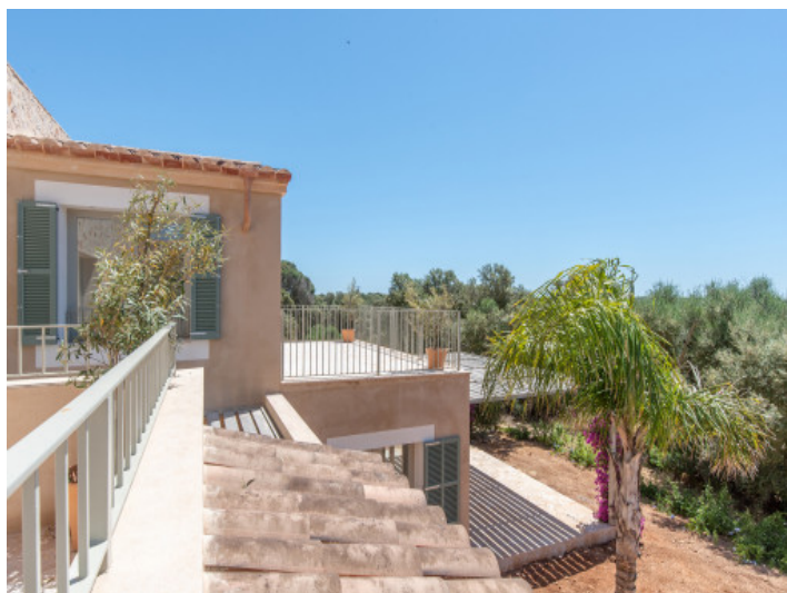
Terrace with views