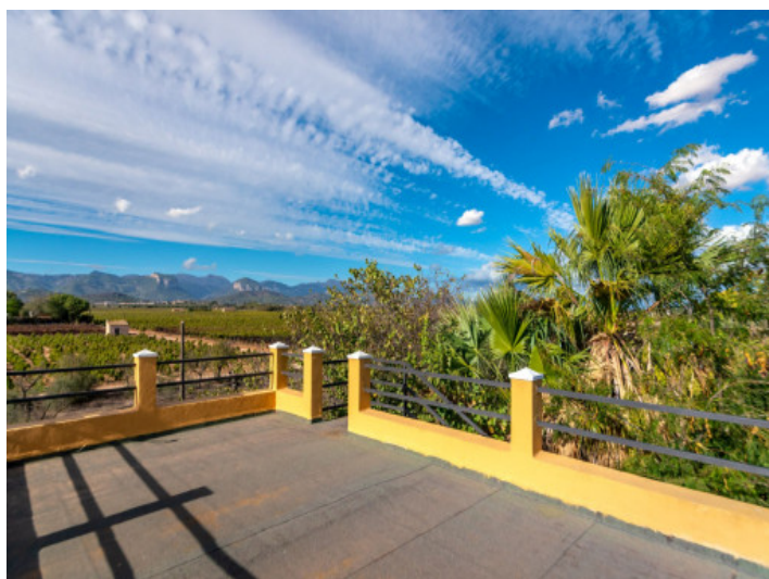
Rooftop terrace with views