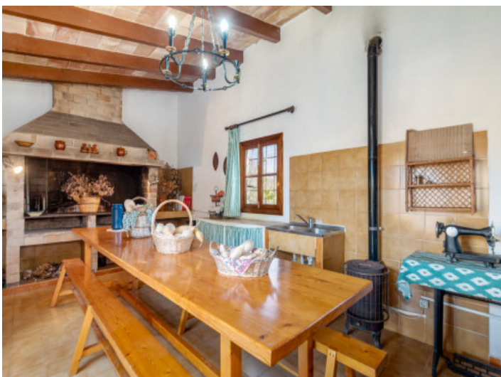
Seperated BBQ area