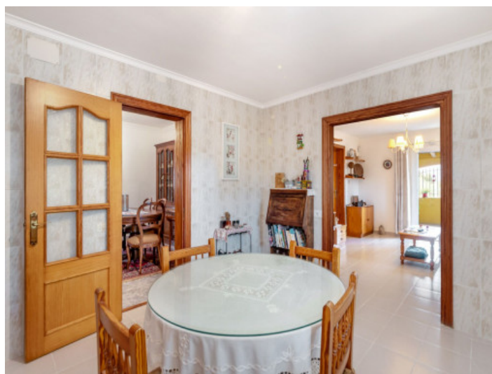
Dining area kitchen