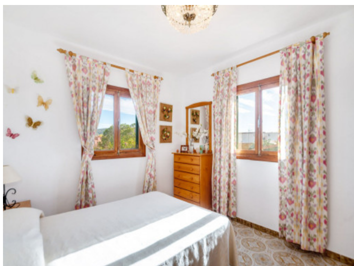
Finca with 4 bedrooms