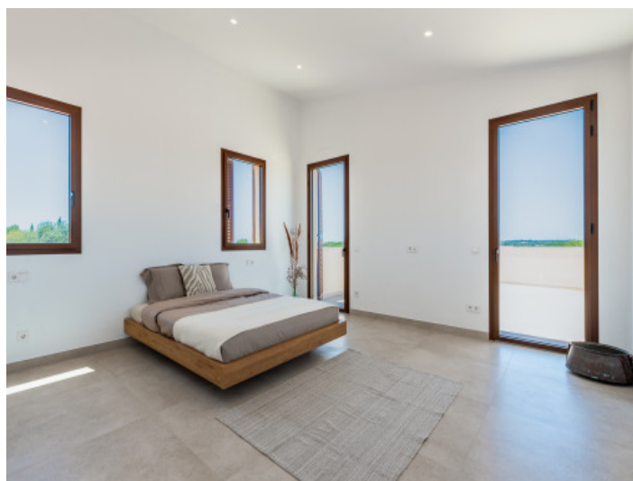
Bedroom on the first floor