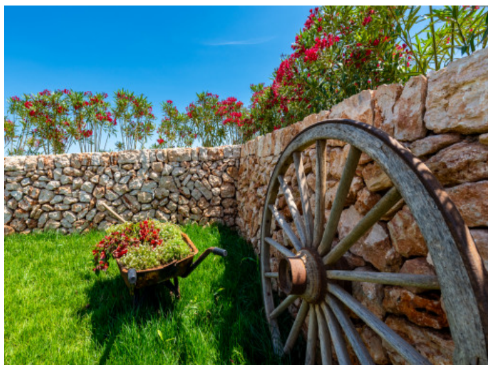
Natural stone walls