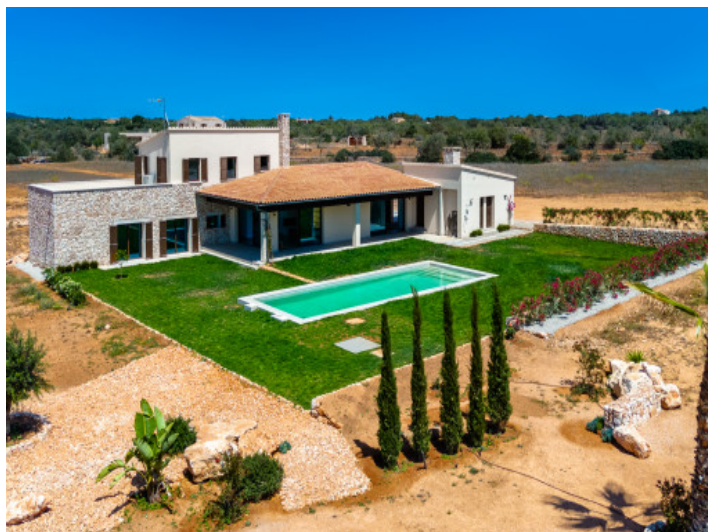
Aerial view to the property