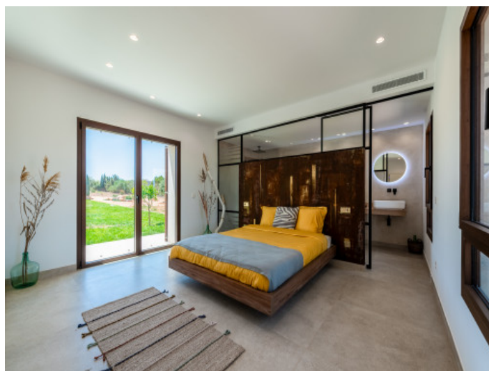
Bedroom on the ground floor