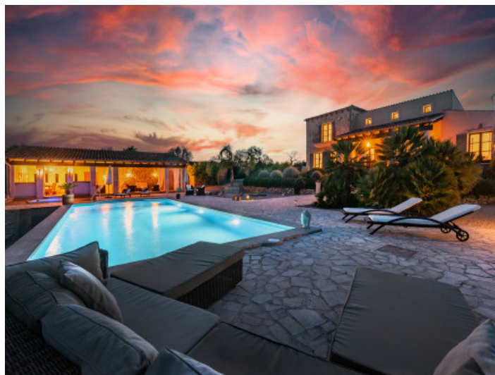
Country home with pool