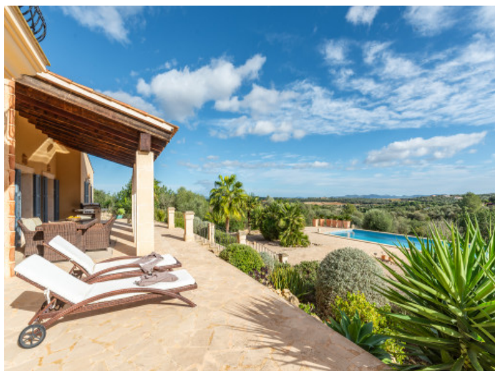
Sunny terrace with sun loungers