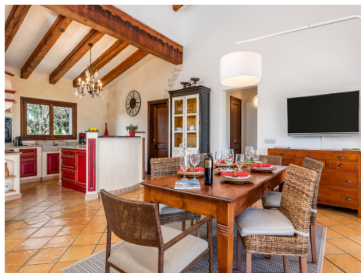
Alternative view of the dining area