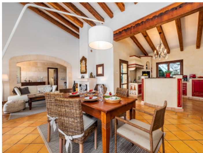
Open dining area and kitchen

All information is correct to the best of our knowledge. Errors and prior sale excepted. This prospectus is purely for information purposes. Only the notarized deed of sale is legally binding.