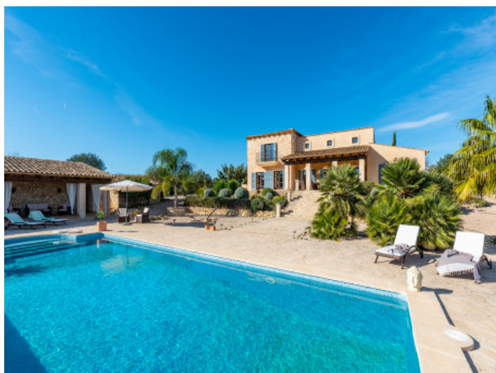
Pool area and barbecue house