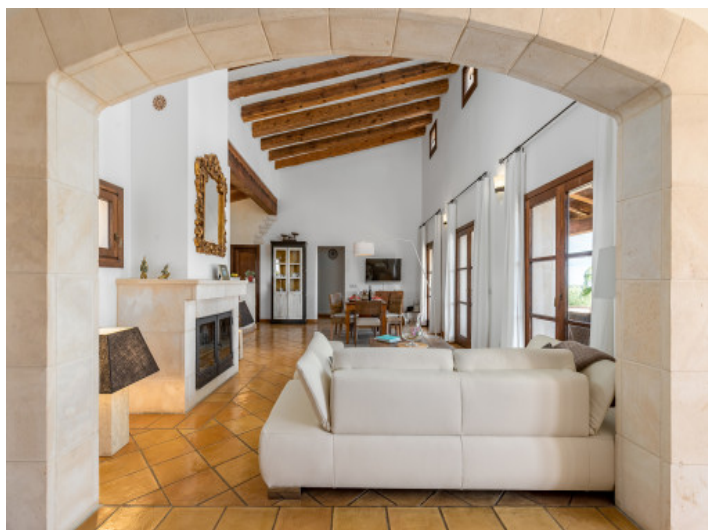
Cozy living area with fireplace