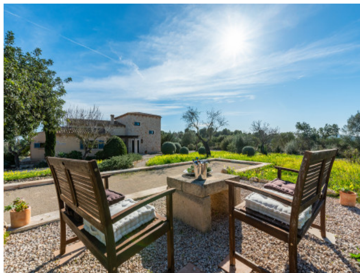
Exterior area and garden