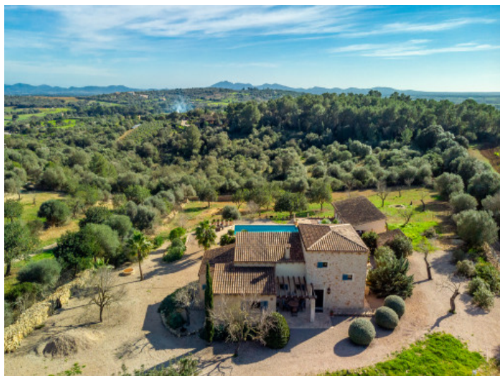
Exterior view and surroundings of the finca