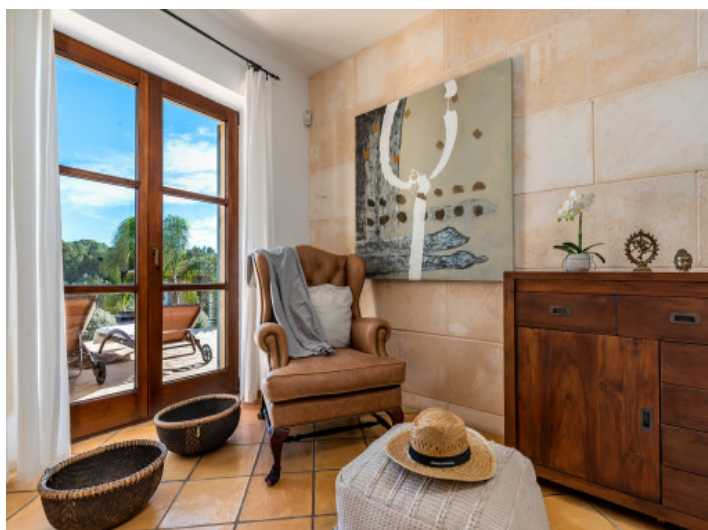
Inviting chill out area