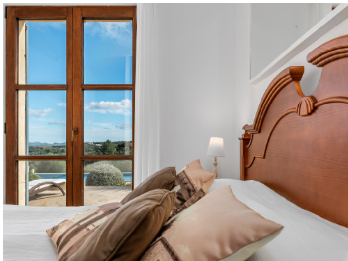
View to the pool from the bed