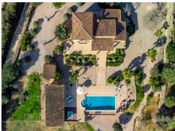
The finca from a birds-eye view