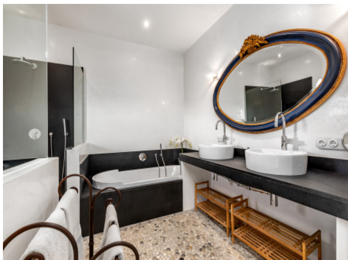
Bathroom with bath tub and shower