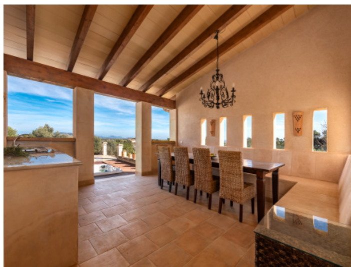
Noble barbecue house with dining area