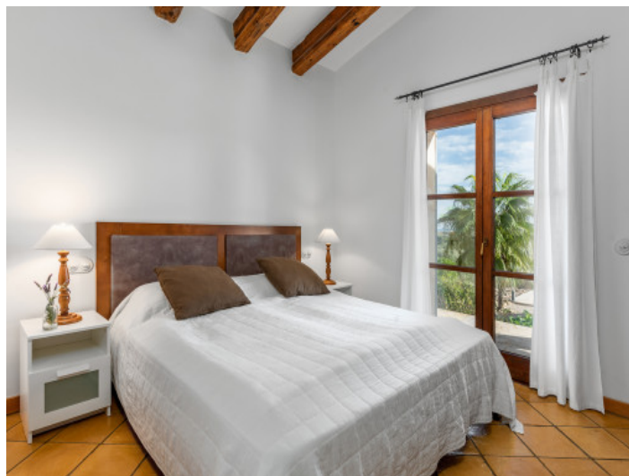
Another bedroom with bathroom en suite