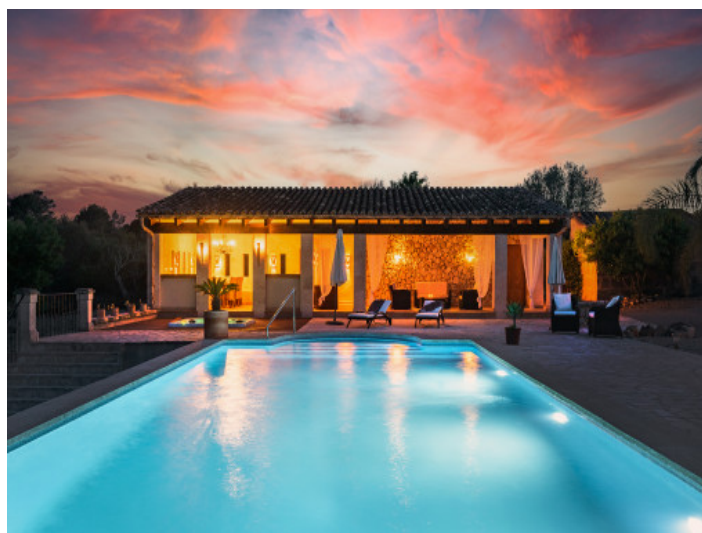
Pool area at night