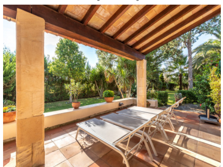
Idyllic sun terrace