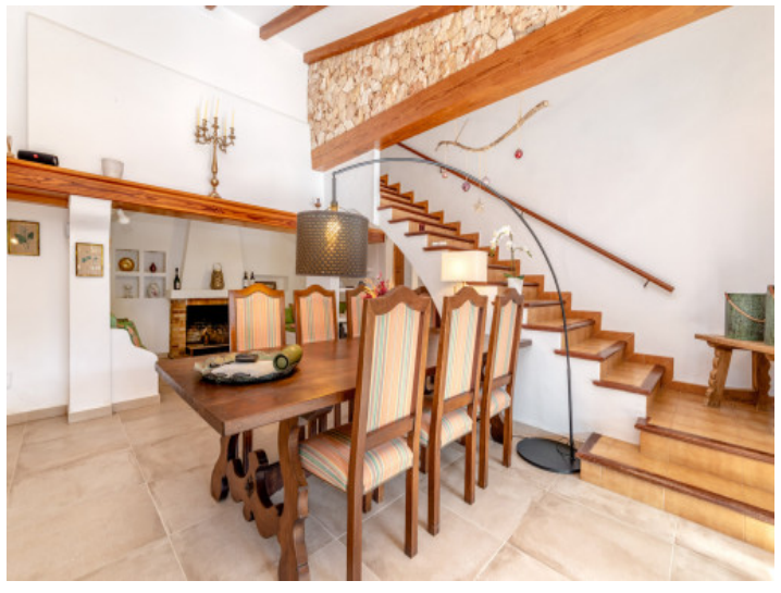
Dining area and access to the upper floor