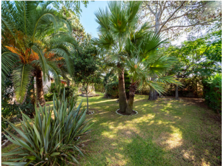
Wonderful garden with palm trees