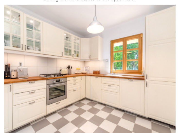
Modern kitchen in white