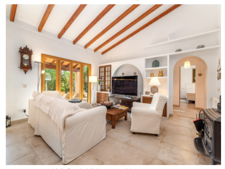
Lightflooded living area with terrace access