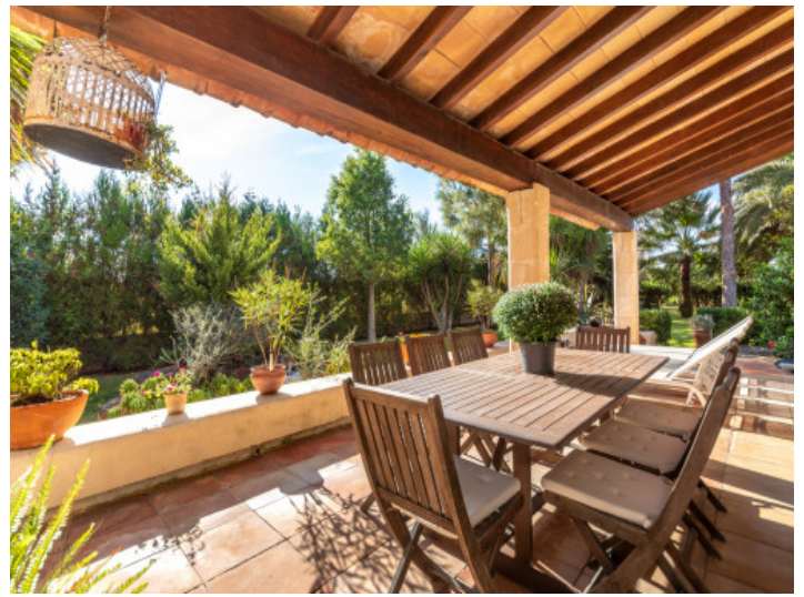
Covered outdoor dining area