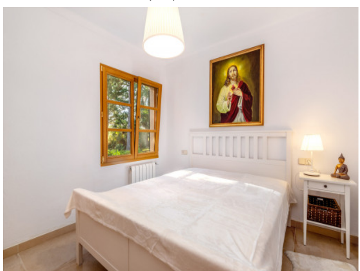
One of 2 double bedrooms