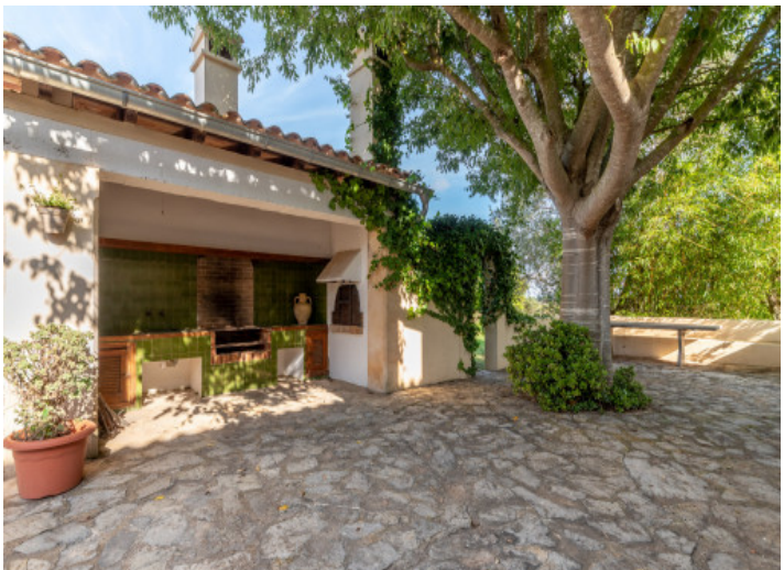
Covered bbq terrace