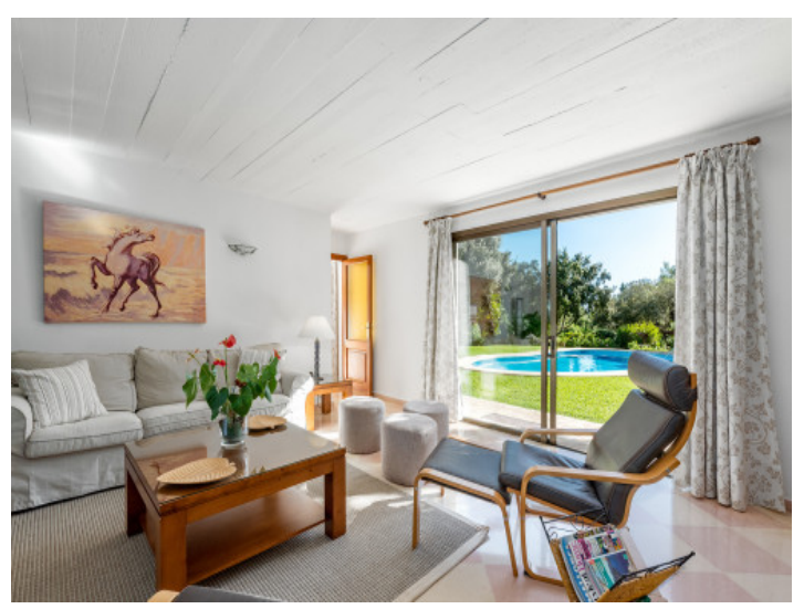
Living area with direct garden access Light-flooded living area All information is correct to the best of our knowledge. Errors and prior sale excepted. This prospectus is purely for information purposes. Only the notarized deed of sale is legally binding.

PORTA MALLORQUINA • THERESIENSTR.: 81, 80333 MUNICH TEL. +34 971 698 242 • INFO@PORTAMALLORQUINA.COM