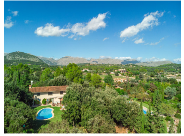
The finca is surrounded by trees