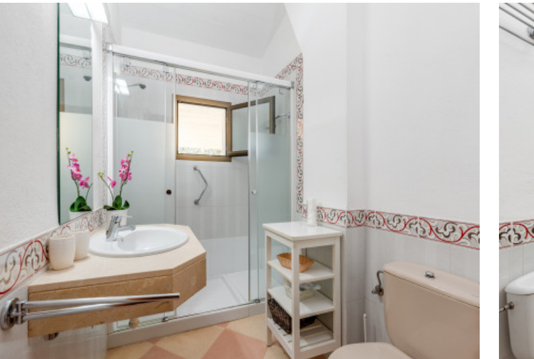
One of 3 bathrooms One of 3 bathrooms. All information is correct to the best of our knowledge. Errors and prior sale excepted. This prospectus is purely for information purposes. Only the notarized deed of sale is legally binding.