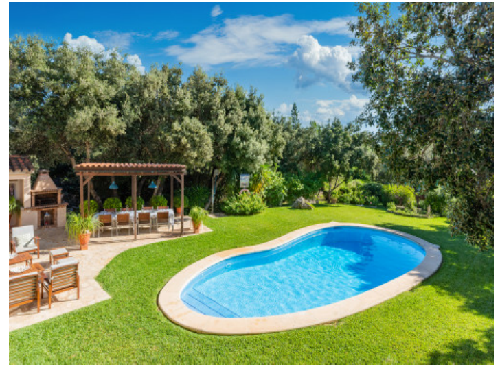
Fantastic garden and pool area