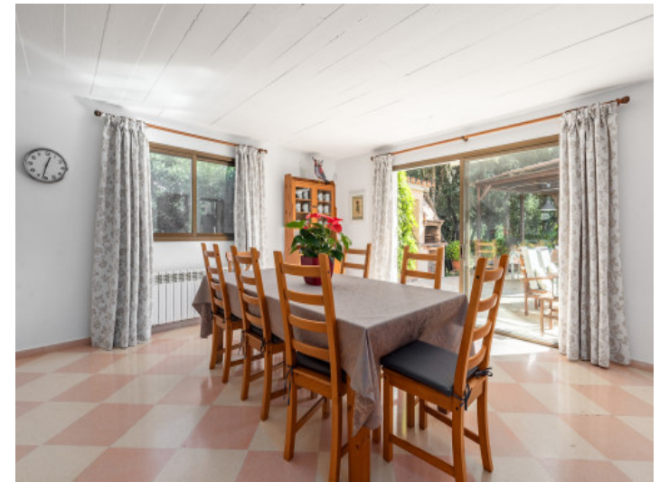
Large dining area

PORTA MALLORQUINA® Your home. Our passion.