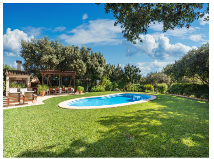
Well-tended outdoor area