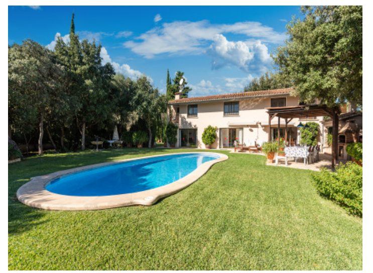
Exterior view and pool Beautiful fountain All information is correct to the best of our knowledge. Errors and prior sale excepted. This prospectus is purely for information purposes. Only the notarized deed of sale is legally binding.

PORTA MALLORQUINA • THERESIENSTR.: 81, 80333 MUNICH TEL. +34 971 698 242 • INFO@PORTAMALLORQUINA.COM