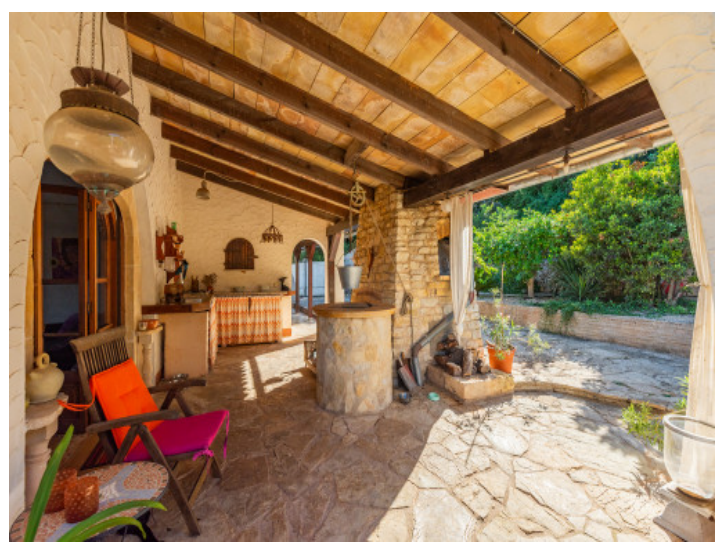
Large covered terrace with a well