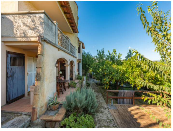
Covered terrace with access to the garden