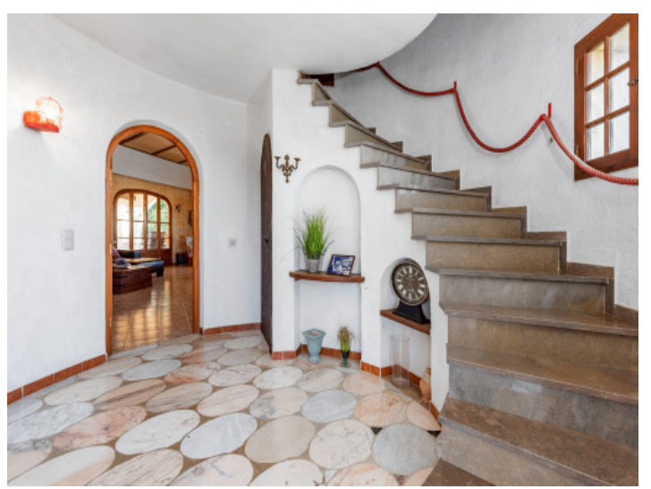
Beautiful entrance area Terrace on the upper floor All information is correct to the best of our knowledge. Errors and prior sale excepted. This prospectus is purely for information purposes. Only the notarized deed of sale is legally binding.

PORTA MALLORQUINA • THERESIENSTR.: 81, 80333 MUNICH TEL. +34 971 698 242 • INFO@PORTAMALLORQUINA.COM