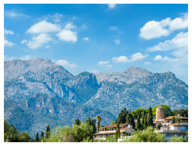
Fantastic mountain views