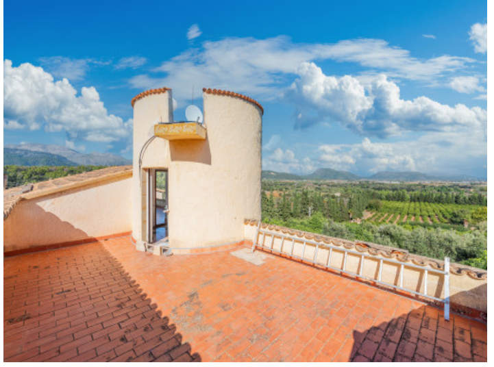
Roof terrace with sweeping views