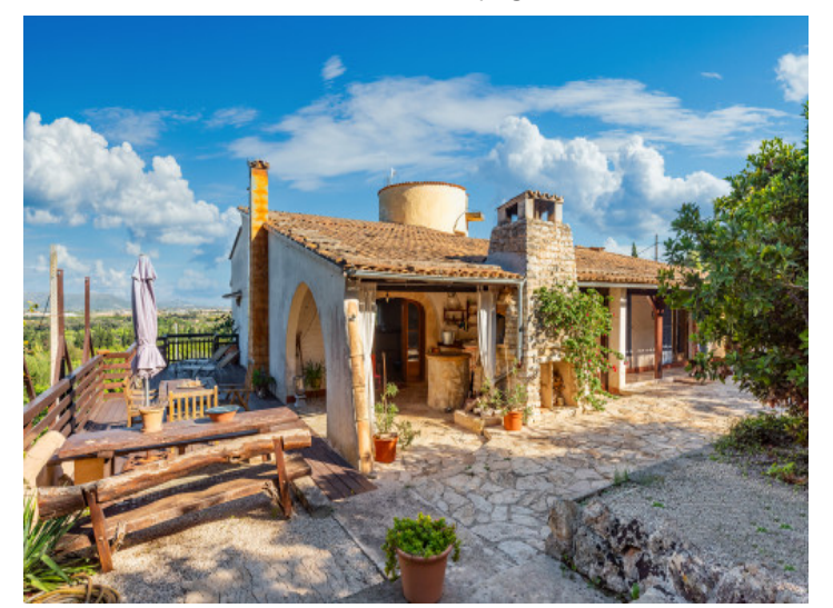
Covered and uncovered terrace Superb terrace with sweeping views All information is correct to the best of our knowledge. Errors and prior sale excepted. This prospectus is purely for information purposes. Only the notarized deed of sale is legally binding.

PORTA MALLORQUINA • THERESIENSTR.: 81, 80333 MUNICH TEL. +34 971 698 242 • INFO@PORTAMALLORQUINA.COM