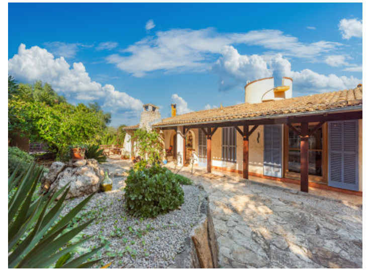
Large covered terrace