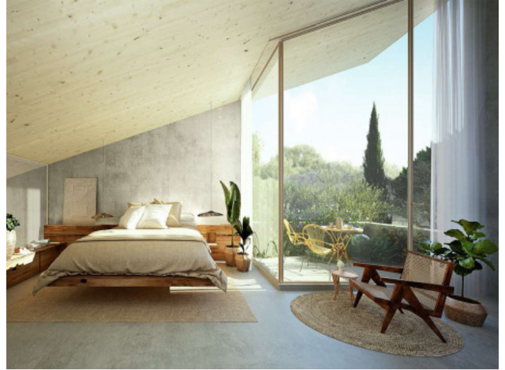
Large window fronts of the master bedroom on the upper floor