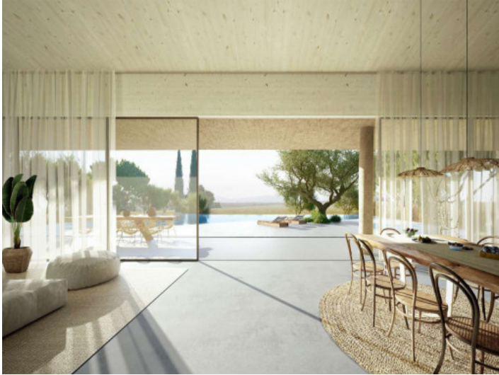
Modern minimalist architecture inside