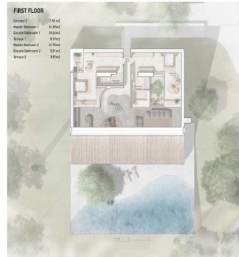
Floor plan of the upper floor