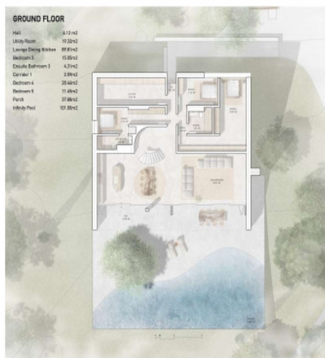
Floor plan of the ground floor

All information is correct to the best of our knowledge. Errors and prior sale excepted. This prospectus is purely for information purposes. Only the notarized deed of sale is legally binding.