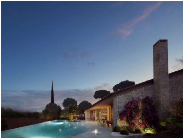
Sophisticated lighting at night