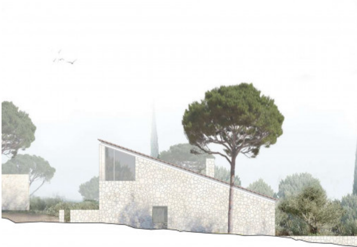
Plan of the finca