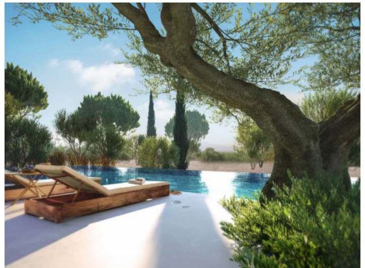
Oasis-like ambience. surrounding the pool