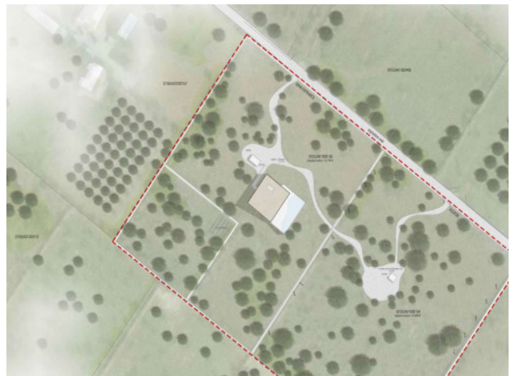
Distribution of the buildings on the plot

All information is correct to the best of our knowledge. Errors and prior sale excepted. This prospectus is purely for information purposes. Only the notarized deed of sale is legally binding.