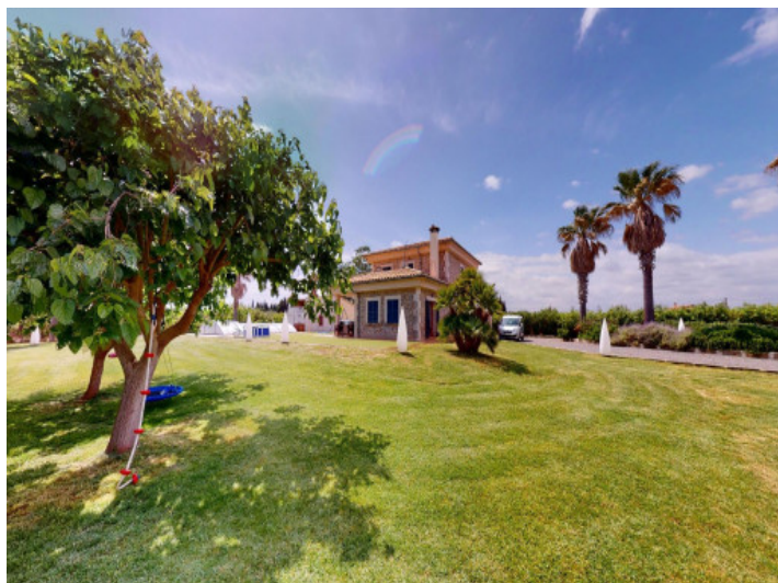
Natural-stone finca with pool and olive tree plantation near Playa de Muro