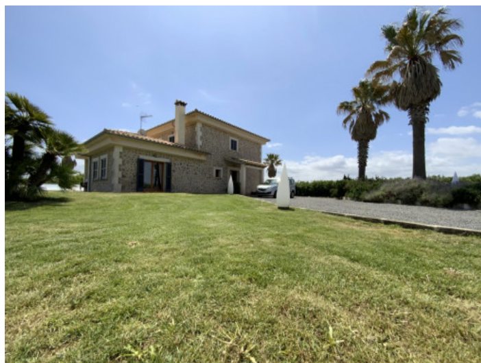
Finca and garden

All information is correct to the best of our knowledge. Errors and prior sale excepted. This prospectus is purely for information purposes. Only the notarized deed of sale is legally binding.