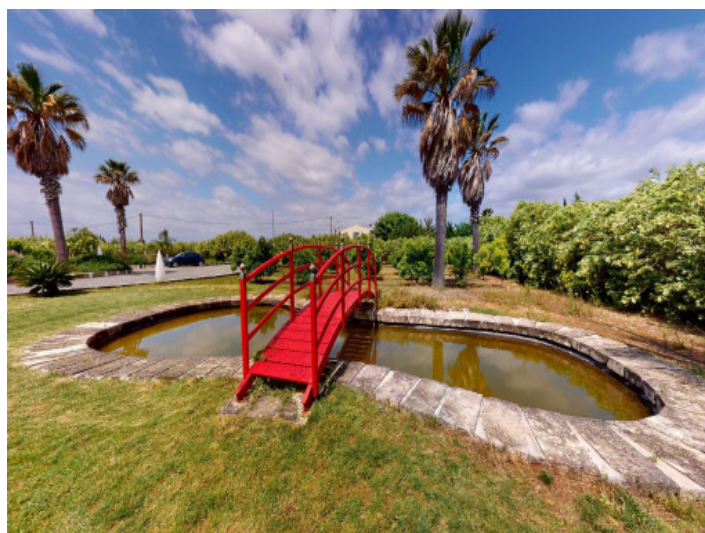
Natural pond in the garden