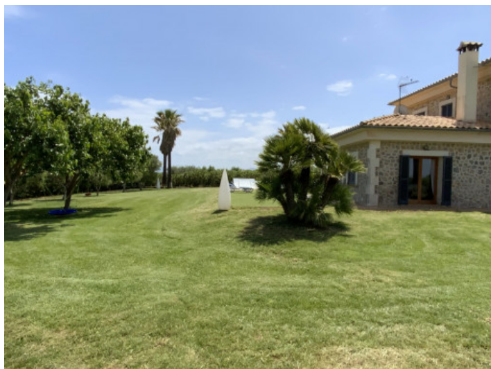
Finca and garden