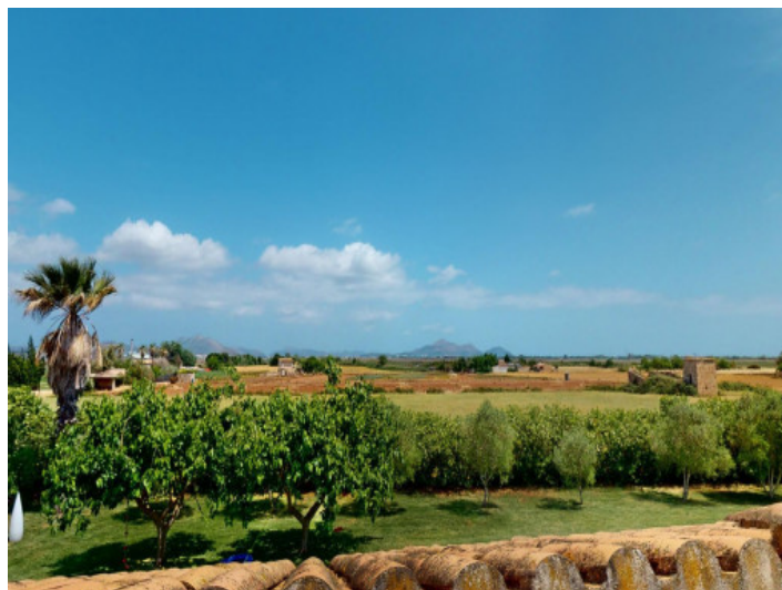
Wonderful views over the landscape