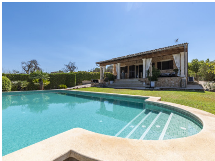
Holiday finca with pool in Sineu