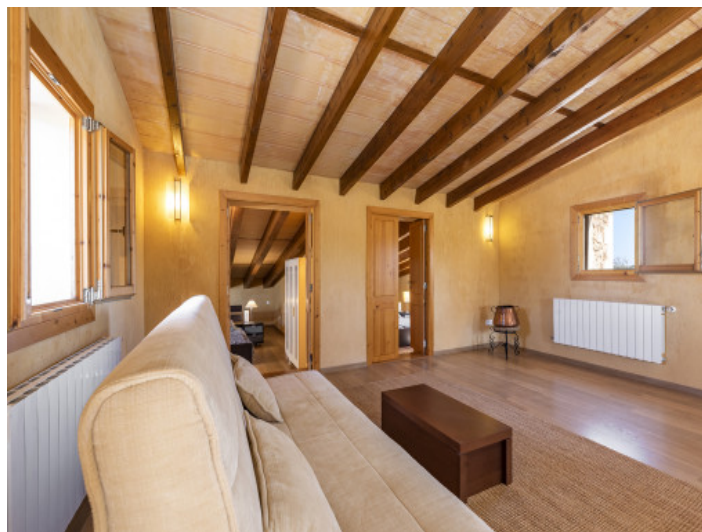
Living room on the upper floor