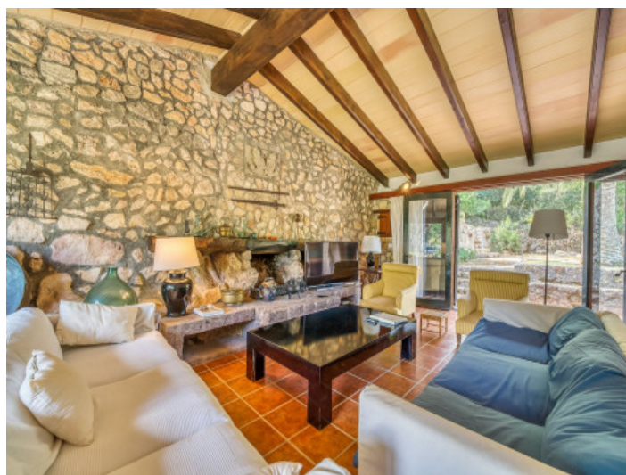
Living area with access to a terrace