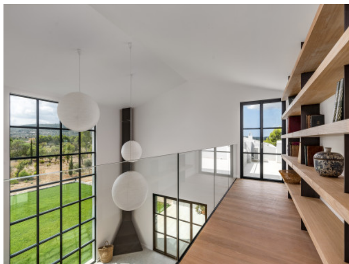
Upper view of the gallery

All information is correct to the best of our knowledge. Errors and prior sale excepted. This prospectus is purely for information purposes. Only the notarized deed of sale is legally binding.