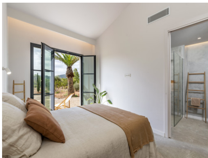
Second bedroom with bathroom en suite