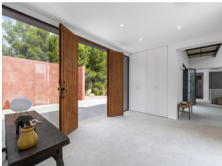
Noble entrance area