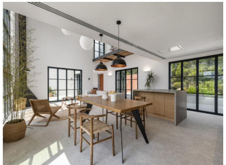
Elegant dining area

All information is correct to the best of our knowledge. Errors and prior sale excepted. This prospectus is purely for information purposes. Only the notarized deed of sale is legally binding.