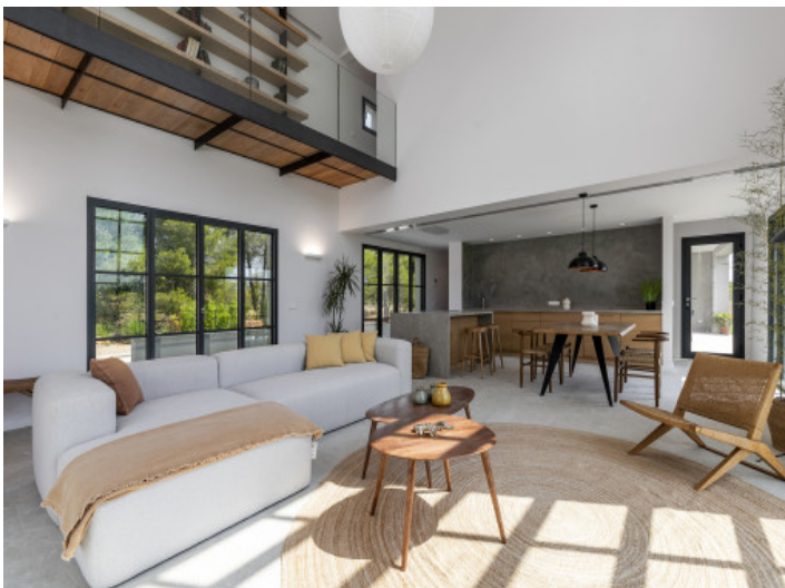
View to the kitchen