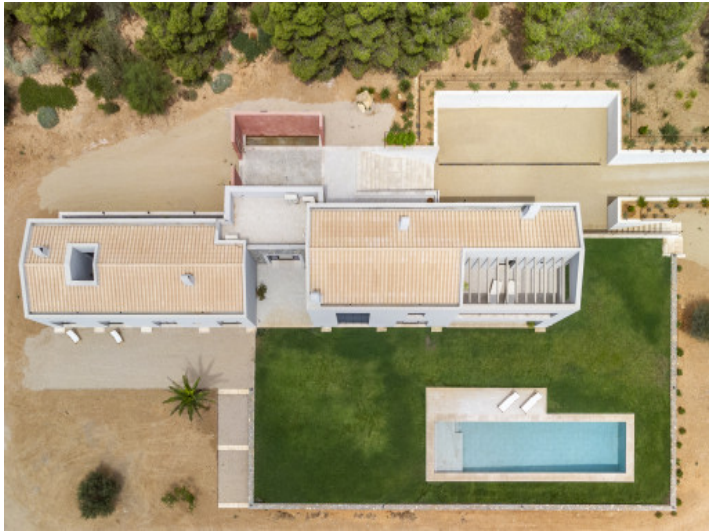
Exterior view of the villa