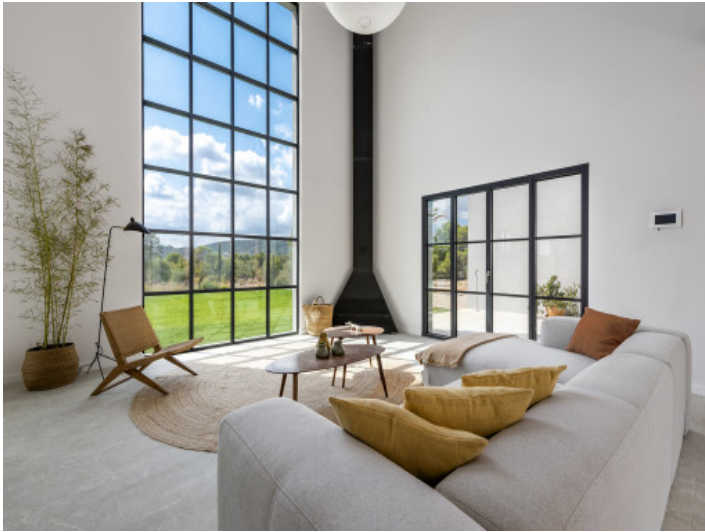
Stylish newly-built villa with pool in Santa Maria