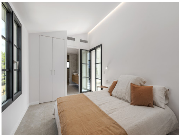
Upper bedroom with bathroom en suite