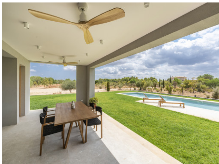
Covered dining area