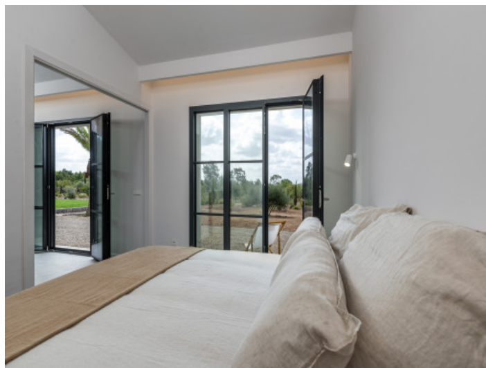
Bedroom with bathroom en suite