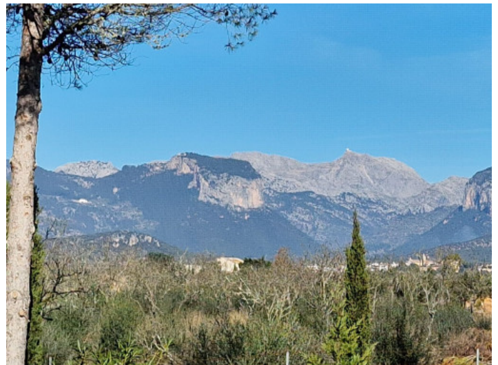
Beautiful mountain view