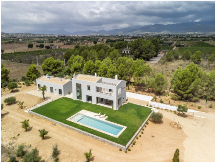
Exterior view of the villa