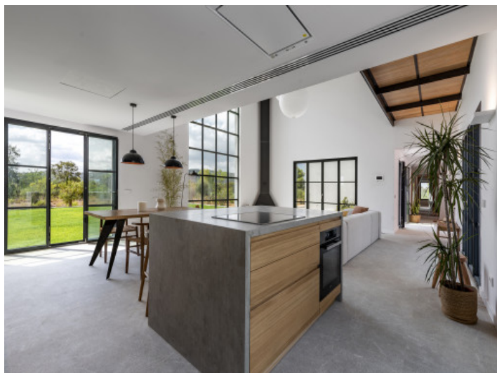
Kitchen with cooking island