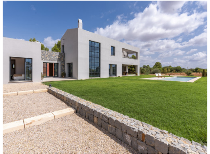
Stylish newly-built villa with pool in Santa Maria