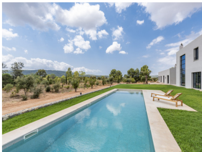
Sunny pool area

All information is correct to the best of our knowledge. Errors and prior sale excepted. This prospectus is purely for information purposes. Only the notarized deed of sale is legally binding.