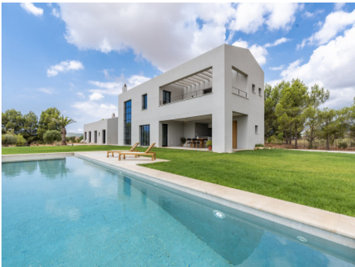
Inviting pool area