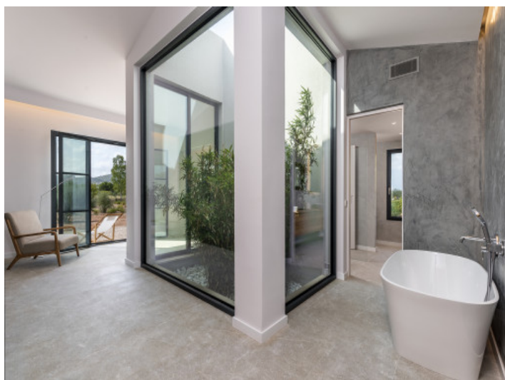
Bedroom with bathroom en suite