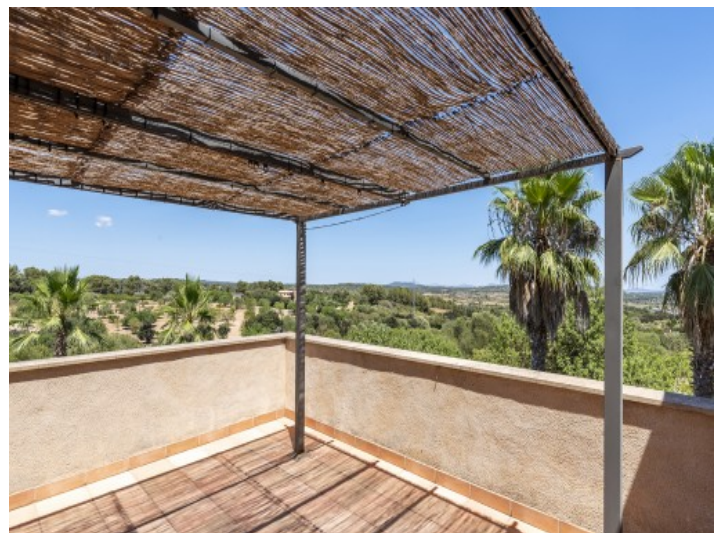
Terrace with a view