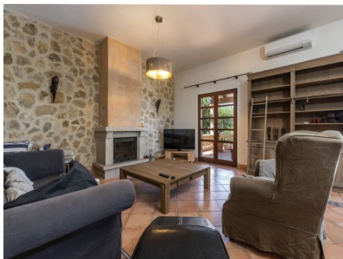
Living area with fire place

All information is correct to the best of our knowledge. Errors and prior sale excepted. This prospectus is purely for information purposes. Only the notarized deed of sale is legally binding.