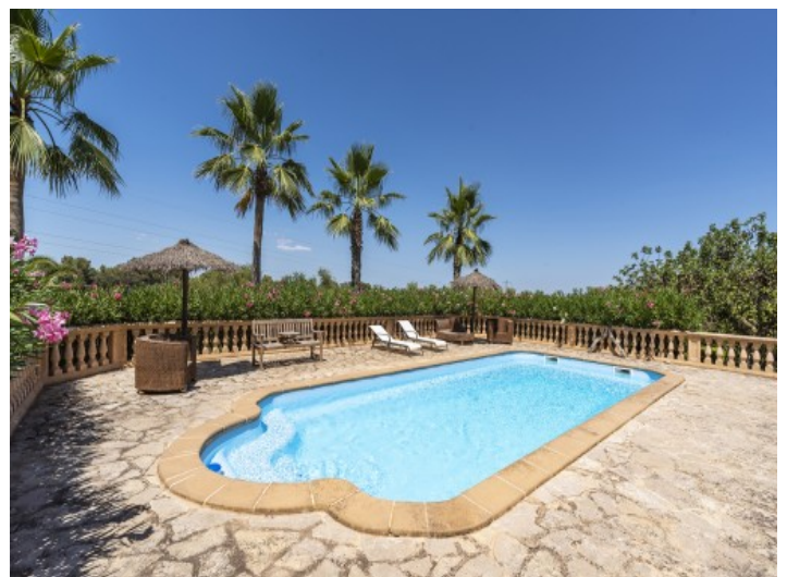
Alternative view of the pool

All information is correct to the best of our knowledge. Errors and prior sale excepted. This prospectus is purely for information purposes. Only the notarized deed of sale is legally binding.