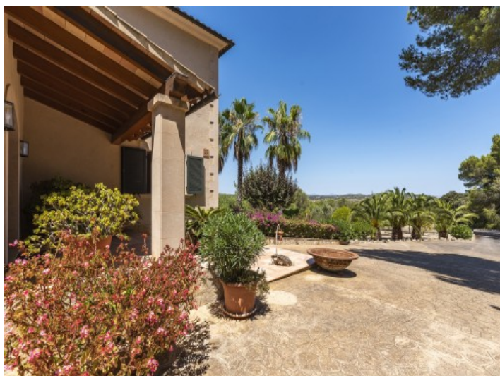
Entrance of the finca