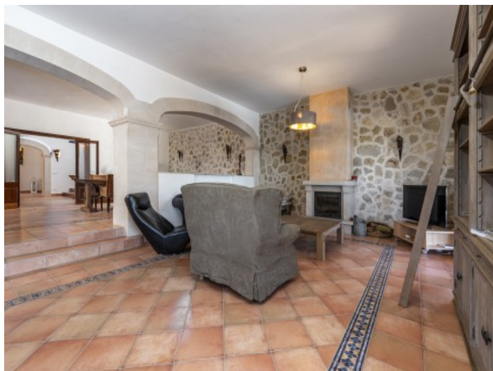
Living area with fire place