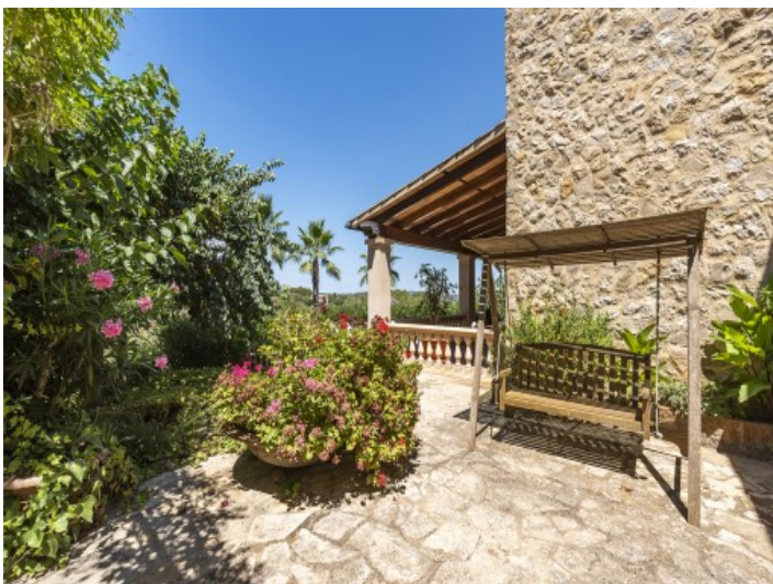
Charming terrace with sitting area