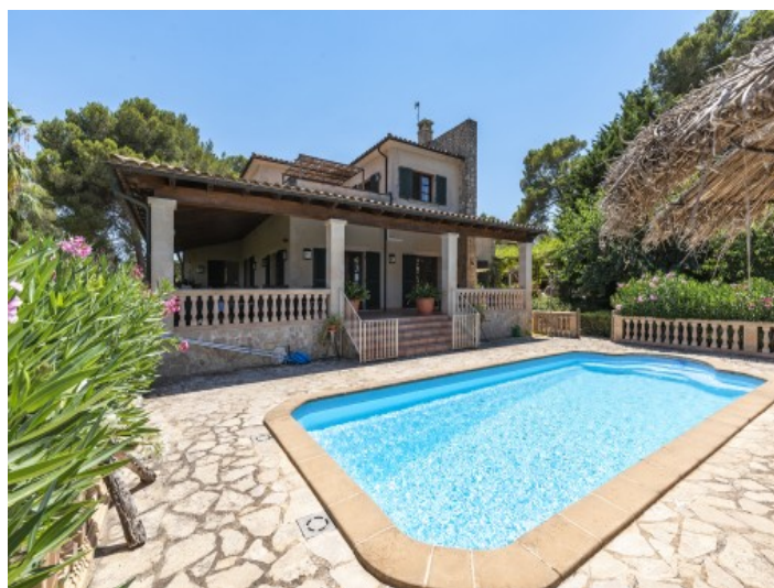
Back view of the finca