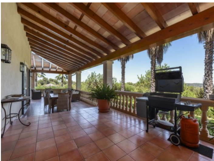
Covered dining area with barbecue