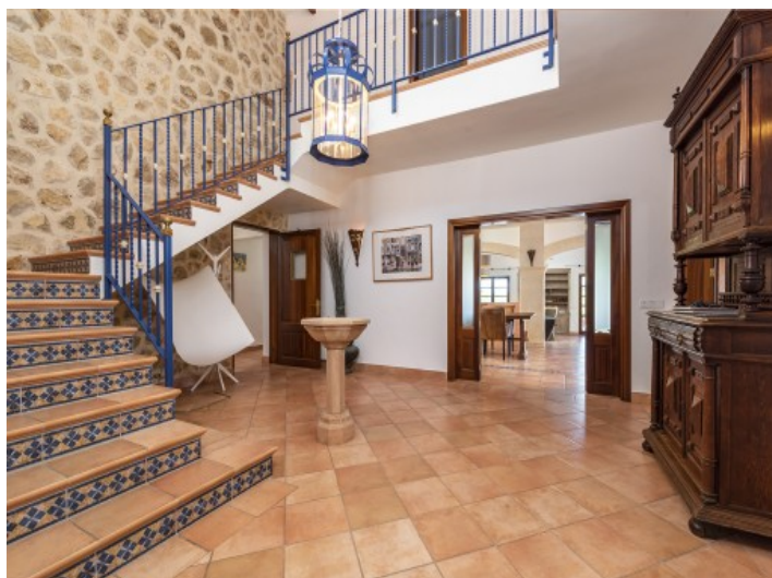
Open entrance are