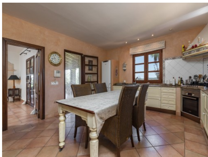
Rustic kitchen with dining area