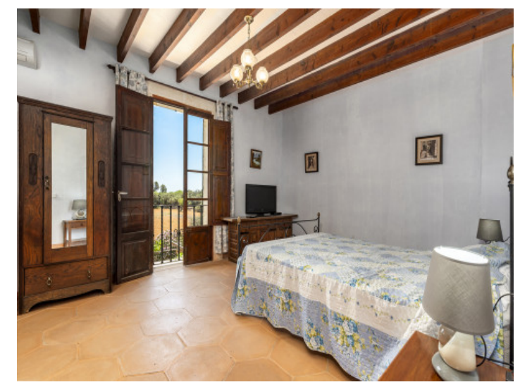
One of the 5 bedrooms