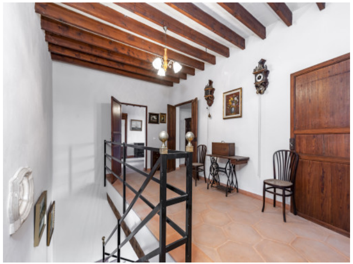
View of the upper hallway