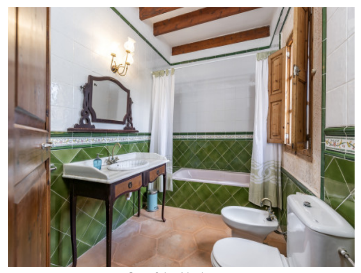
One of the 4 bathrooms