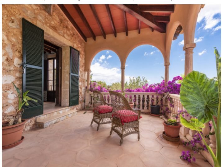
Spacious covered terrace