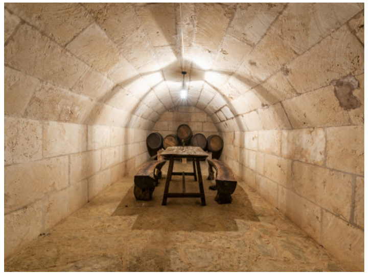
The wine cellar