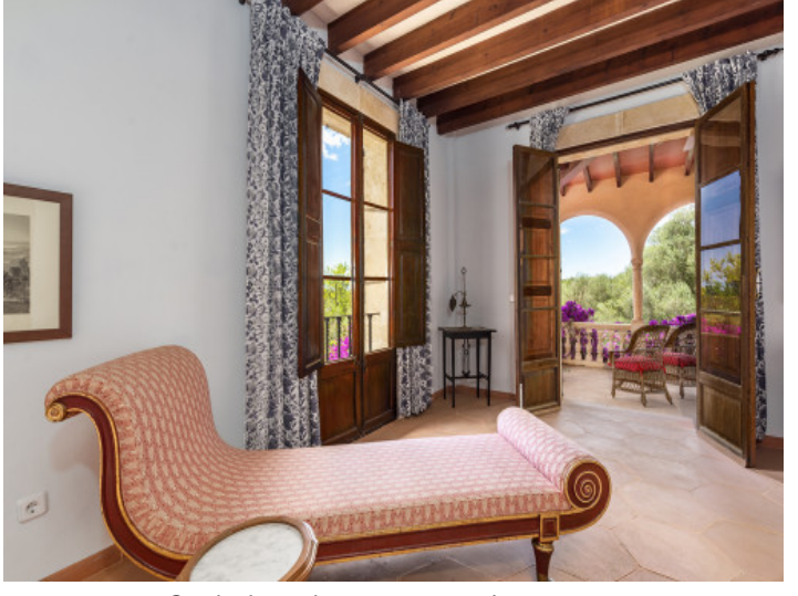
One bedroom has access to a private terrace