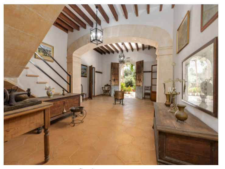
Spacious entrance area