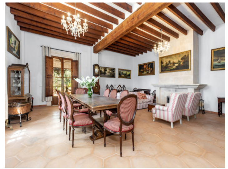
Living and dining room