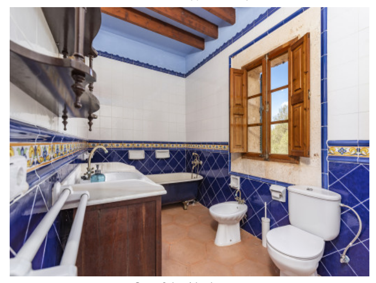
One of the 4 bathrooms