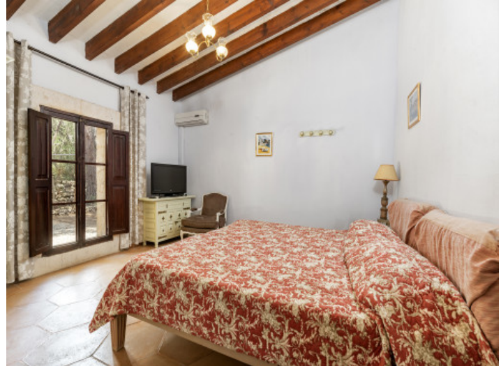
One of the 5 bedrooms