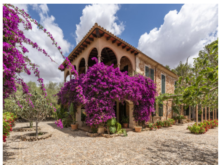
Splendid bougainvillea covers a part of the façade