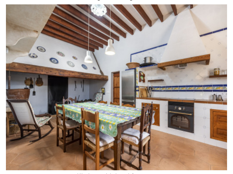
Noble dining area