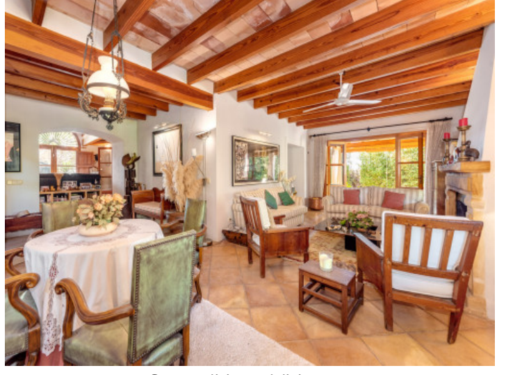
Separate living and dining area

All information is correct to the best of our knowledge. Errors and prior sale excepted. This prospectus is purely for information purposes. Only the notarized deed of sale is legally binding.