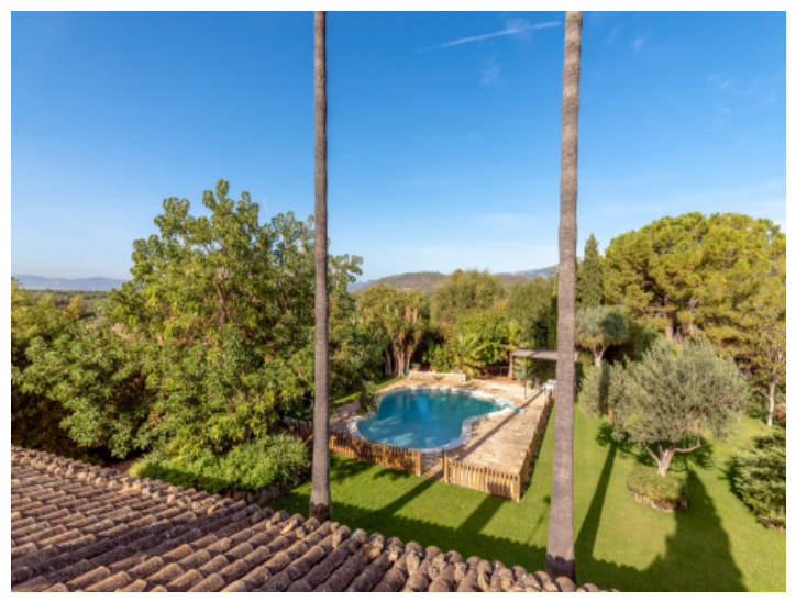
View to the pool

All information is correct to the best of our knowledge. Errors and prior sale excepted. This prospectus is purely for information purposes. Only the notarized deed of sale is legally binding.