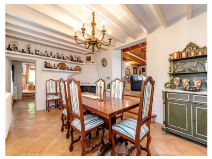
Separate dining area