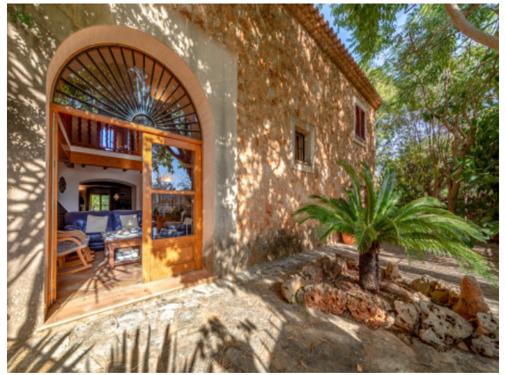
Access to the living area