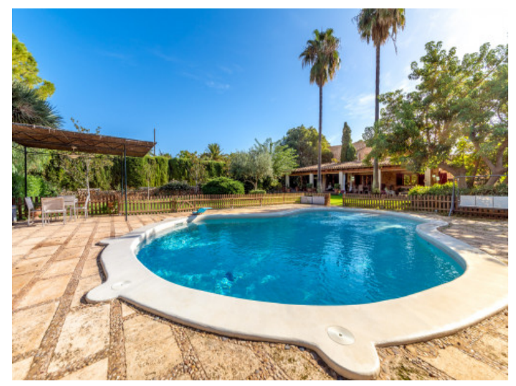
Beautiful pool area