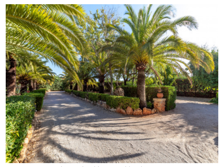
impressive drive way with palm trees