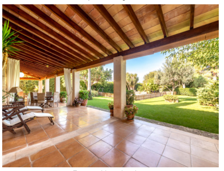
Terrace with garden views