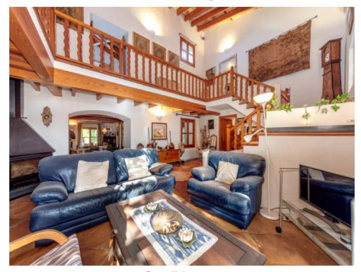
Open living area