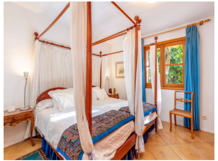
One of 7 bedrooms