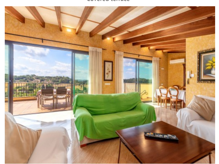
Spacious living area