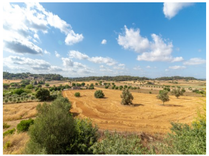
Views to the countryside