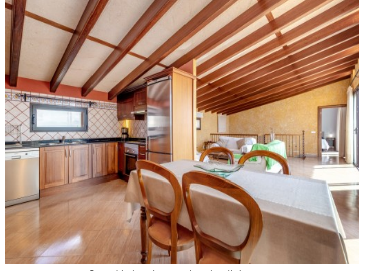
Open kitchen integrating the dining area

All information is correct to the best of our knowledge. Errors and prior sale excepted. This prospectus is purely for information purposes. Only the notarized deed of sale is legally binding.