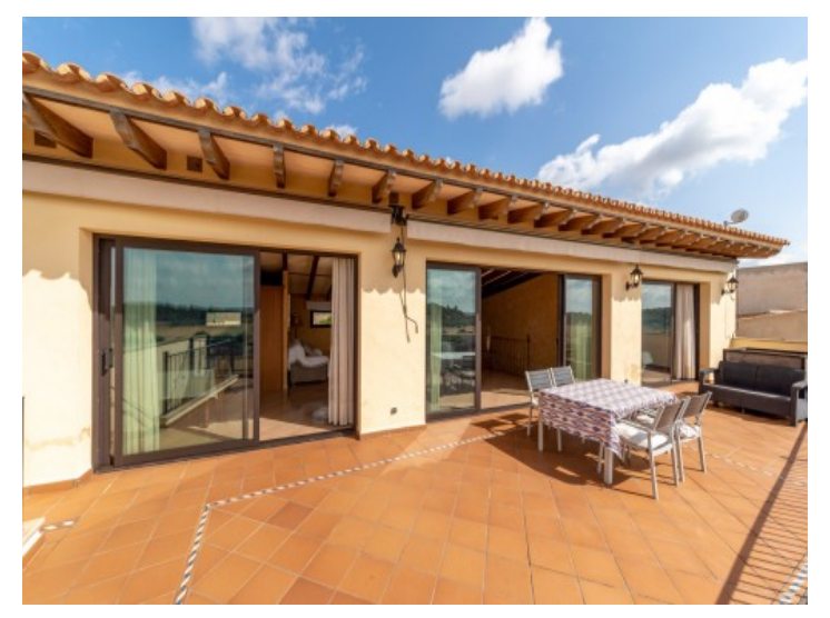
Large terrace with views