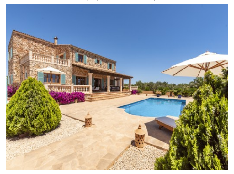
Exterior view and pool area