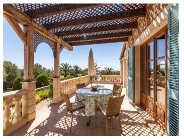
Inviting terrace of the kitchen