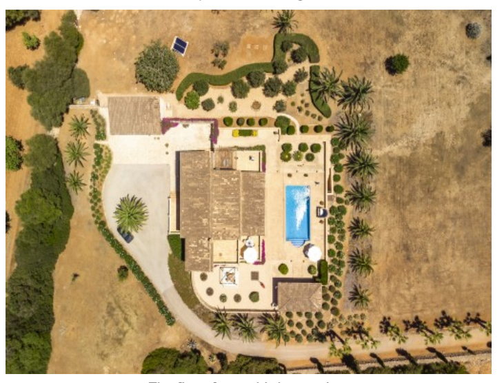
The finca from a birds-eye view