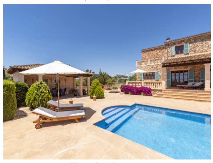
View to the barbecue area