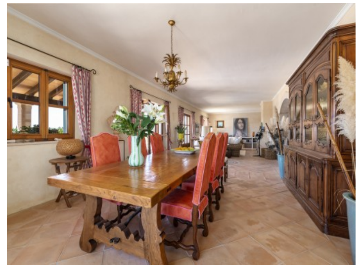
Open dining and living area