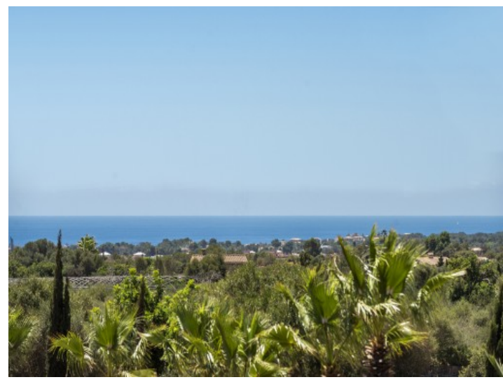
Close to the sea