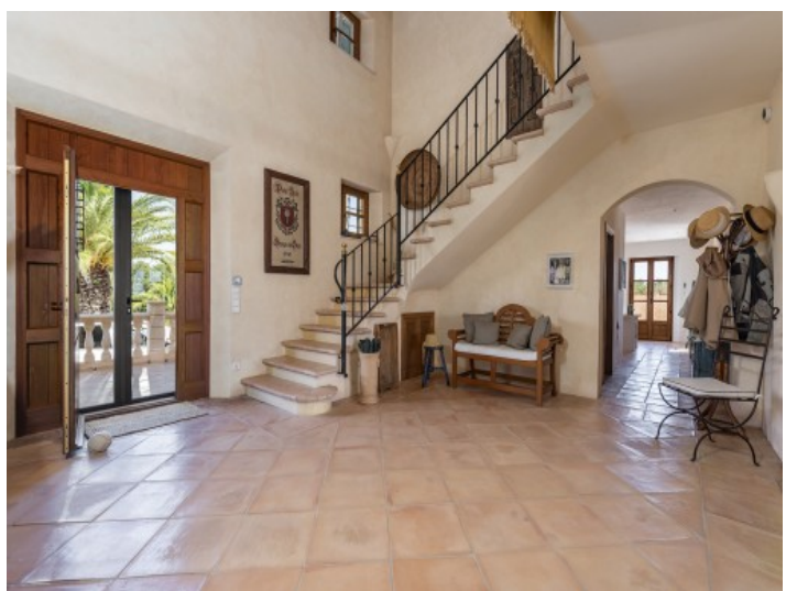
Impressive entrance area with high ceiling