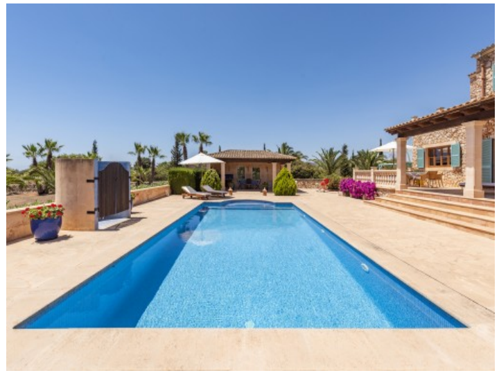
Inviting pool area of the finca