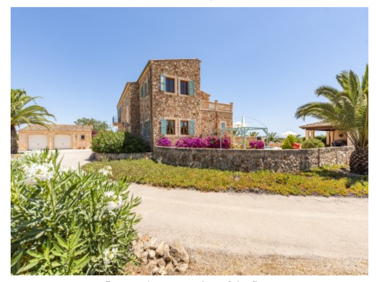
Front and entrance view of the finca