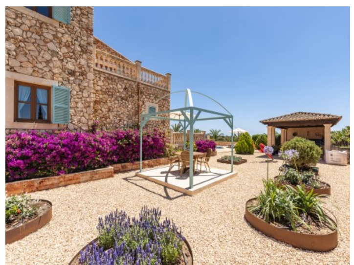
Side terrace with separate sitting area