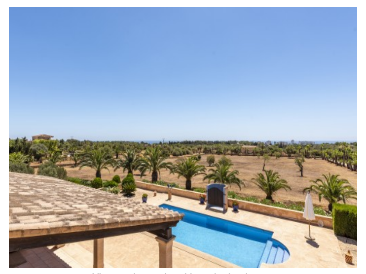
View to the pool and into the landscape