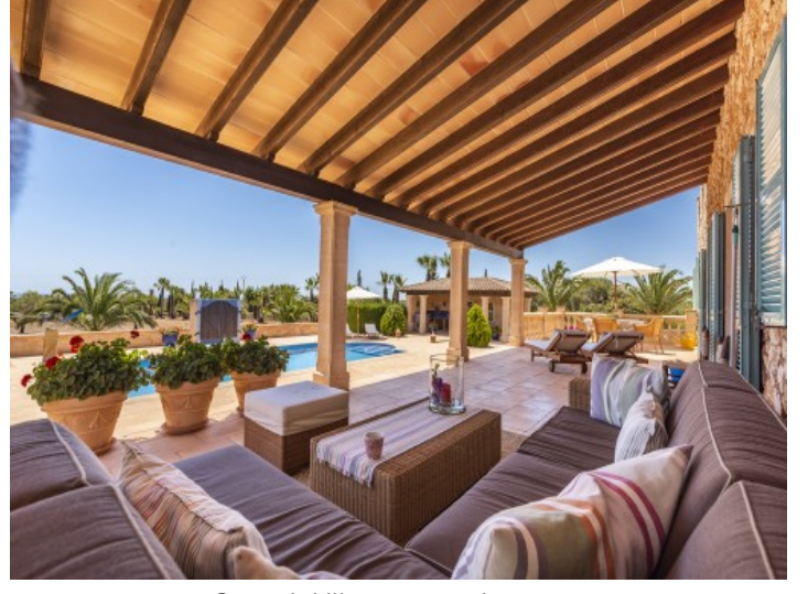
Covered chill out area on the terrace