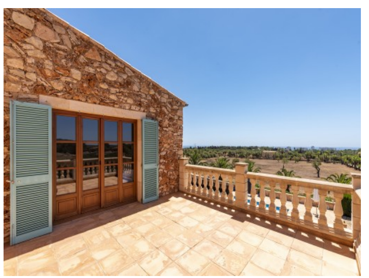
Sunny balcony with a view