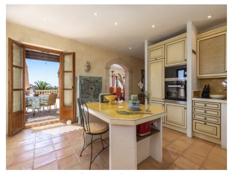
Access to another terrace