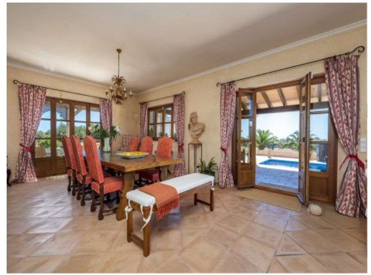
Access to the terrace