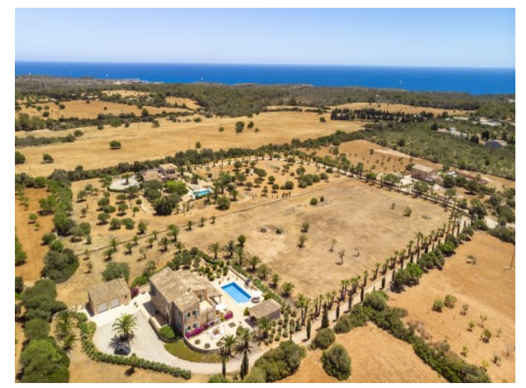
The finca property from a birds-eye view