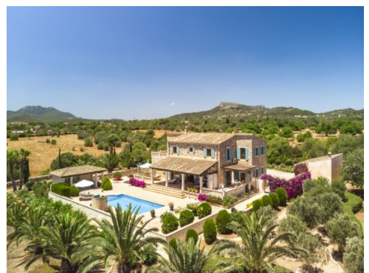
The finca property from a birds-eye view