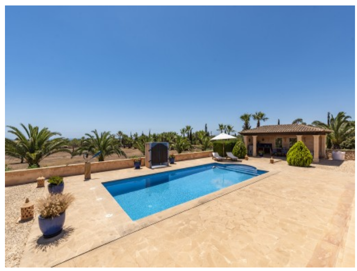
Splendid pool area with a view