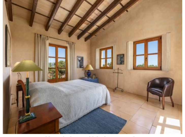
Master bedroom with bathroom en suite