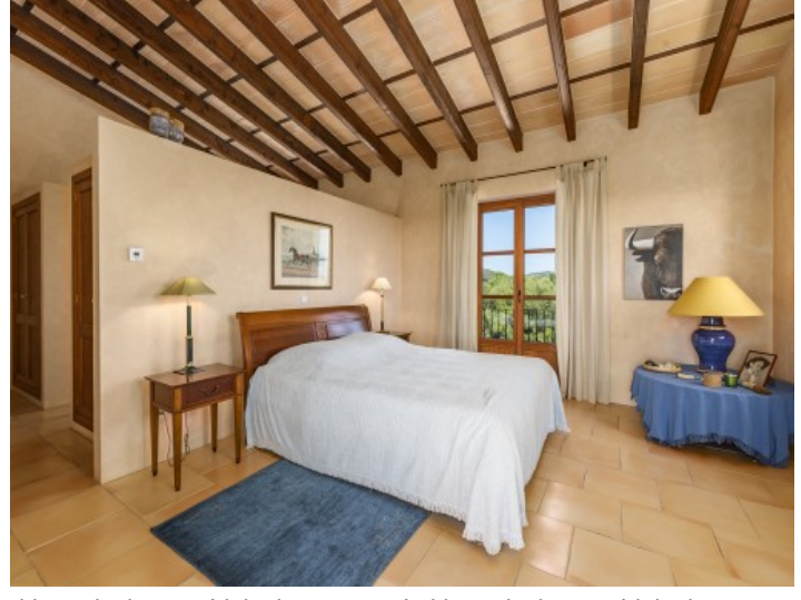
Master bedroom with bathroom en suiteMaster bedroom with bathroom en