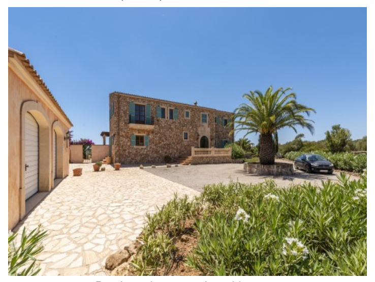
Exterior and entrance view with garage