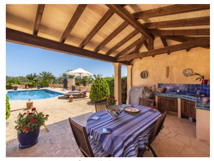
Covered barbecue area