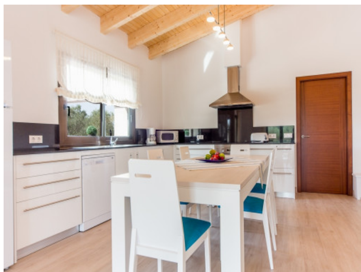
Modern kitchen with dining area