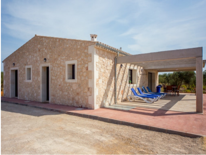
Mediterranean elements and modern equipment