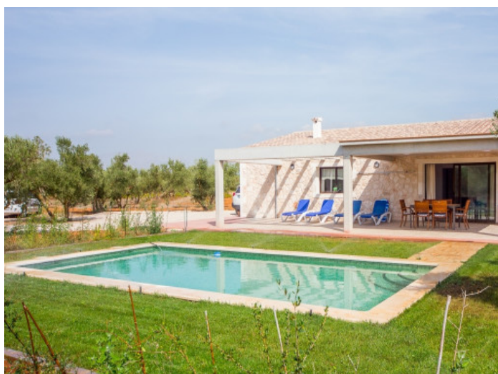
Large plot of 15.000 sqm with lots of privacy