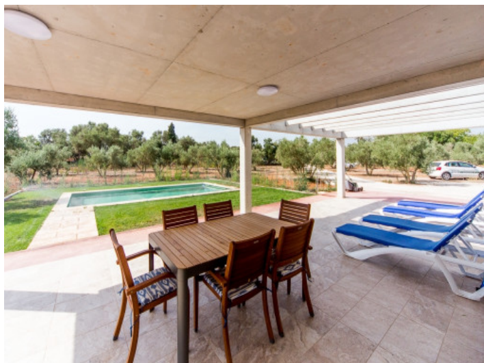
Covered terrace with dining area and views of the garden