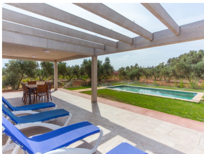
Lounge area on the terrace with views to the pool

All information is correct to the best of our knowledge. Errors and prior sale excepted. This prospectus is purely for information purposes. Only the notarized deed of sale is legally binding.