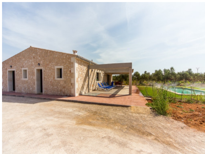
Access to the property