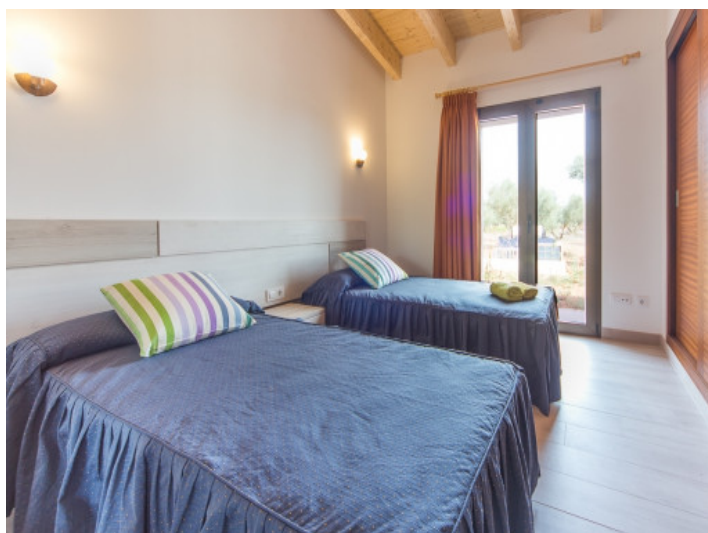
Double bedroom with panoramic windows