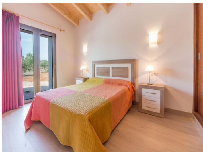
Friendly master bedroom