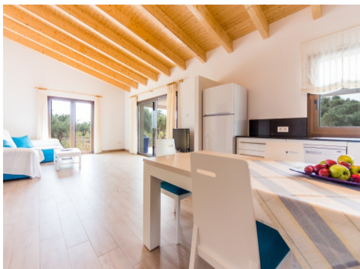
Spacious living and dining area