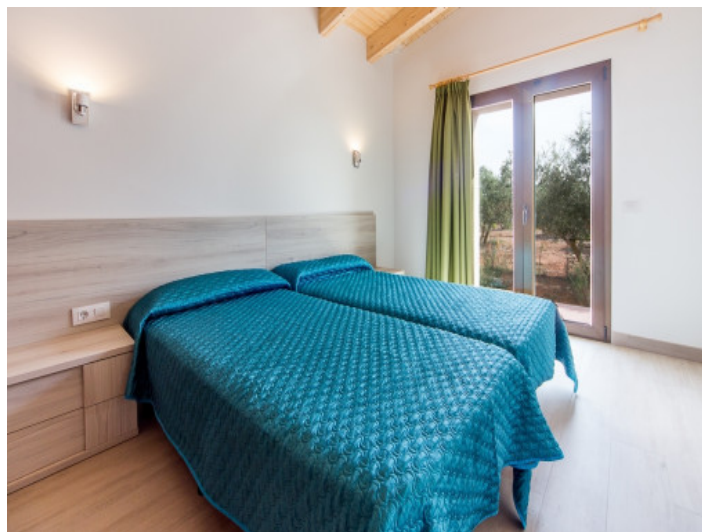
One of three double bedrooms