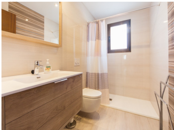
Bright master bathroom with large shower