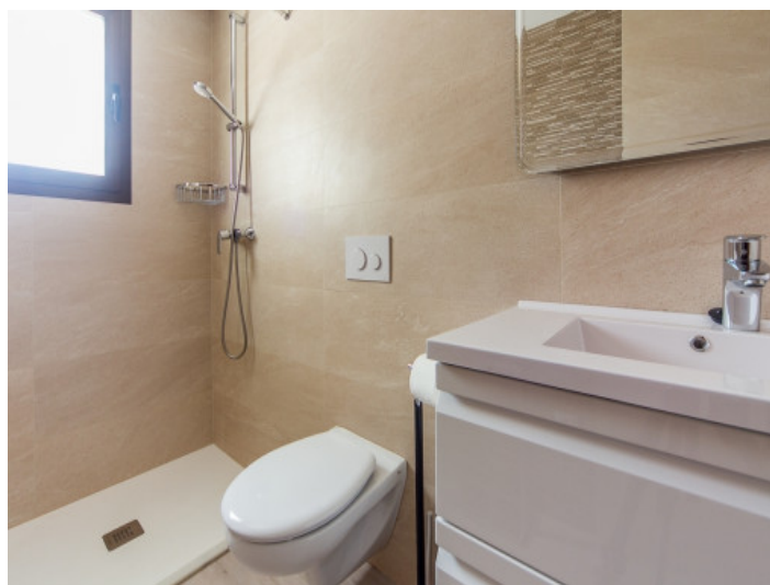
Second bathroom with shower