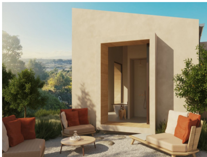
Chill Out area