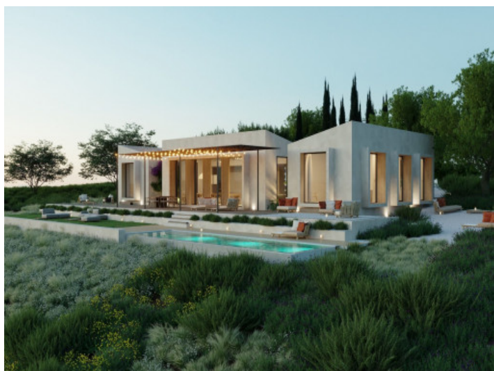
The finca by night