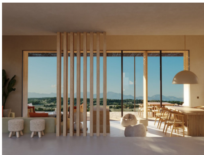
Light flooded and open living and dining area