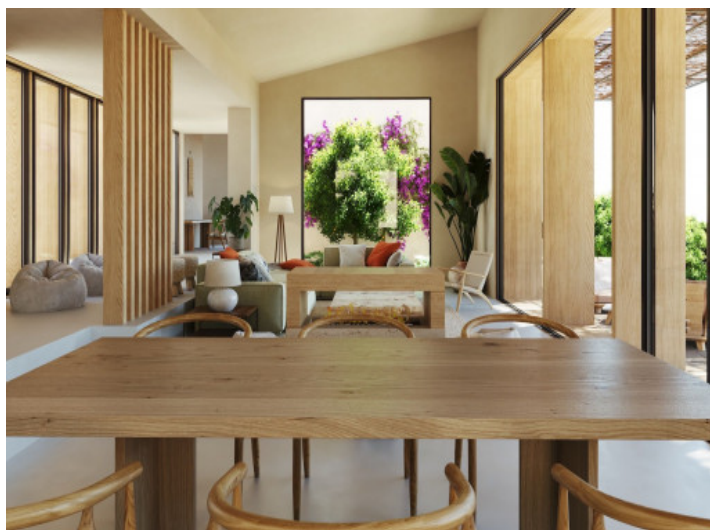
Light flooded and open living and dining area