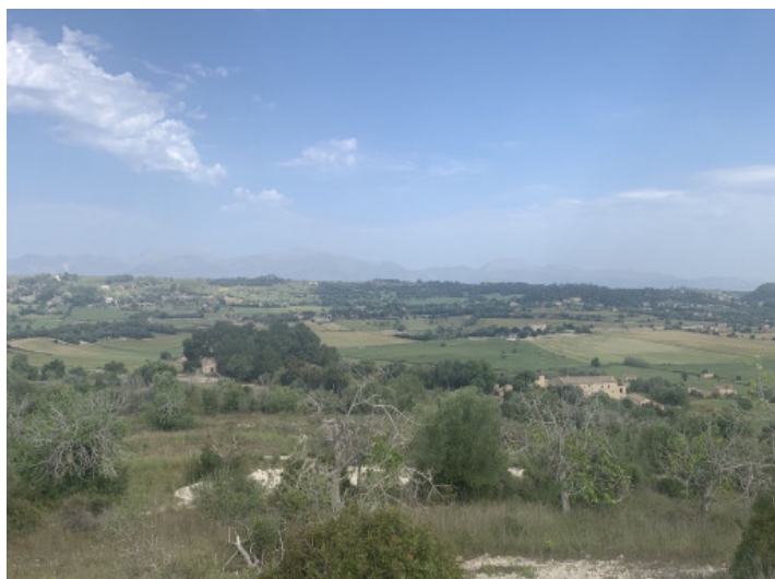
View from the plot

All information is correct to the best of our knowledge. Errors and prior sale excepted. This prospectus is purely for information purposes. Only the notarized deed of sale is legally binding.