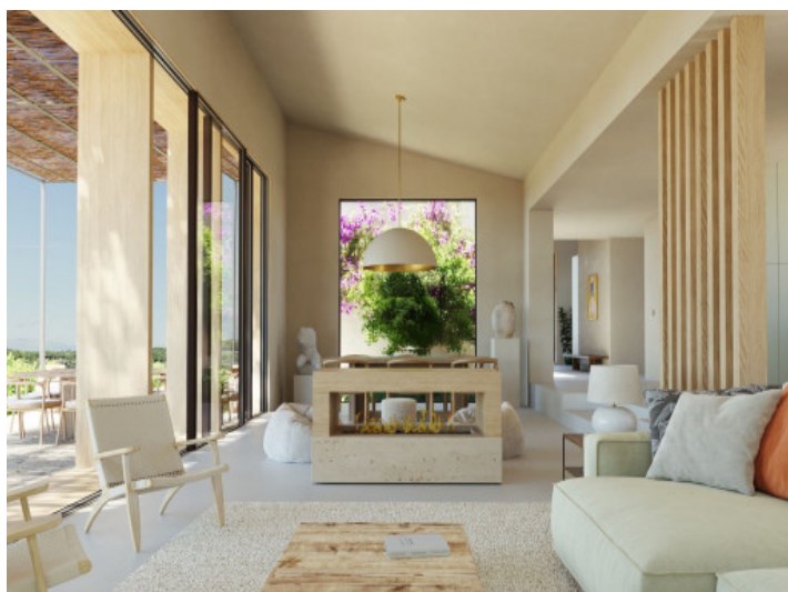
Light flooded and open living and dining area