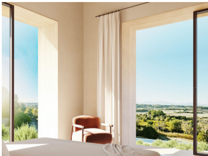
Double bedroom with a view