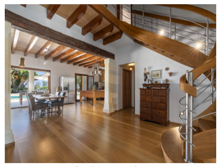
Open living area and floor