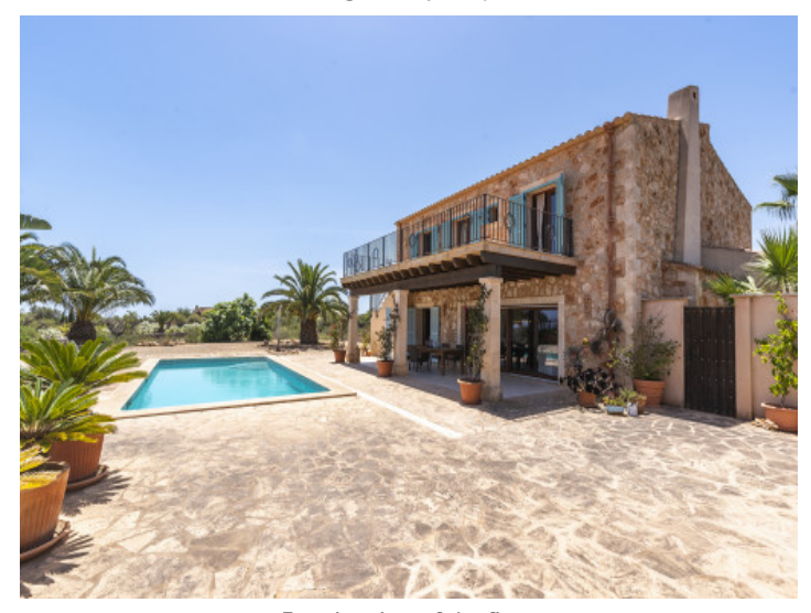
Exterior view of the finca