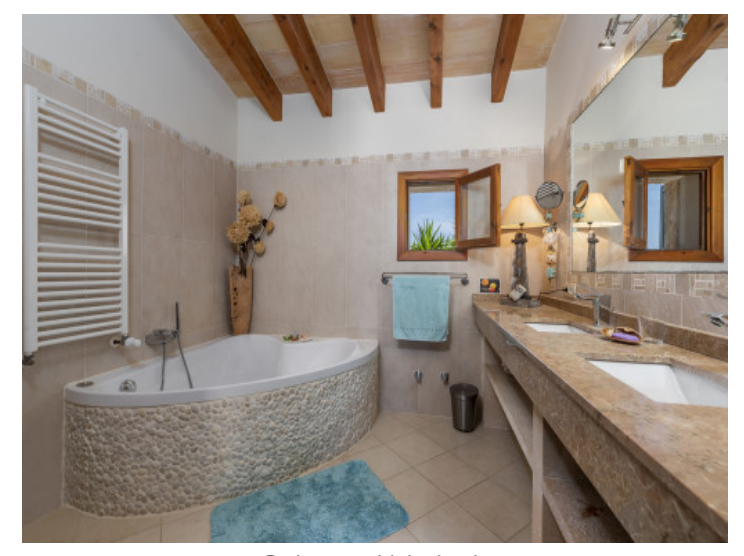
Bathroom with bath tub