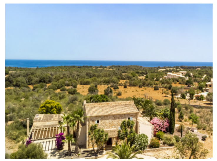
Close to the sea