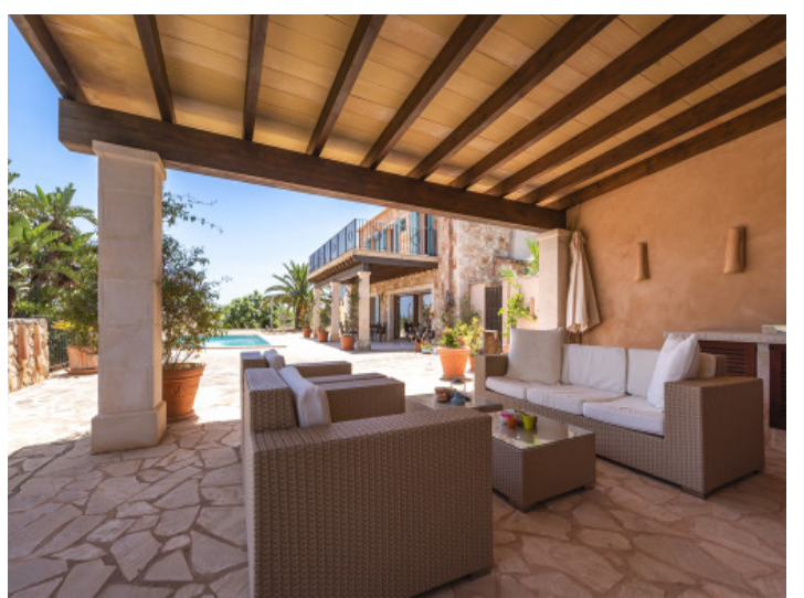
Covered chill out area