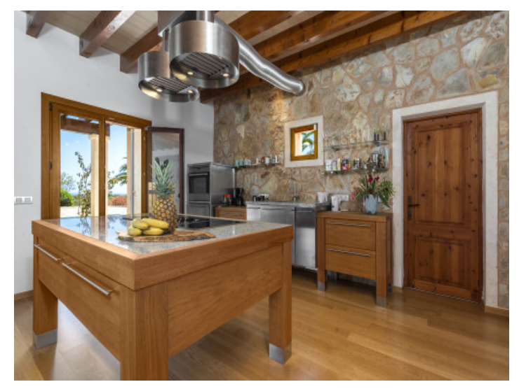
Kitchen and dining area