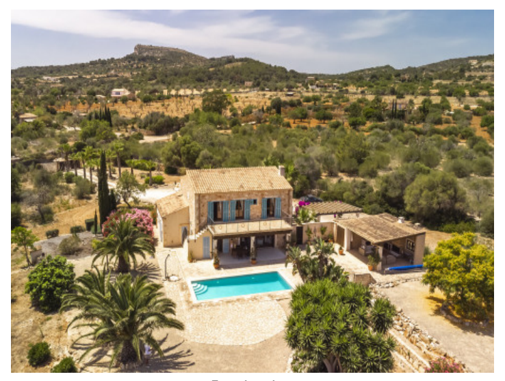
Access to the finca