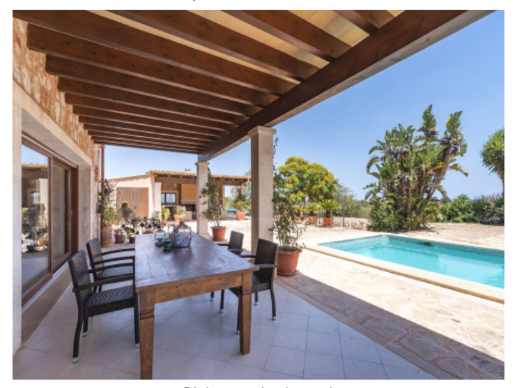
Dining area by the pool