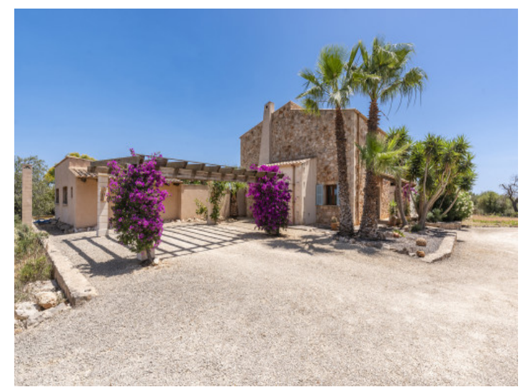
Exterior view of the finca