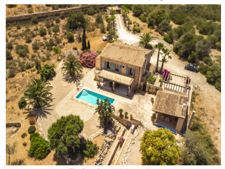
The finca from a birds-eye view