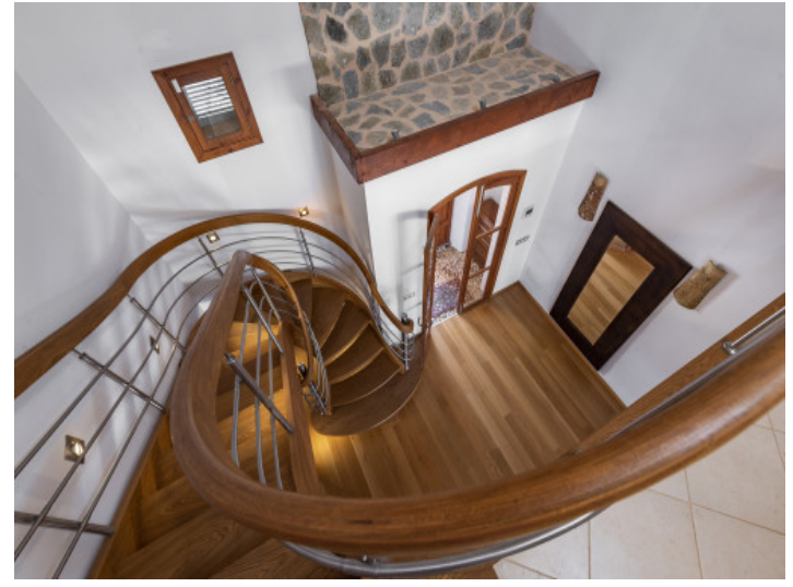
Spacious entrance area