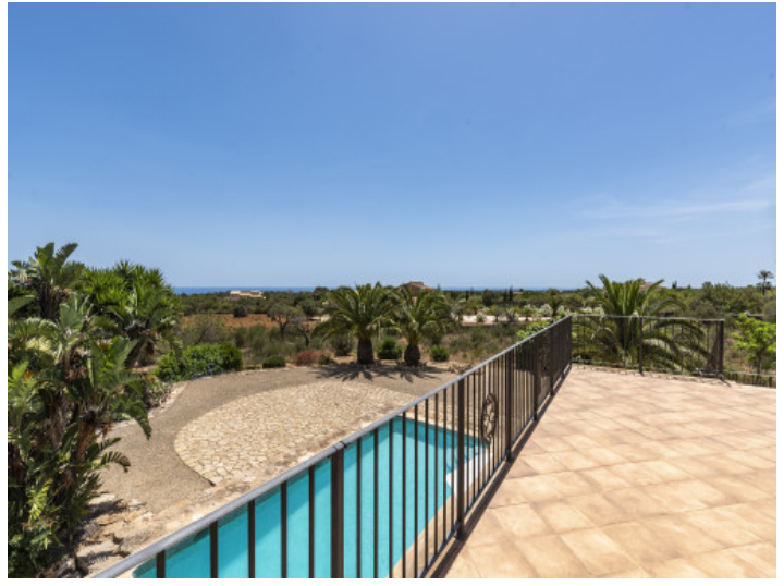
Romantic finca with pool in S'Espinagar