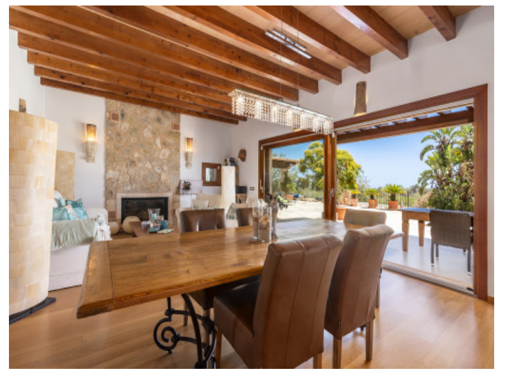
Dining and living area