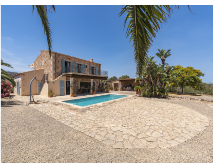
Exterior view of the finca