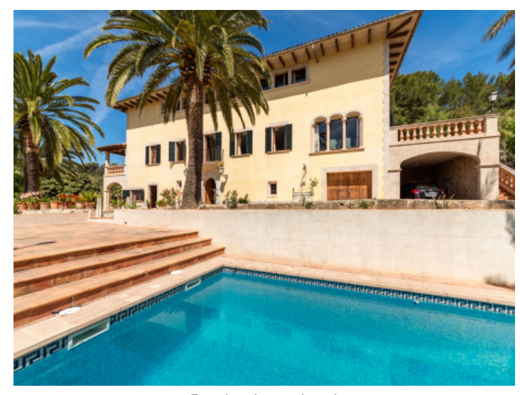
Exterior view and pool