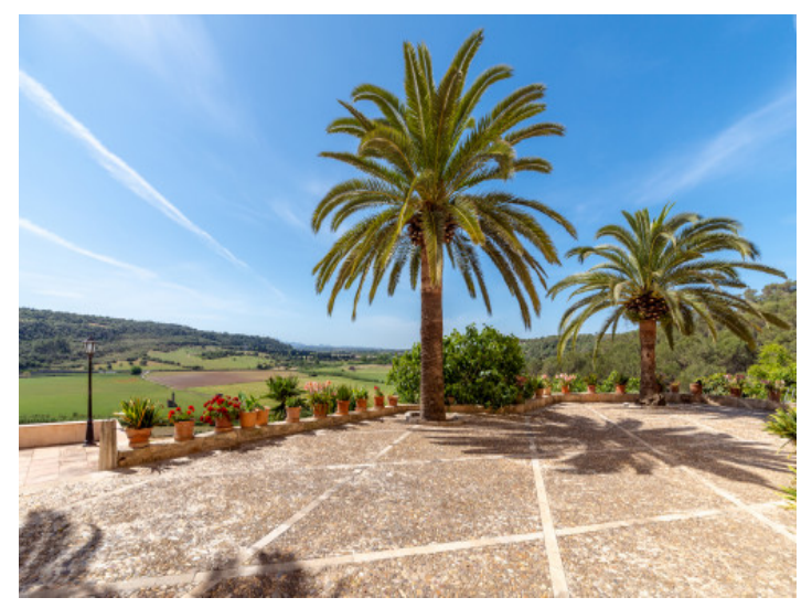
Terrace and view