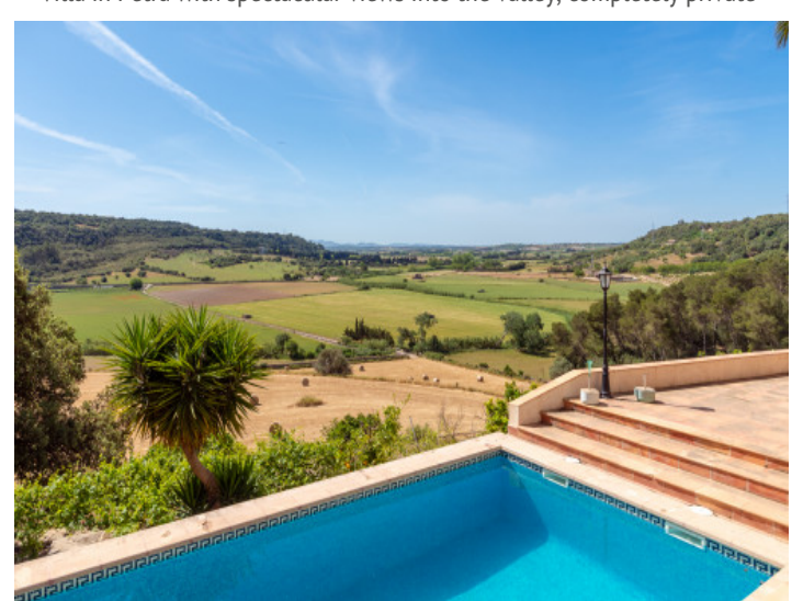
Pool and view