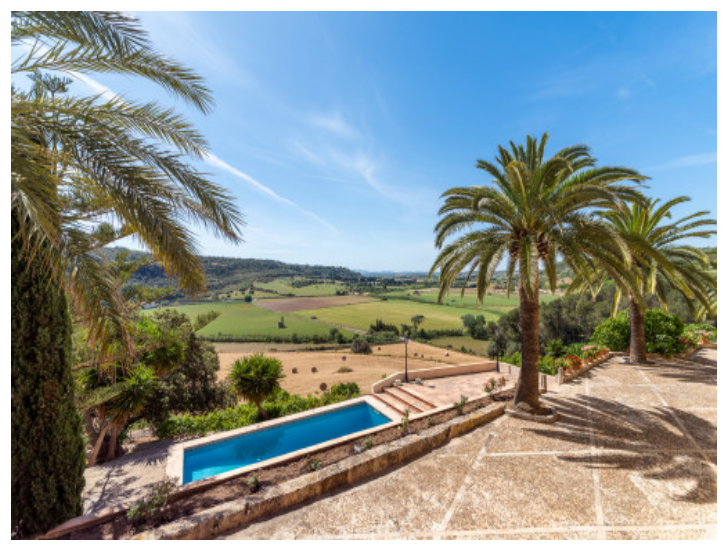
Villa in Petra with spectacular views into the valley, completely private