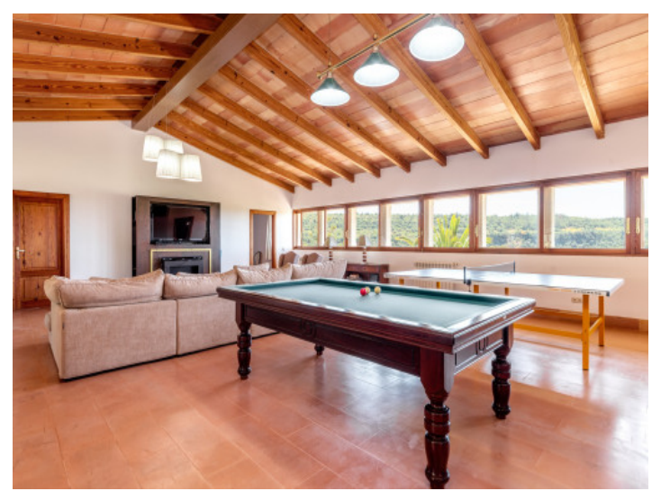
Further living area