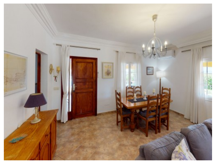
Dining and entrance area