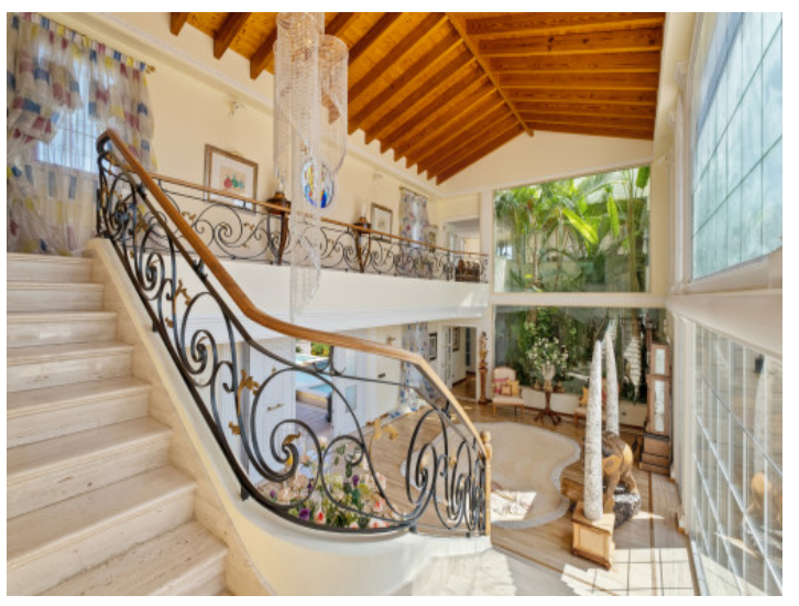
View to the inner garden and stairs