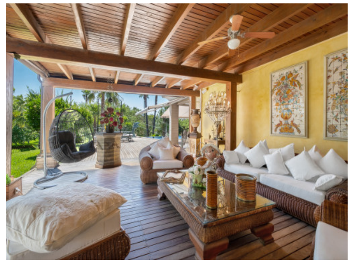
Covered lounge terrace