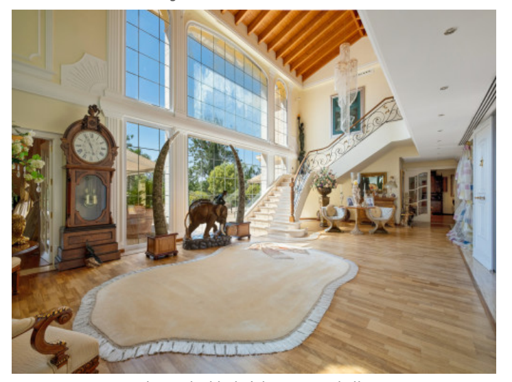
Large double-height entrance hall