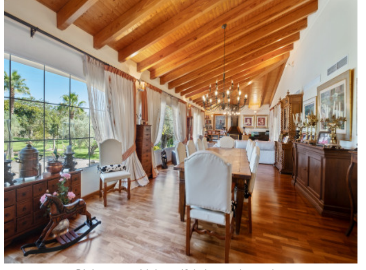
Dining area with beautiful view to the garden

All information is correct to the best of our knowledge. Errors and prior sale excepted. This prospectus is purely for information purposes. Only the notarized deed of sale is legally binding.