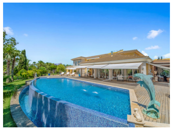
Luxurious property in a prime location with separate annex building and