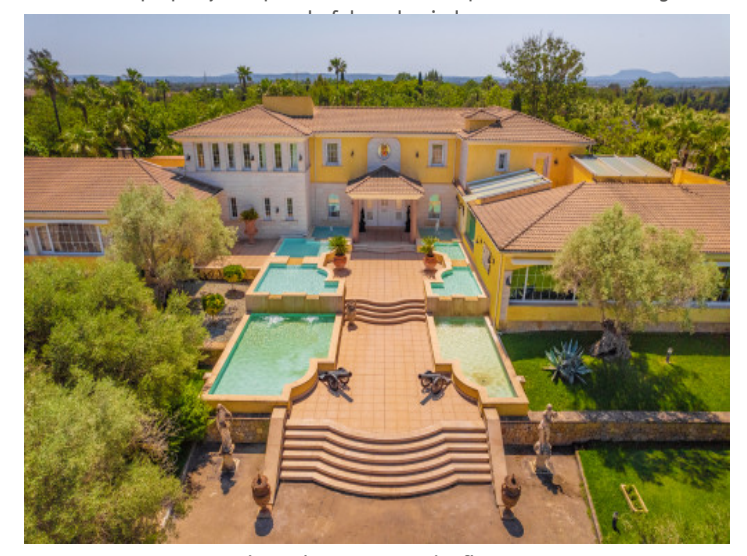
Imposing access to the finca