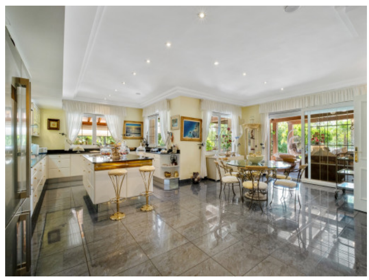
Large kitchen with terrace access