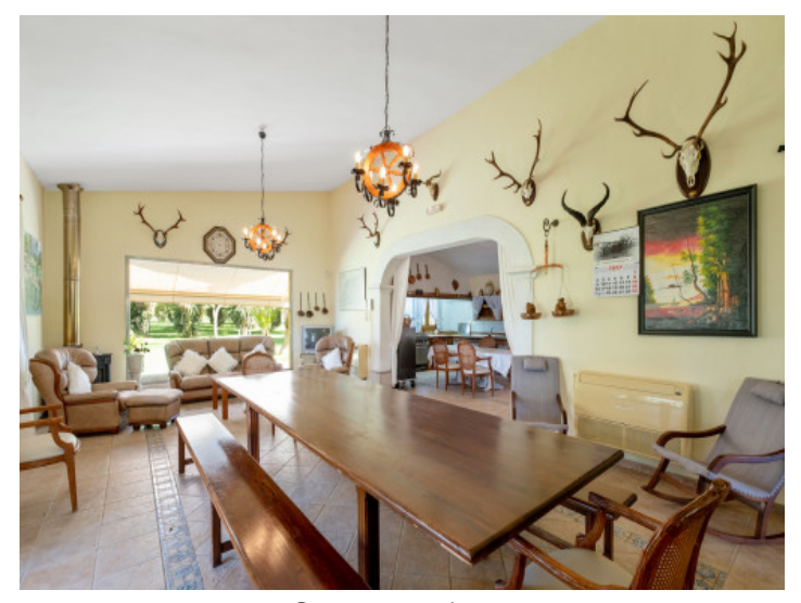
Separate guest house