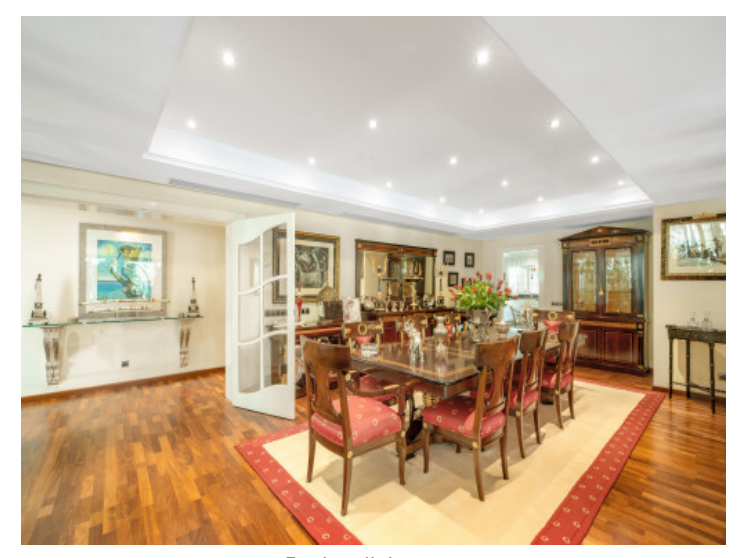
Further dining area