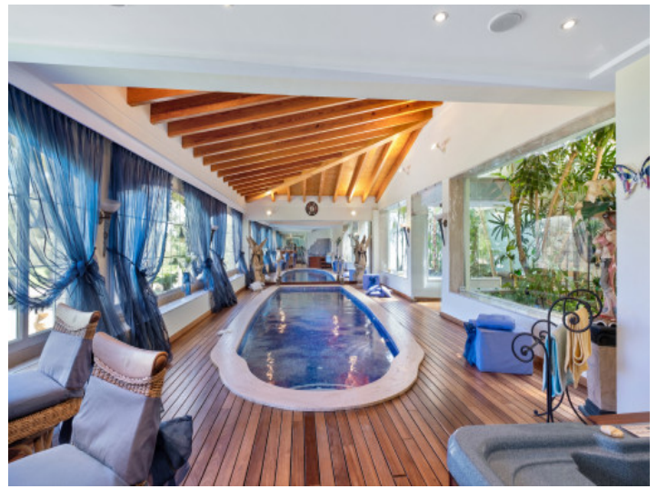
Luxurious indoor pool