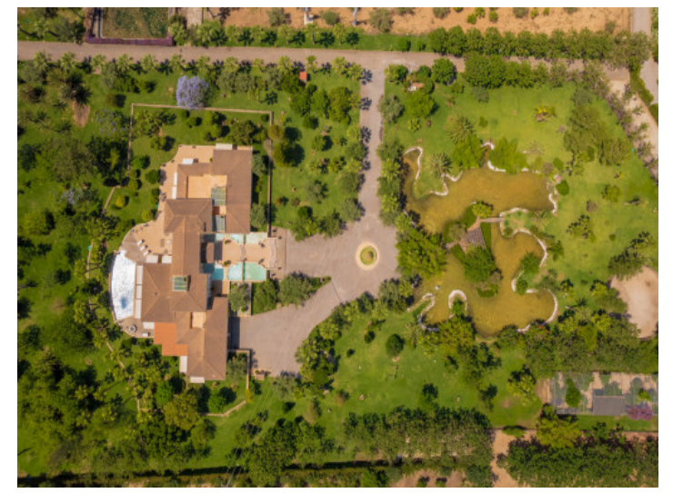
Property with 50.000 sqm park with lakes

All information is correct to the best of our knowledge. Errors and prior sale excepted. This prospectus is purely for information purposes. Only the notarized deed of sale is legally binding.