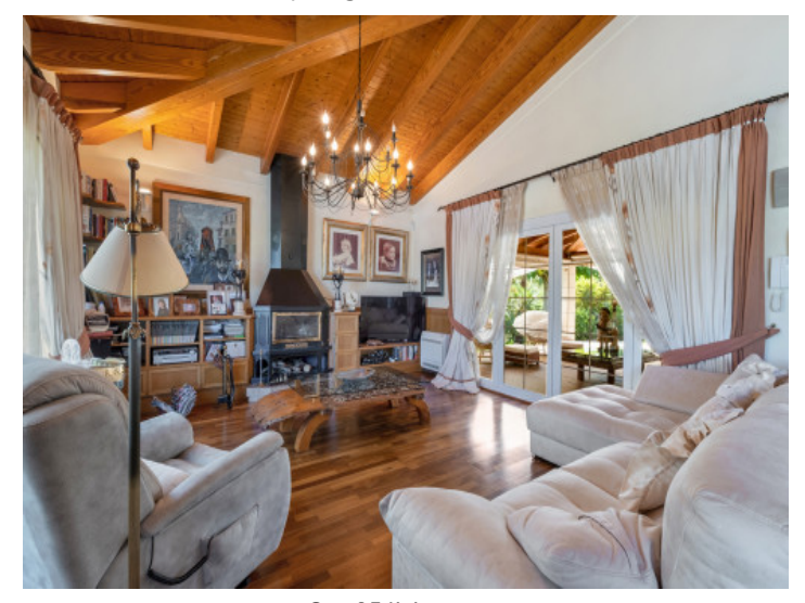
On of 3 living areas