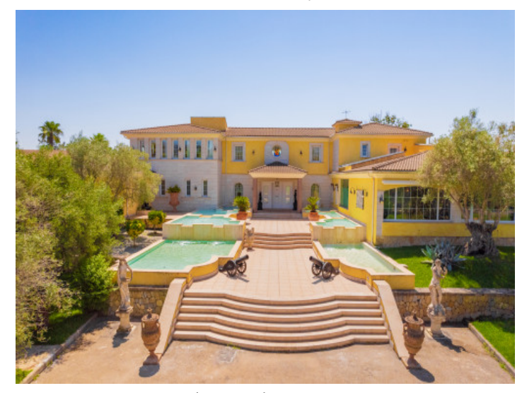
Access to the property