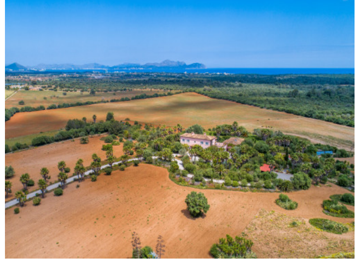
Bird's eye view of the finca with panorama views

PORTA MALLORQUINA® Your home. Our passion.