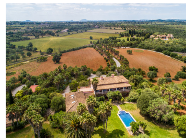
View of the mediterranean plot Access to the property All information is correct to the best of our knowledge. Errors and prior sale excepted. This prospectus is purely for information purposes. Only the notarized deed of sale is legally binding.

PORTA MALLORQUINA • THERESIENSTR.: 81, 80333 MUNICH TEL. +34 971 698 242 • INFO@PORTAMALLORQUINA.COM