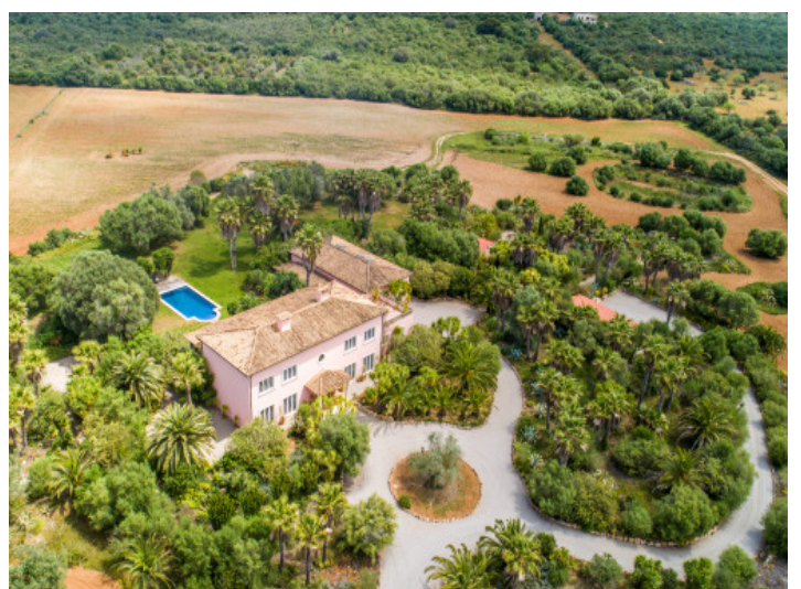
View of the access to the finca