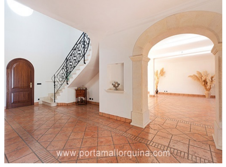
Generous entrance area

PORTA MALLORQUINA® Your home. Our passion.