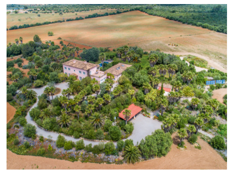
Finca surrounded by an oasis of plam trees