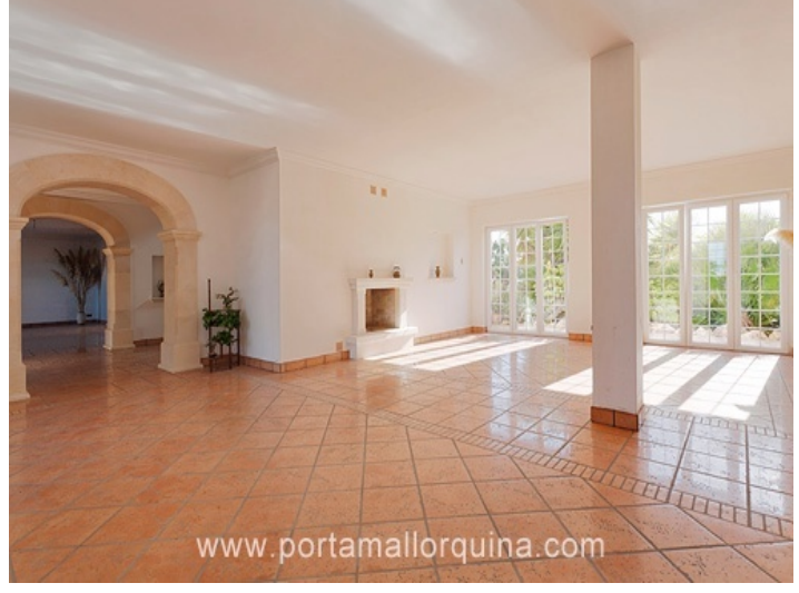
Lightflooded living area