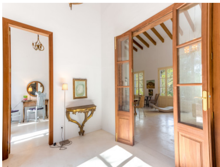
Appealing entrance area