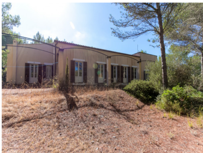
View of the studio house from the outside