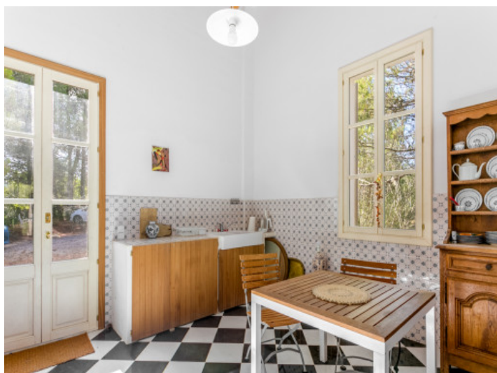
Lovely kitchen with tiled floor