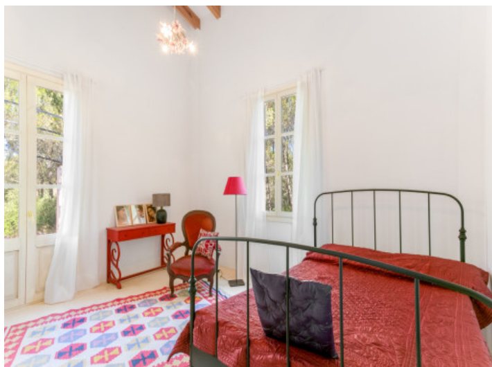
Bedroom with access to the garden