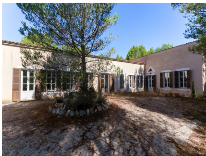
Another perspective of the house

All information is correct to the best of our knowledge. Errors and prior sale excepted. This prospectus is purely for information purposes. Only the notarized deed of sale is legally binding.