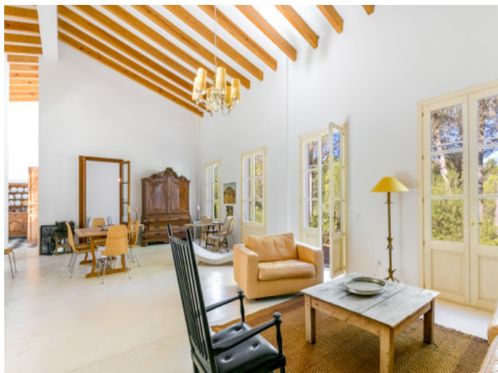
Lightflooded living area with high ceiling