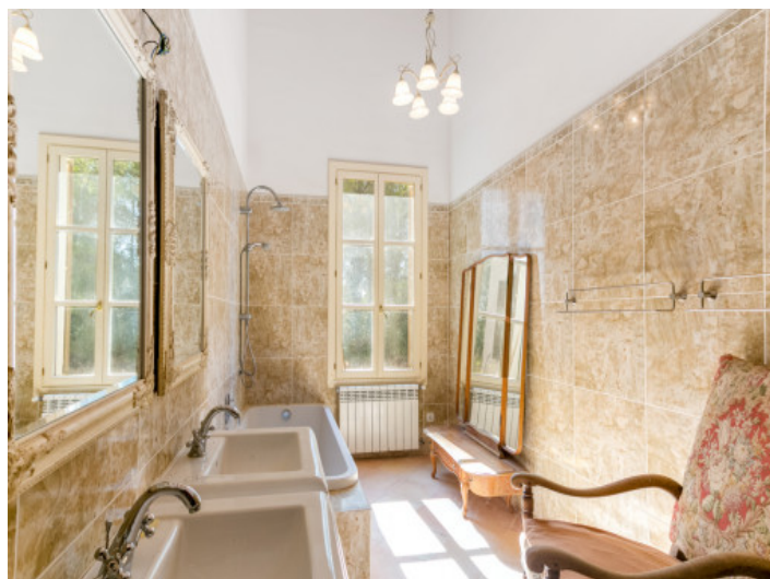
Sunny bathroom with bathtub

All information is correct to the best of our knowledge. Errors and prior sale excepted. This prospectus is purely for information purposes. Only the notarized deed of sale is legally binding.