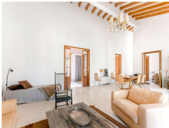
Spacious living area with beautiful wooden ceiling beams