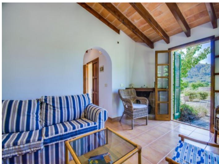
Separate living area