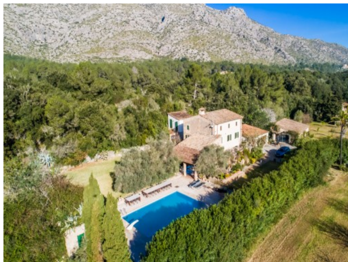
Exterior view of the property