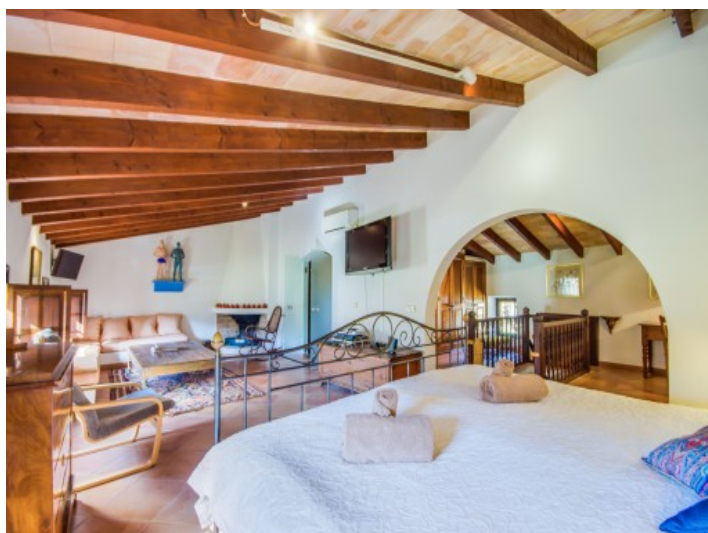
Master suite with chill out area