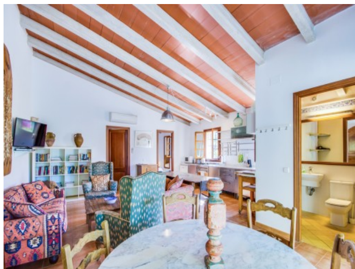
Open living and dining area of the guest house

All information is correct to the best of our knowledge. Errors and prior sale excepted. This prospectus is purely for information purposes. Only the notarized deed of sale is legally binding.