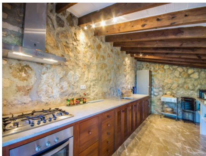
Rustik exterior kitchen