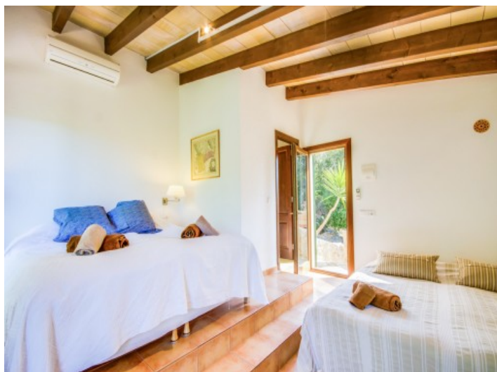
Cozy double bedroom with balcony