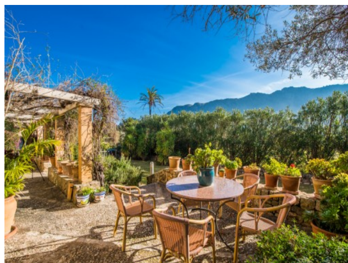
Another terrace with sitting area

All information is correct to the best of our knowledge. Errors and prior sale excepted. This prospectus is purely for information purposes. Only the notarized deed of sale is legally binding.