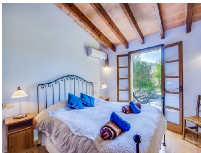
Double bedroom of the guest house