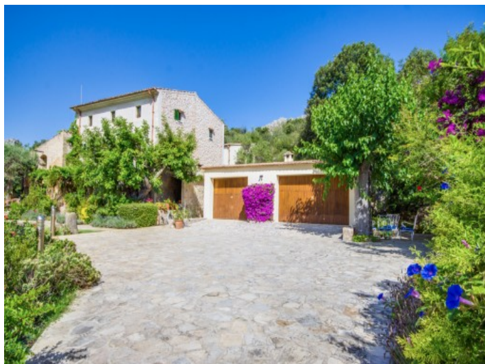
Entrance area with 2 garages