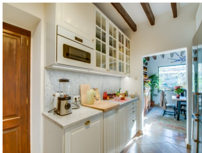
Modern kitchen in white