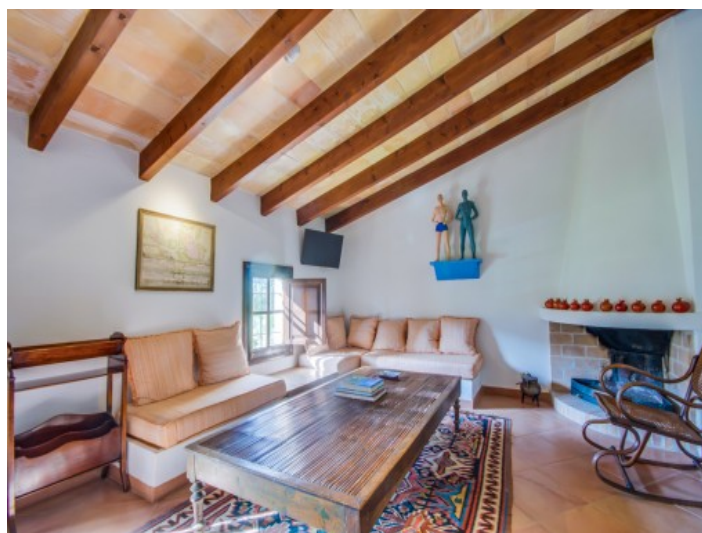
Master suite with chill out area