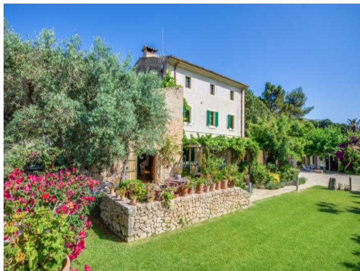
Exterior view of the main house