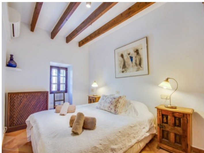
Cozy double bedroom