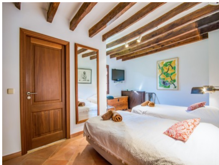
Cozy double bedroom with bathroom en suite