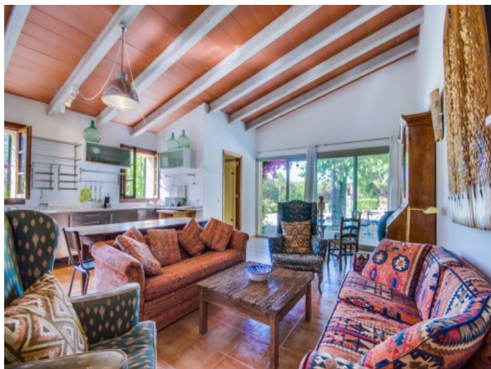
Open living and dining area of the guest house