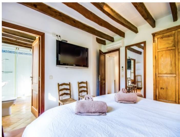
Cozy double bedroom with bathroom en suite