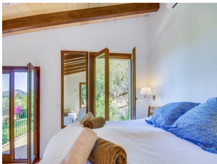
Cozy double bedroom with balcony