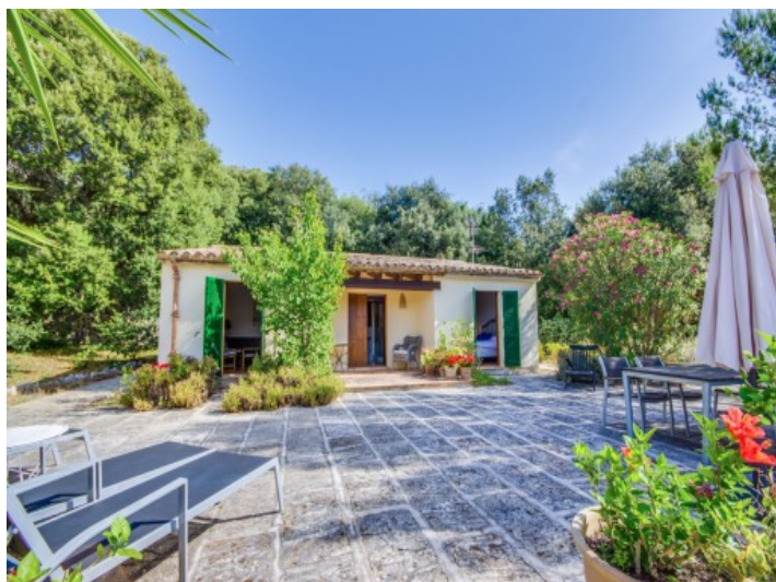
Exterior view of the guest house