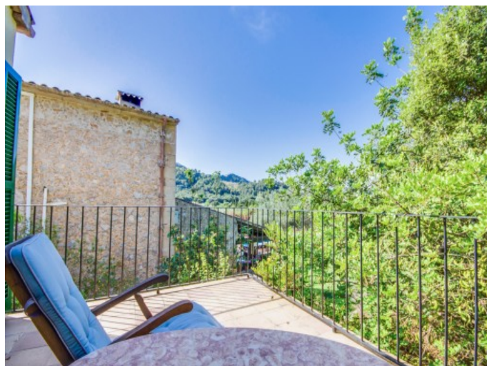
Balcony with sitting area

All information is correct to the best of our knowledge. Errors and prior sale excepted. This prospectus is purely for information purposes. Only the notarized deed of sale is legally binding.