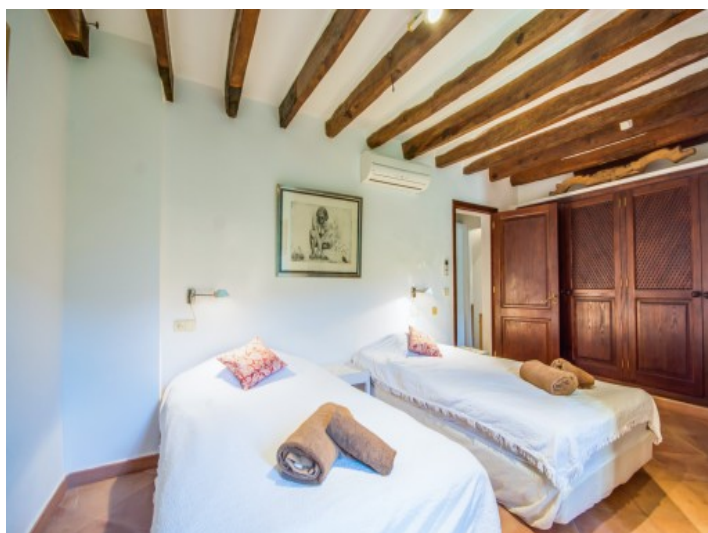
Cozy double bedroom with bathroom en suite