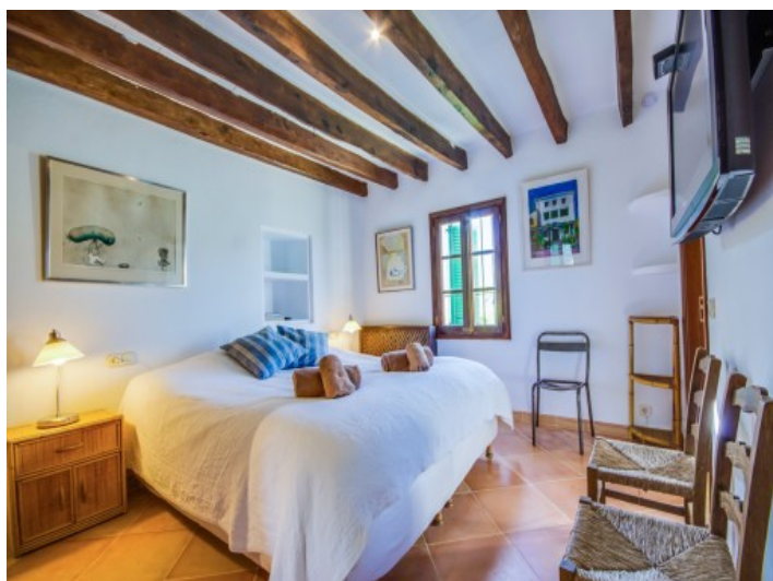
Cozy double bedroom with bathroom en suite