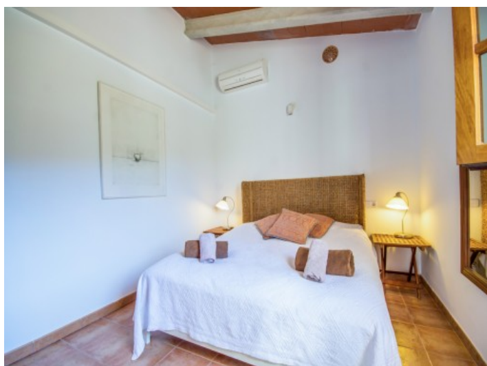
Cozy double bedroom