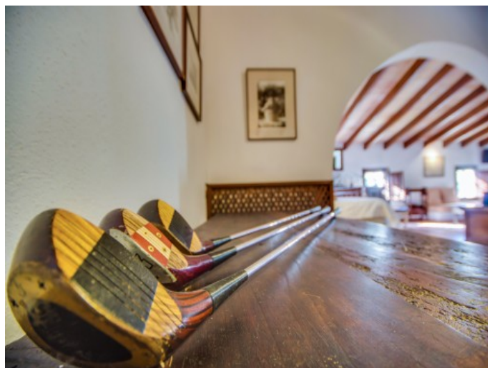
Master suite with chill out area

All information is correct to the best of our knowledge. Errors and prior sale excepted. This prospectus is purely for information purposes. Only the notarized deed of sale is legally binding.