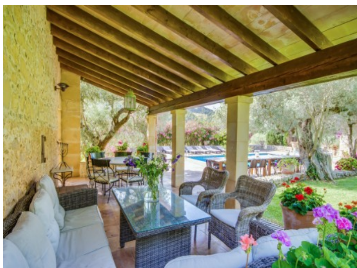
Covered chill out area on the terrace