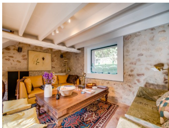
Separate sitting area