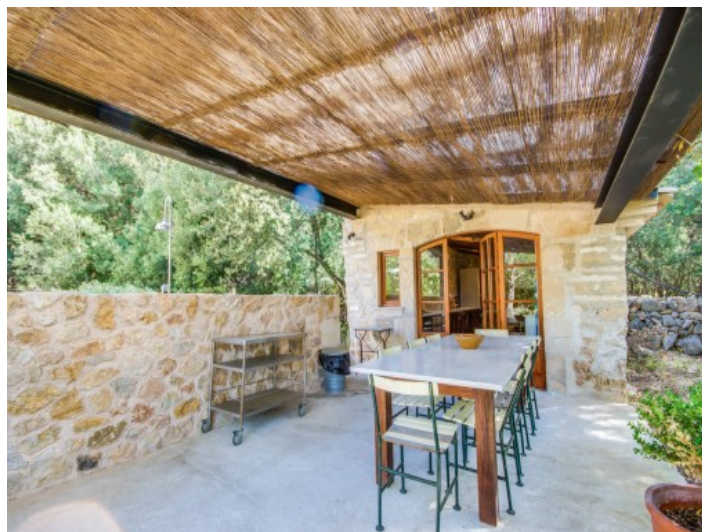
Terrace of the exterior kitchen