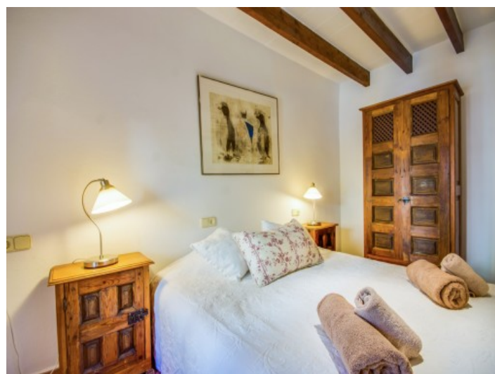
Cozy double bedroom

All information is correct to the best of our knowledge. Errors and prior sale excepted. This prospectus is purely for information purposes. Only the notarized deed of sale is legally binding.