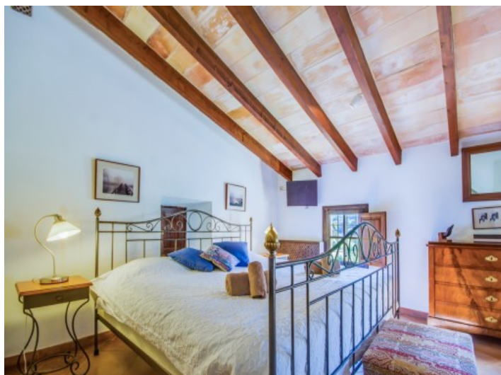
Master suite with chill out area