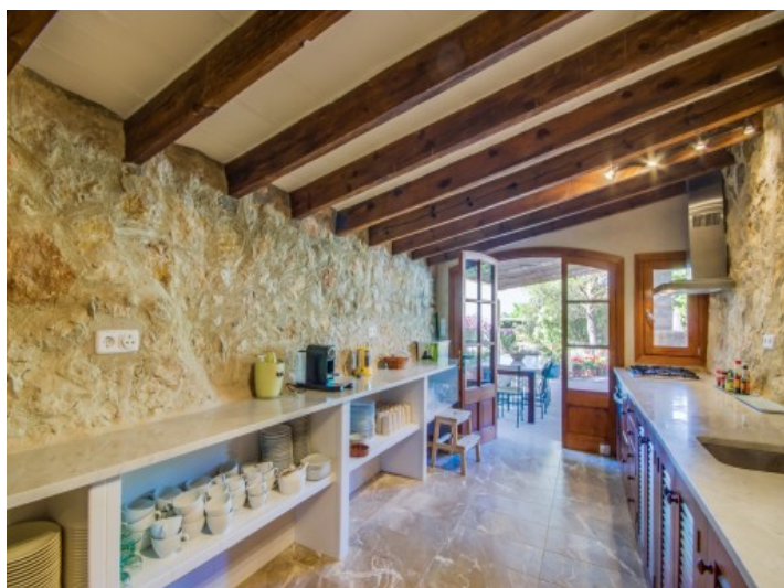
Rustik exterior kitchen