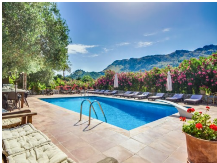
Inviting main pool area