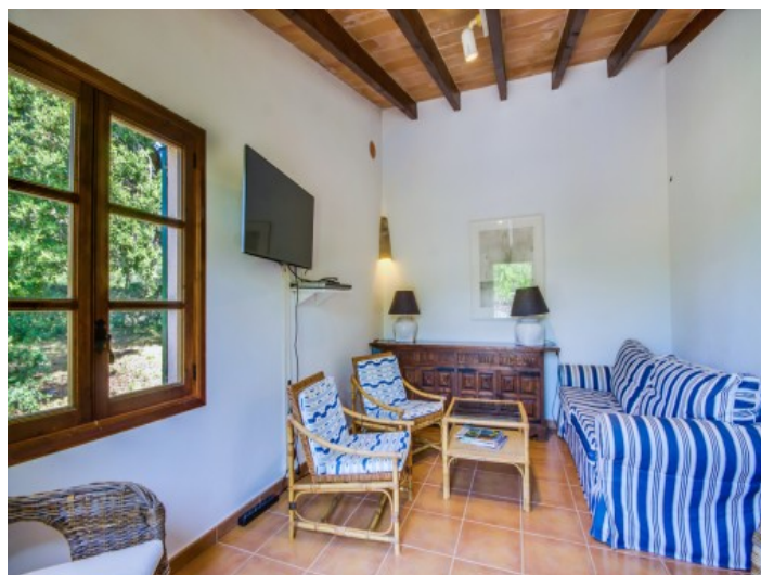
Separate living area

All information is correct to the best of our knowledge. Errors and prior sale excepted. This prospectus is purely for information purposes. Only the notarized deed of sale is legally binding.