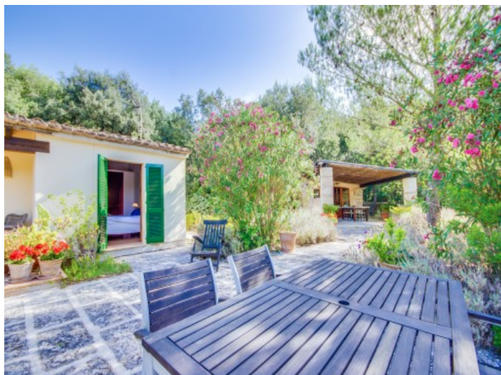
View to the guest house and exterior kitchen