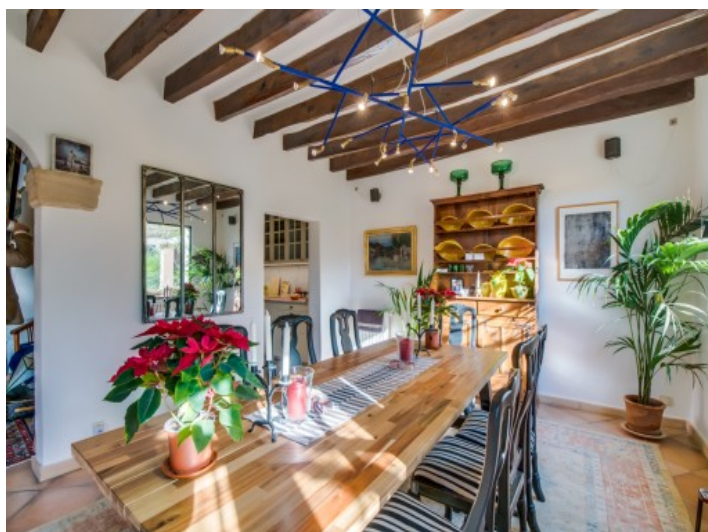
Dining area of the finca