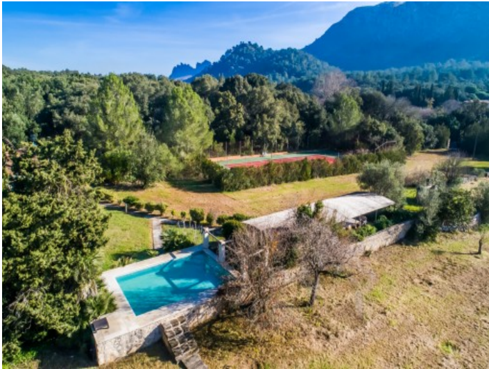
Exterior view of the property

All information is correct to the best of our knowledge. Errors and prior sale excepted. This prospectus is purely for information purposes. Only the notarized deed of sale is legally binding.