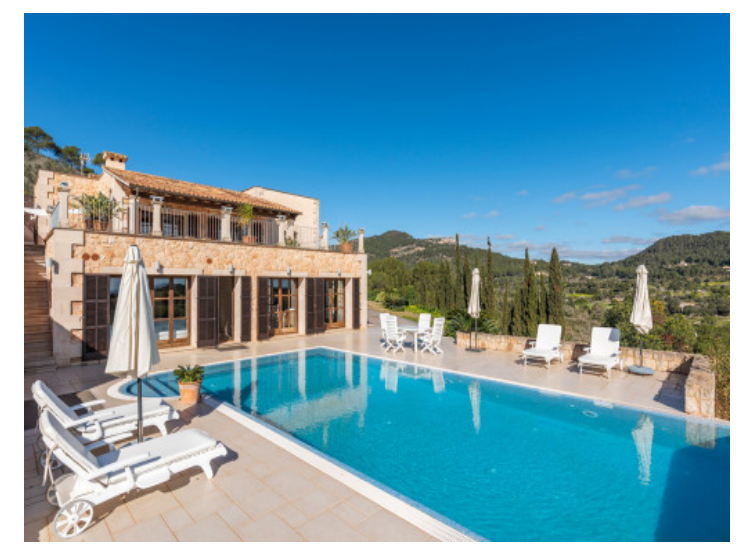
Pool area surrounded by a wonderful landscape Living area with direct access to the pool terrace All information is correct to the best of our knowledge. Errors and prior sale excepted. This prospectus is purely for information purposes. Only the notarized deed of sale is legally binding.

PORTA MALLORQUINA • THERESIENSTR.: 81, 80333 MUNICH TEL. +34 971 698 242 • INFO@PORTAMALLORQUINA.COM