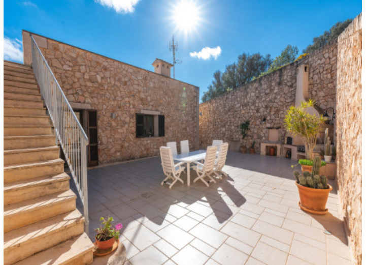
Mallorcan patio with bbq area Large master bedroom suite on the upper floor All information is correct to the best of our knowledge. Errors and prior sale excepted. This prospectus is purely for information purposes. Only the notarized deed of sale is legally binding.

PORTA MALLORQUINA • THERESIENSTR.: 81, 80333 MUNICH TEL. +34 971 698 242 • INFO@PORTAMALLORQUINA.COM