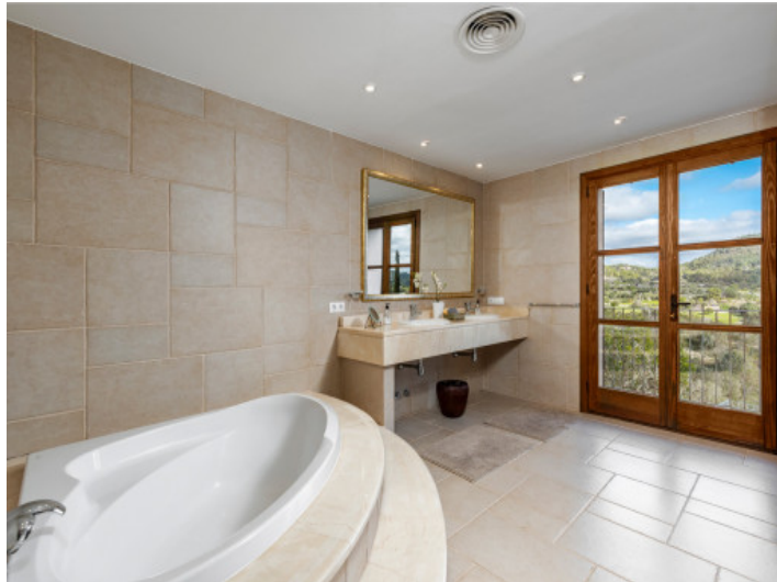
Bathroom with bathtub and a view