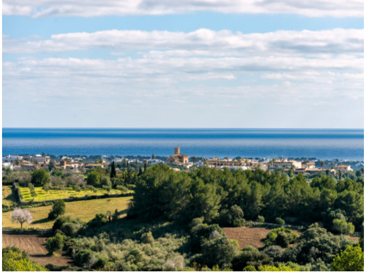
Stunning views as far as the sea