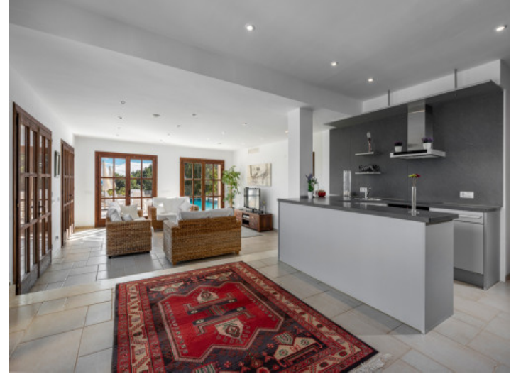
Open, modern kitchen in the living area

PORTA MALLORQUINA® Your home. Our passion.