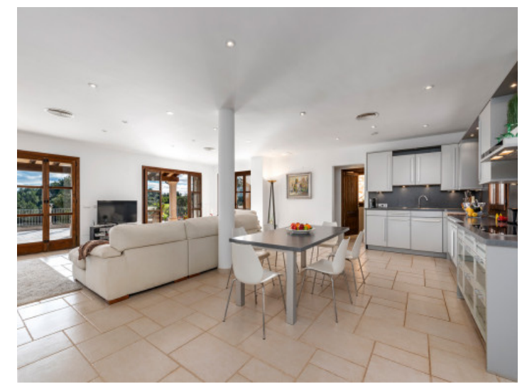
Open kitchen and dining area