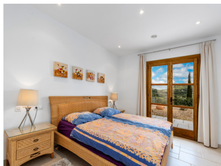
Further ground floor bedroom