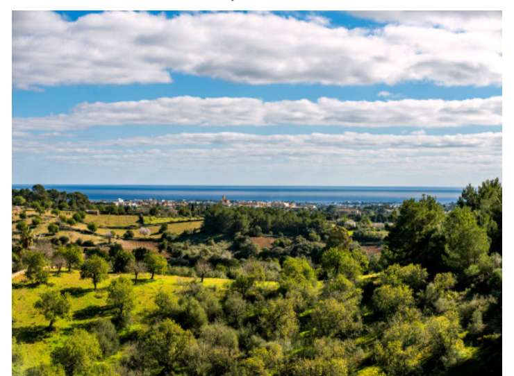
Dreamlike sweeping views Views to the hilly landscape All information is correct to the best of our knowledge. Errors and prior sale excepted. This prospectus is purely for information purposes. Only the notarized deed of sale is legally binding.