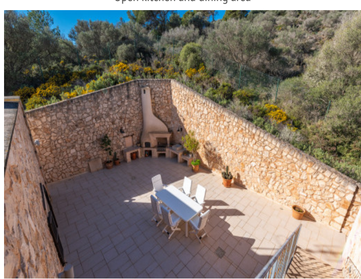
View into the indoor patio