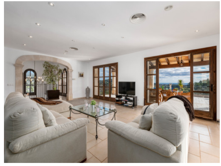
Generous living area on the upper floor

PORTA MALLORQUINA® Your home. Our passion.