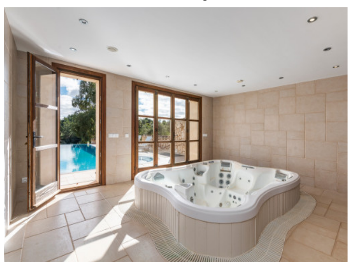
Jacuzzi room with access of the pool area Elegant access to the upper floor All information is correct to the best of our knowledge. Errors and prior sale excepted. This prospectus is purely for information purposes. Only the notarized deed of sale is legally binding.

PORTA MALLORQUINA • THERESIENSTR.: 81, 80333 MUNICH TEL. +34 971 698 242 • INFO@PORTAMALLORQUINA.COM