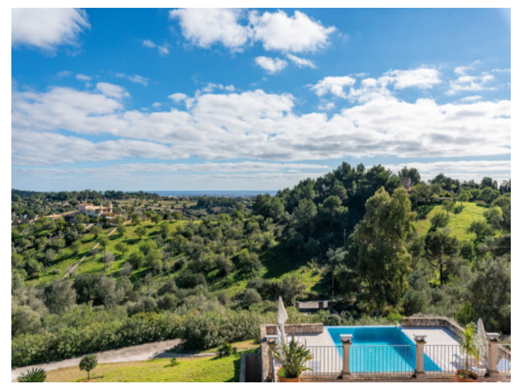
Enchanting panoramic views over the landscape