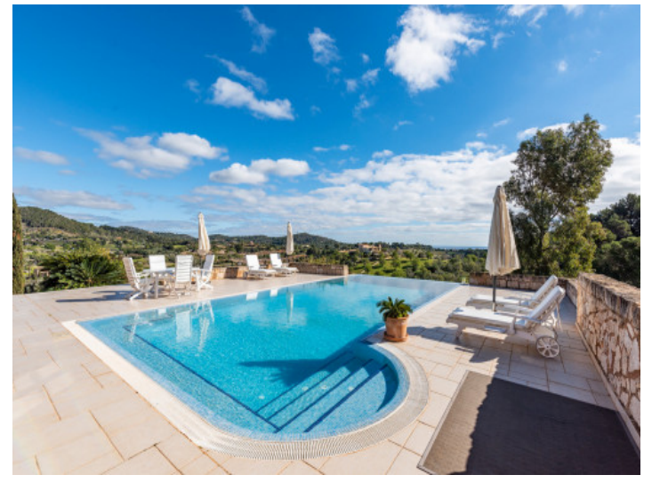
Sunny pool area