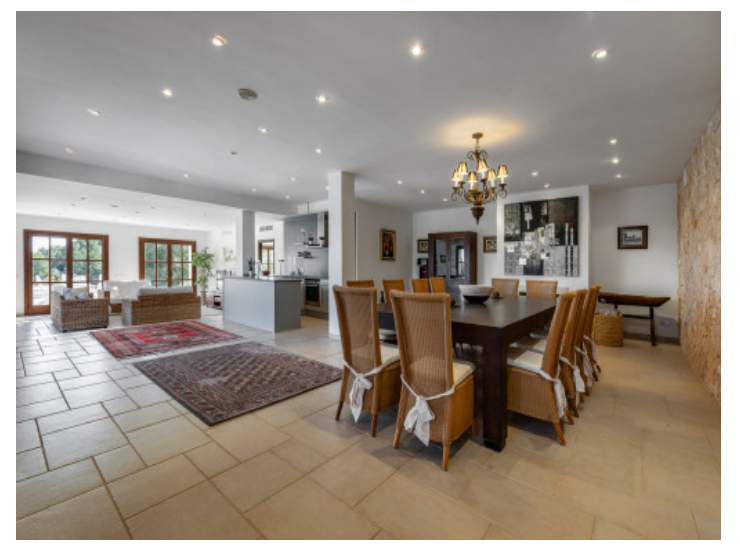
Large living area with dining area